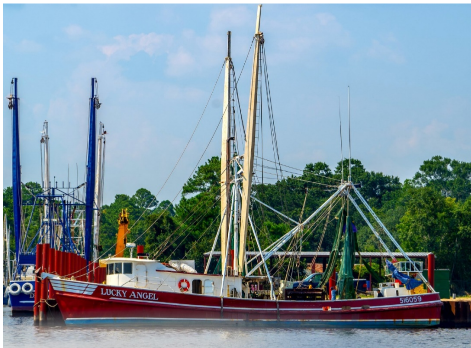
Figure 1. Lucky Angel pierside at Bayou La Batre, Alabama, before the accident.

On December 10, 2020, about 2205 local time, the fishing vessel Lucky Angel was trawling for shrimp in the Gulf of Mexico, 20 miles from Pascagoula, Mississippi, when a fire broke out in the vessel's engine room. 1 The three crewmembers attempted to fight the fire but were forced to abandon the vessel. They were rescued by the US Coast Guard, and the vessel sank 2 days later. No pollution was reported, but there was one minor injury. The vessel was a total constructive loss with an estimated value of $120,000.