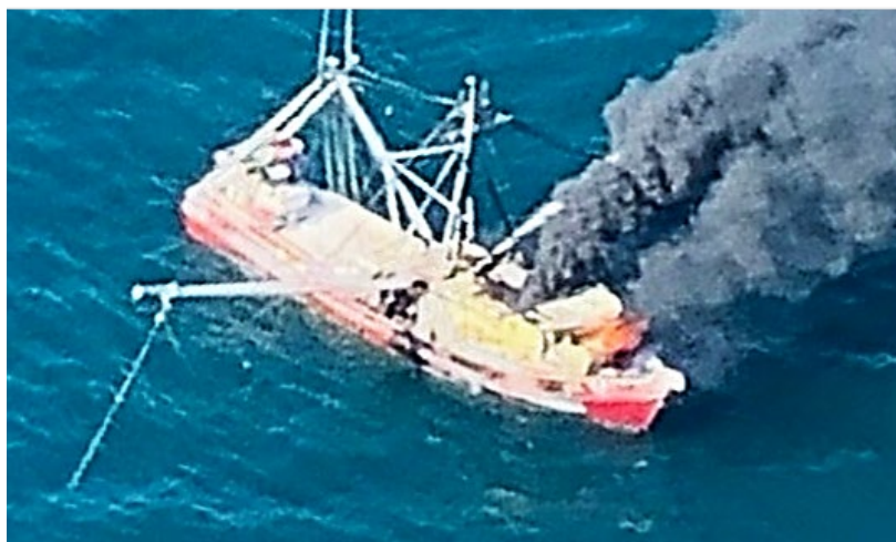
Figure 4. Lucky Angel on fire, December 11.

abandoned the vessel from the starboard side of the boat; however, the vessel's Emergency Position Indicating Radio Beacon and lifejackets, which were kept in the wheelhouse and were now inaccessible due to the smoke, were left on board. The crew were recovered by the Coast Guard rescue boat at 2327. The Lucky Angel continued to burn through the next day and sank on December 12 about 3.5 miles south of Horn Island, Mississippi. The vessel was not salvaged.