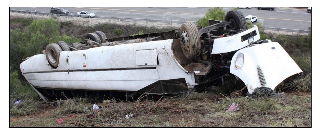
Figure 3. Overturned bus on embankment.

As a result of this crash, 3 passengers died, 12 passengers sustained serious injuries, and 5 passengers and the driver received minor injuries.