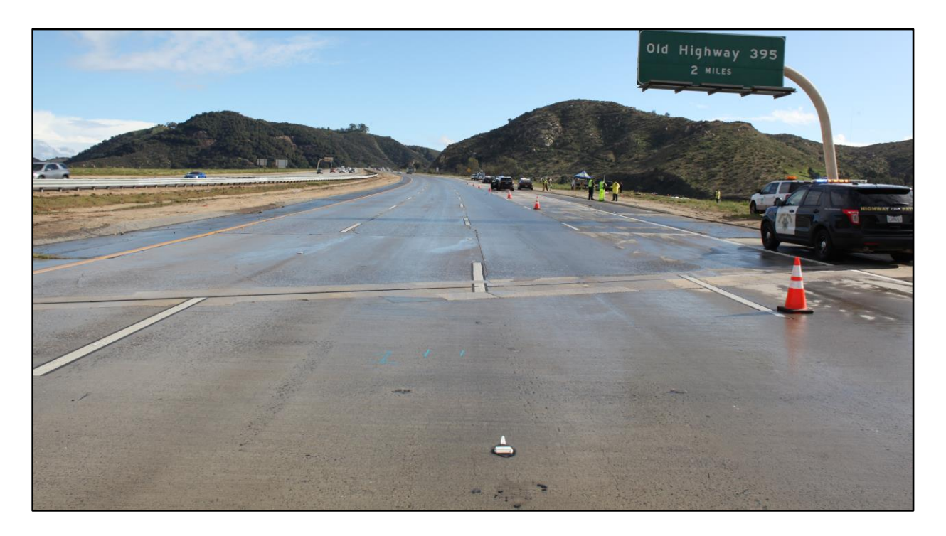
Figure 5. Looking south at I-15 southbound lanes from south end of bridge. Photograph taken at 2:53 p.m., about 30 minutes after second rainfall event on crash day ended.

Passengers on the crash bus and drivers of vehicles traveling behind the bus at the time of the crash provided statements to the CHP and the NTSB regarding the crash circumstances. Their statements regarding the rainfall at the time varied considerably and included the following: