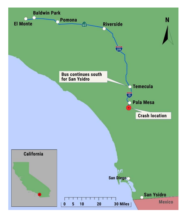
Figure 1. Map showing location of crash.

On Saturday, February 22, 2020, about 10:23 a.m. Pacific standard time, a bus departed the southbound lanes of Interstate 15 (I-15) just past a bridge over the San Luis Rey River and overturned in Pala Mesa, San Diego County, California.<sup>1</sup> The bus, consisting of a 2014 Freightliner chassis with a General Coach America 30-passenger coach body, was operated by Executive Lines Inc. and occupied by a 52-year-old driver and 20 passengers. The southbound bus had departed El Monte, California, about 7:30 a.m., en route to San Ysidro, California, and had made several stops on its way (see figures 1 and 2).