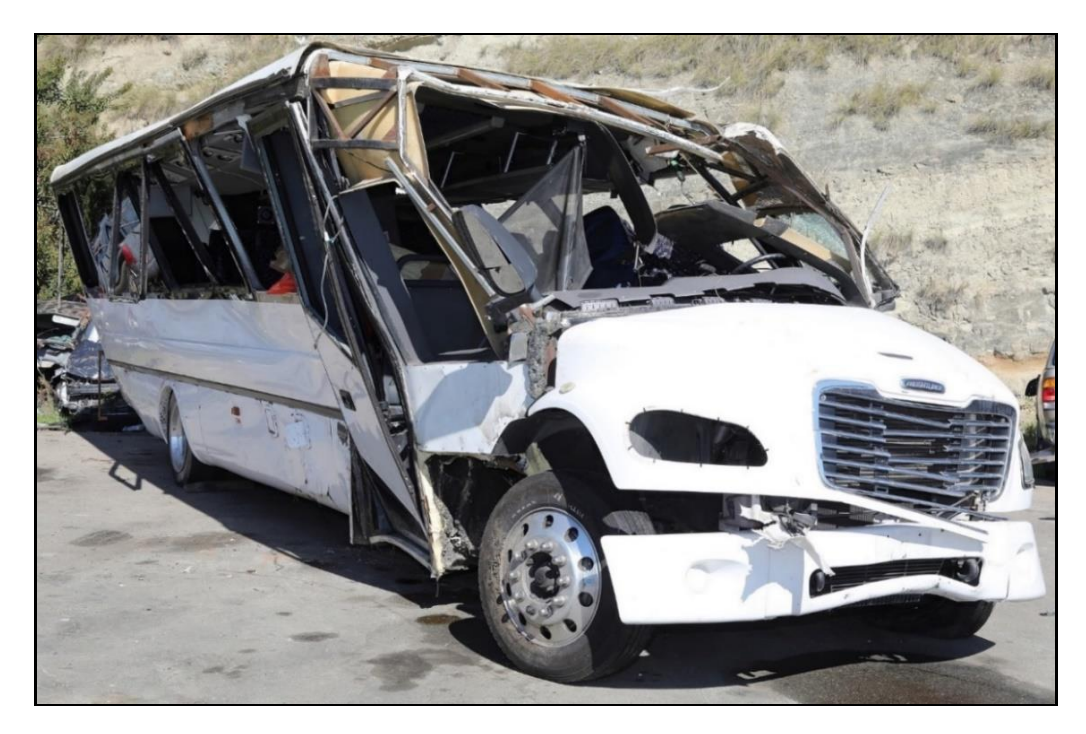
Figure 8. View of damage to front and right side of bus.