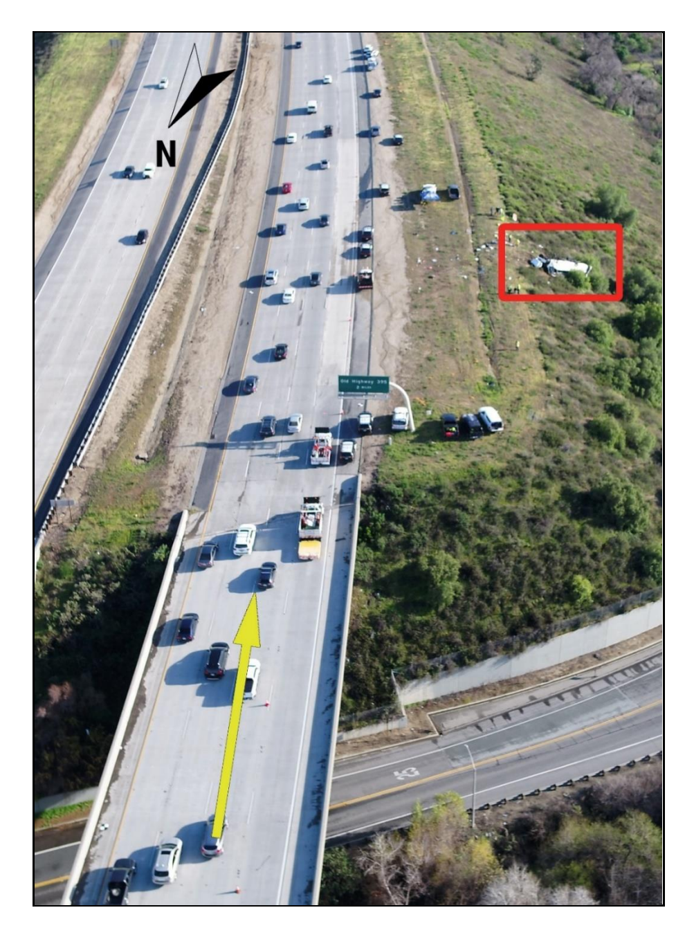
Figure 2. Aerial view of crash area showing bus's southbound direction of travel (yellow arrow) and rest position (enclosed by red rectangle). The bridge crosses over both the San Luis Rey River and Dulin Road. [Note: This figure is not standard-compass-oriented. The bottom of the figure is roughly "north," and the top is roughly "south."]

The bus had left its last stop in Temecula, California, about 15 minutes before approaching the bridge over the San Luis Rey River. In this area, I-15 is an eight-lane, divided highway with the northbound and southbound lanes separated by a