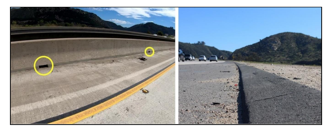
Figure 6. Drainage devices along southbound lanes in area of crash. Depicted are (left image) scupper drains along the left shoulder on the bridge and (right image) a drainage dike along the right shoulder past the bridge.

mountable drainage dikes border the edges of paved shoulders and channel stormwater to drainage inlets and catch basins along the roadway (see figure 6).<sup>20</sup> The median has concrete-lined drainage ditches that channel the stormwater to nine drains at the ditch bottoms. CHP and NTSB investigators visually inspected the drainage inlets, slots, and scupper and area drains, and found them to be clear of major debris.