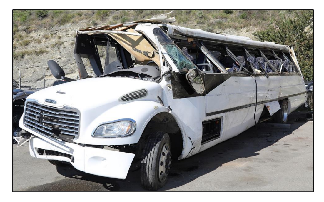
Figure 7. View of damage to front and left side of bus.

located between seat rows 2 and 3, the bus's interior height decreased from 84 inches, as constructed, to 54 inches postcrash.