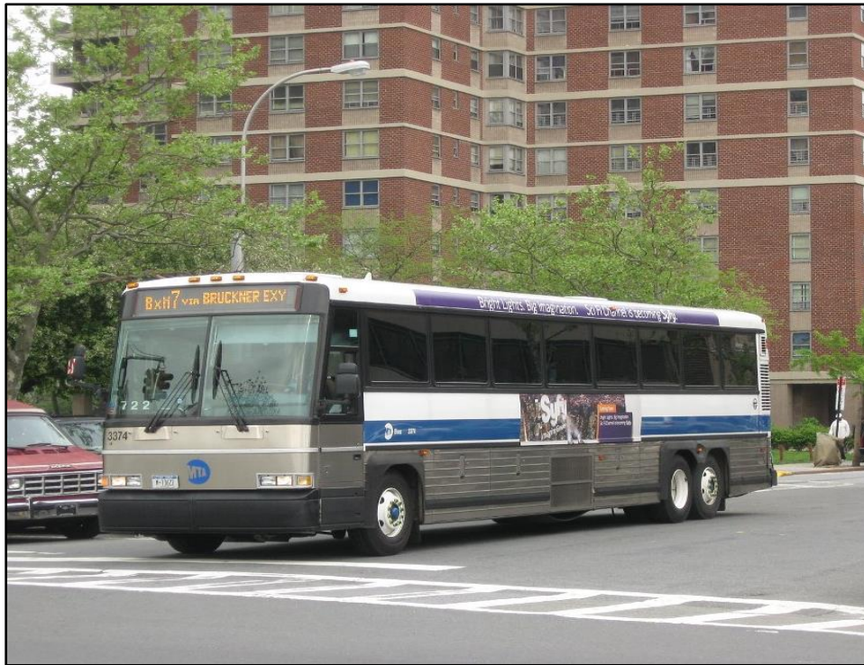
Figure 4. Exemplar transit bus of same make and model as one that fatally struck pedestrian.

The striking vehicle was a 2006 Motor Coach Industries model DL4500 transit bus that could hold a maximum of 61 passengers (an exemplar vehicle is shown in figure 4). It had undergone a scheduled comprehensive inspection 3 weeks earlier, on October 3. According to MTA records, all repairs were completed, and the bus returned to service on October 13.