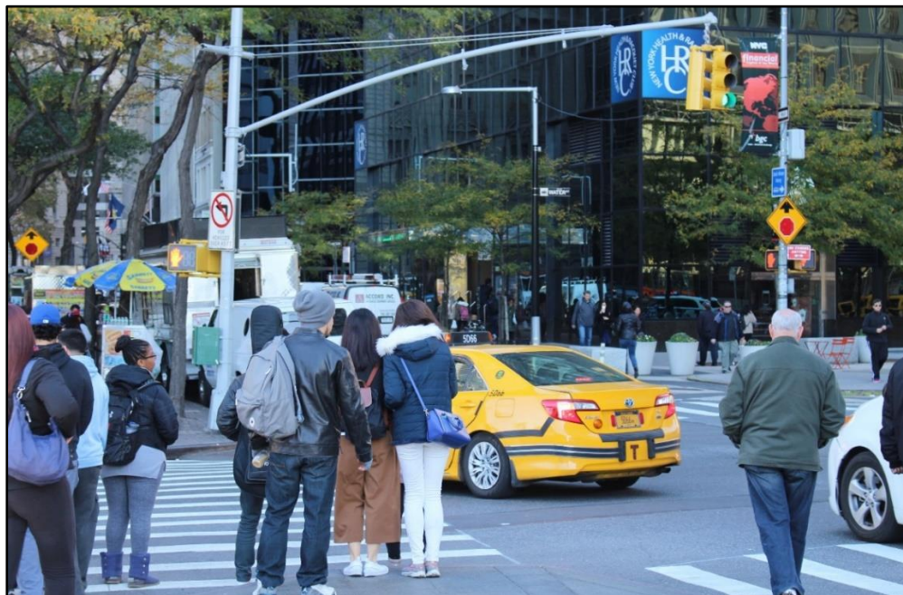
Figure 3. Intersection in Lower Manhattan where crash occurred. Pedestrians are standing at crosswalk on southwest corner of intersection. Taxi is turning left from Whitehall Street into Water Street where it becomes State Street.