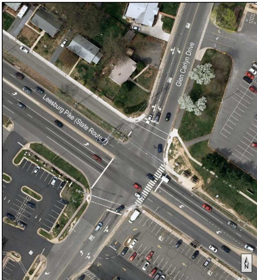
Figure 2. Aerial view of crash location showing intersecting roadways, crosswalk, and surrounding businesses. (Base map by Google Earth)

The area around the intersection includes sidewalks for pedestrians as well as marked pedestrian crosswalks (figure 2). Pedestrian-walk phases are incorporated in the timing sequence for the traffic lights at the intersection. A shopping center is located on the south side of Leesburg Pike. Metrobus stops and shelters are found on both sides of the highway—two shelters near the northeast corner of the intersection, and a smaller shelter in the middle of the block on the south side of Leesburg Pike (refer to figure 1). Local residents and law enforcement officers told investigators that pedestrian and bus traffic in the area is heavy.