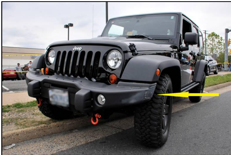
Figure 3. Photograph showing minor contact damage (arrow) to left front bumper of SUV.

The crash vehicle was a 2012 Jeep Wrangler SUV. The owner purchased the vehicle in 2012 and was familiar with its operation. He stated that the SUV had no mechanical problems and had been in only one other collision, a minor one in 2012. The SUV was examined on the scene by law enforcement officers and NTSB investigators, who observed minor damage to the area of the left front bumper (figure 3).