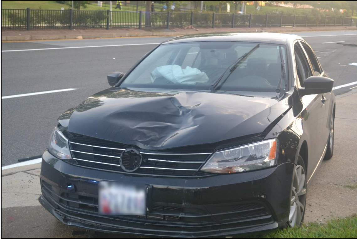
Figure 3. Photograph of crash car showing contact damage to hood. Inflated passenger air bag is visible behind windshield.

After the crash, police investigators downloaded data from the vehicle's air bag control module (ACM). The ACM recorded data from several sensors, indicating that the Volkswagen had a frontal crash that caused the driver and front-passenger air bags to deploy. Five seconds before the crash, the vehicle was traveling forward at 58 mph, according to the ACM data. The data also indicate that in the 0.25 second following the crash, the car accelerated while veering to the left at about 6 mph. The car's brake switch was not activated before the crash. During the crash, the driver was restrained by a lap/shoulder belt, and the passenger was unbelted.