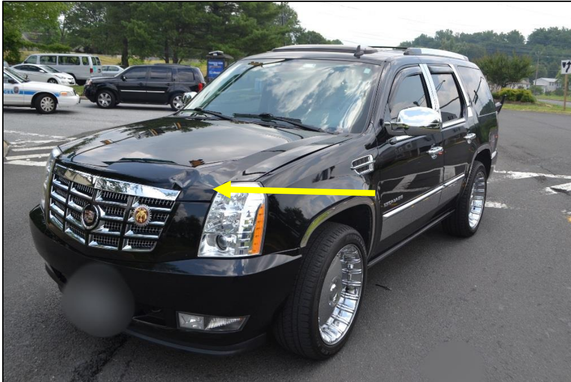
Figure 3. Photograph of front of SUV showing damage to hood (arrow).

The SUV was examined at the crash scene. It had contact damage on the left leading edge of the hood (figure 3). The grill was cracked, and ornamental trim around the wheel well on the front left fender was bent. No other crash-related damage was noted.