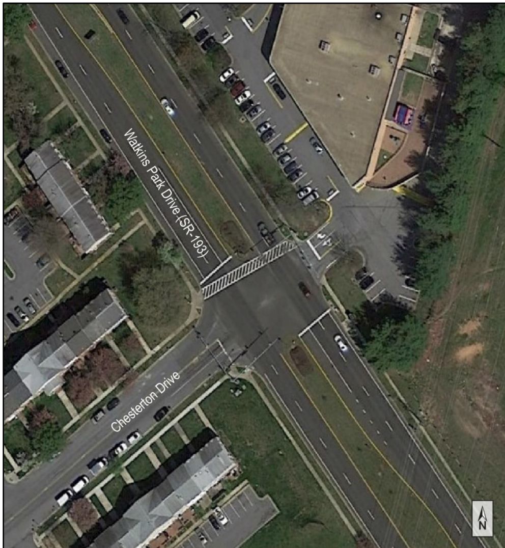
Figure 2. Aerial view of intersection of Watkins Park Drive and Chesterton Drive in Upper Marlboro, also showing parking lot and exit (upper right) near crash site.

at the intersection. The lanes of opposing travel are separated by a 25-foot-wide grassy median. Each outer edge of the roadway is bordered by a raised concrete curb and a sidewalk.