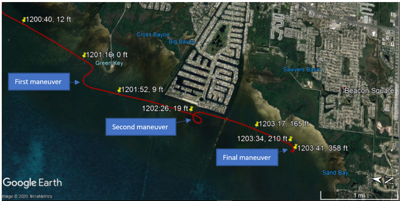
Figure 1. Last 3 minutes of GPS flight track.

The airplane was also equipped with a Rotax engine control unit. The last recorded data point, at 1203:43, indicated an engine speed of 2,829 rpm and a throttle position of 27%.