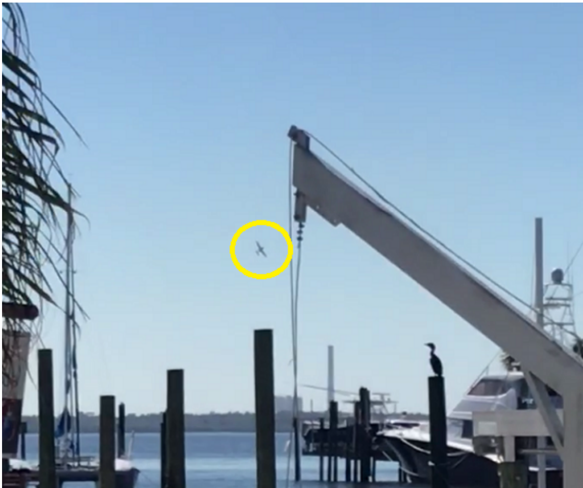
Figure 2. Still image of the accident airplane just before the crash