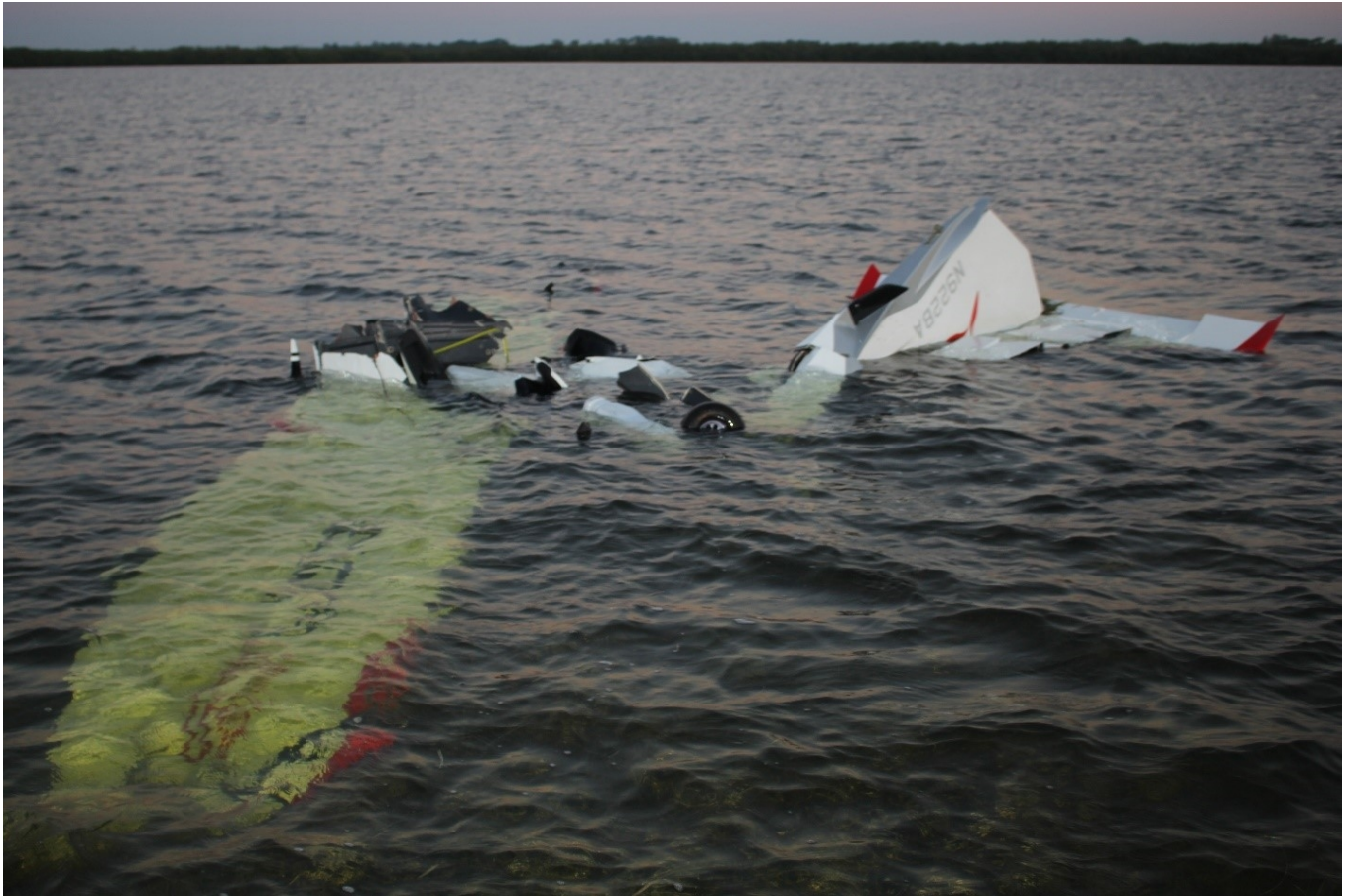
Figure 4. Airplane wreckage at the accident scene.

The CAP system was not deployed, and the CAP cockpit handle pin was in its installed position. The fuselage canopy was located about 50 ft west of the wreckage with about 50% of the plexiglass fractured and missing. The left (pilot's) seat was separated from the fuselage. The pilot's three-point harness system was anchored securely to the left wall with the inertia reel intact, secure, and fully operable. The webbing exhibited fraying about 12 inches from the reel. The seatbelt buckle operated normally and locked in place when the tab was inserted.