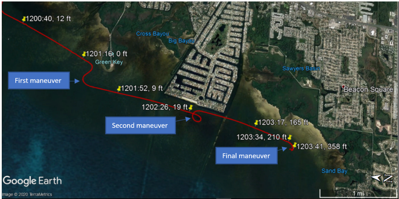
Figure 1. Last 3 minutes of GPS flight track.

The airplane was also equipped with a Rotax engine control unit. The last recorded data point, at 1203:43, indicated an engine speed of 2,829 rpm and a throttle position of 27%.