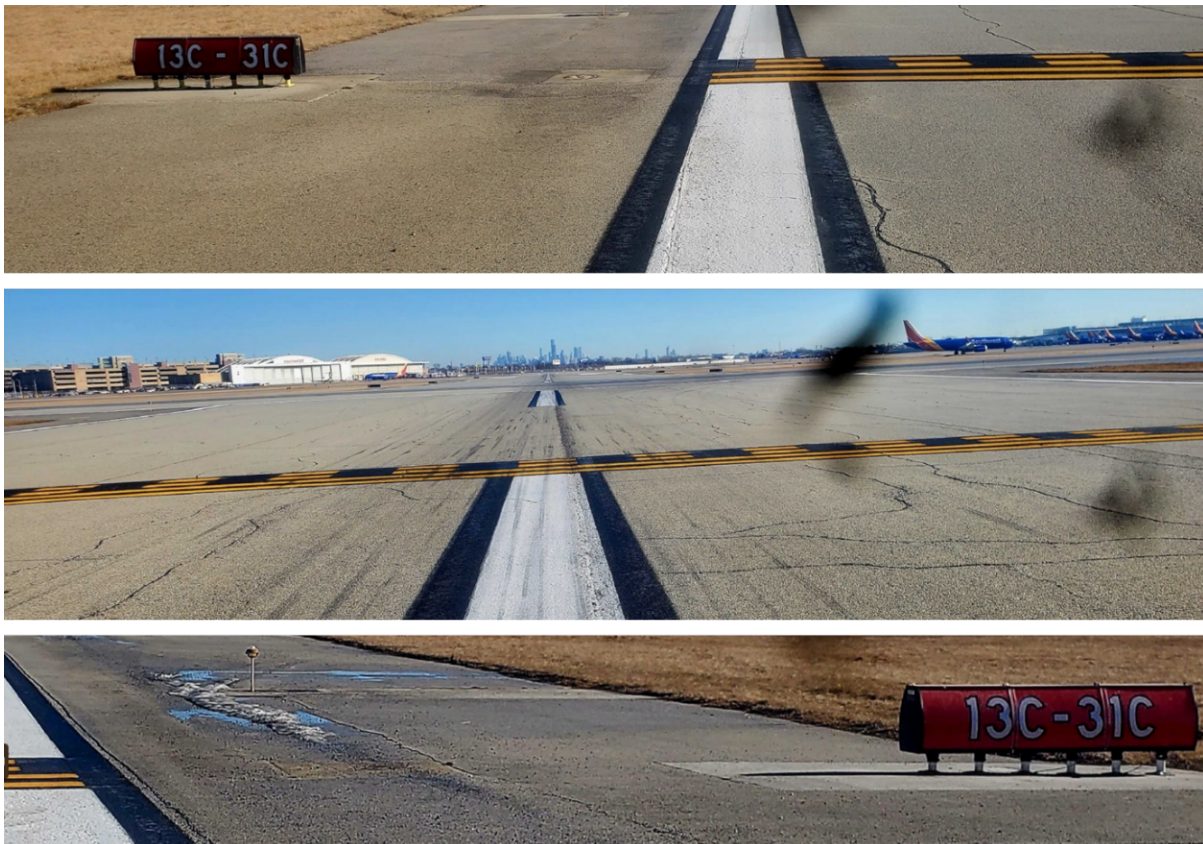
Figure 4. Photos of the hold short line for runway 13C/31C

Certified ADS-B data and audio recordings were provided to the NTSB by the FAA. In addition, photos were provided by Midway Airport Operations of the runway environment showing the runway signs (vertical white-on-red signs erected on either side of the runway hold short position markings) and the hold short line for runway 13C/31C (figure 4).