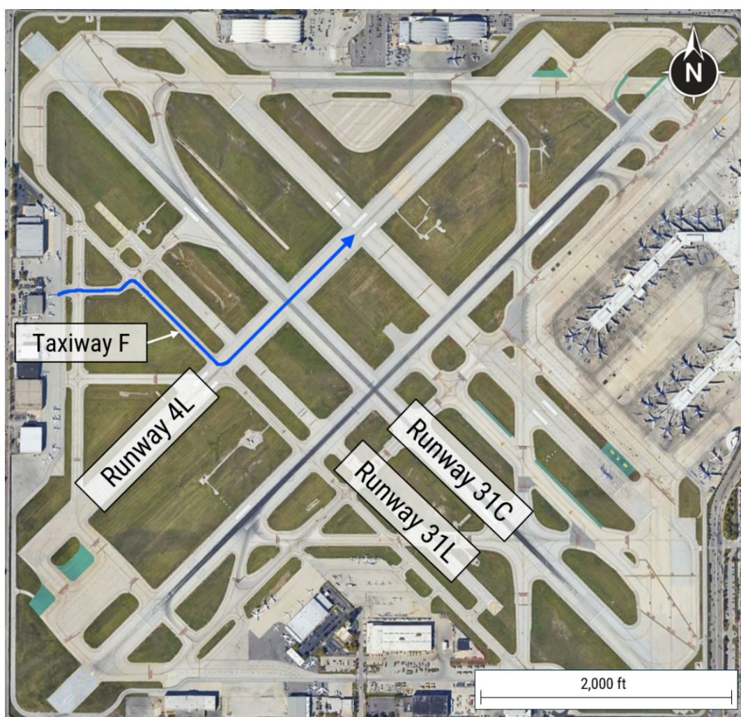
Figure 3. The blue line shows the taxi route for LXJ560.

They indicated that they called MDW ground control and asked for taxi instructions from the signature ramp at “whiskey”, however, the crew stated the response they received did not make sense to them. They were initially given a clearance to taxi to runway 22L via F taxiway and to hold short of 4L. After the flight crew requested ground control to clarify the taxi instructions, they were given a new taxi route of taxiway A to taxiway F with a hold short of runway 04L/22R (figure 3). When they were on Taxiway F, ground control instructed them to turn left onto runway 04L, cross runway 31L and then hold short of runway 31C. The flight crew initially read back the instructions incorrectly; however, the ground controller immediately reissued the instructions and received a correct readback.