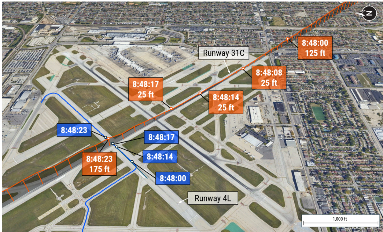
Figure 1. Flight paths for SWA2504 (orange) and ground path for LXJ560 (blue) with times and altitudes.