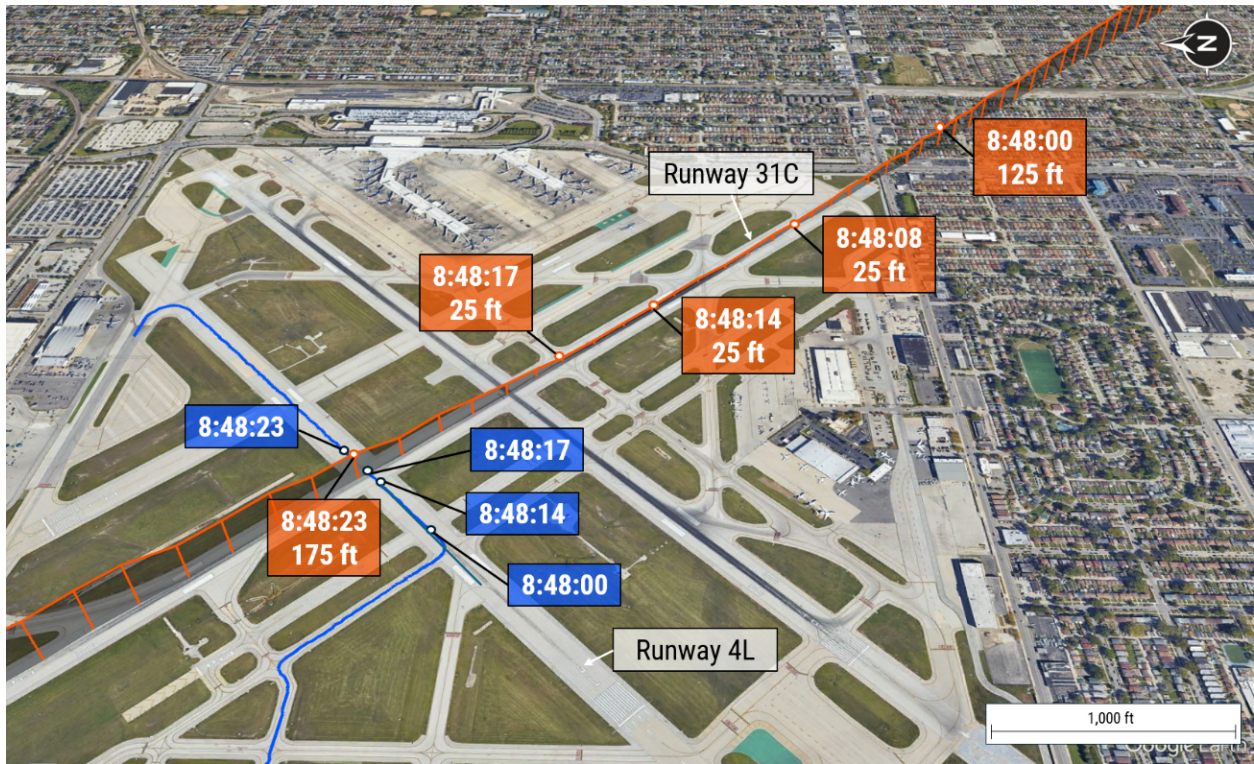
Figure 1. Flight paths for SWA2504 (orange) and ground path for LXJ560 (blue) with times and altitudes.