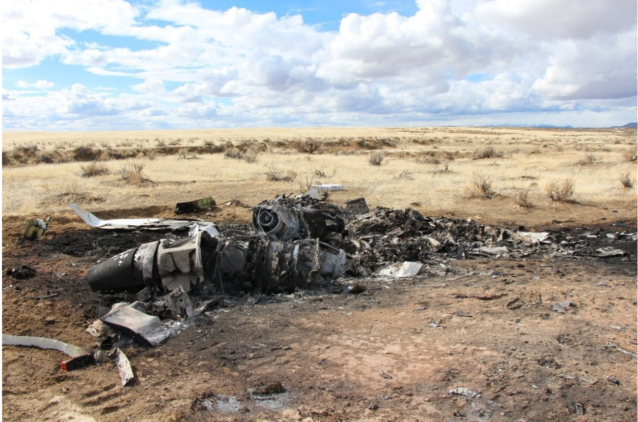
Figure 2: Accident site main wreckage