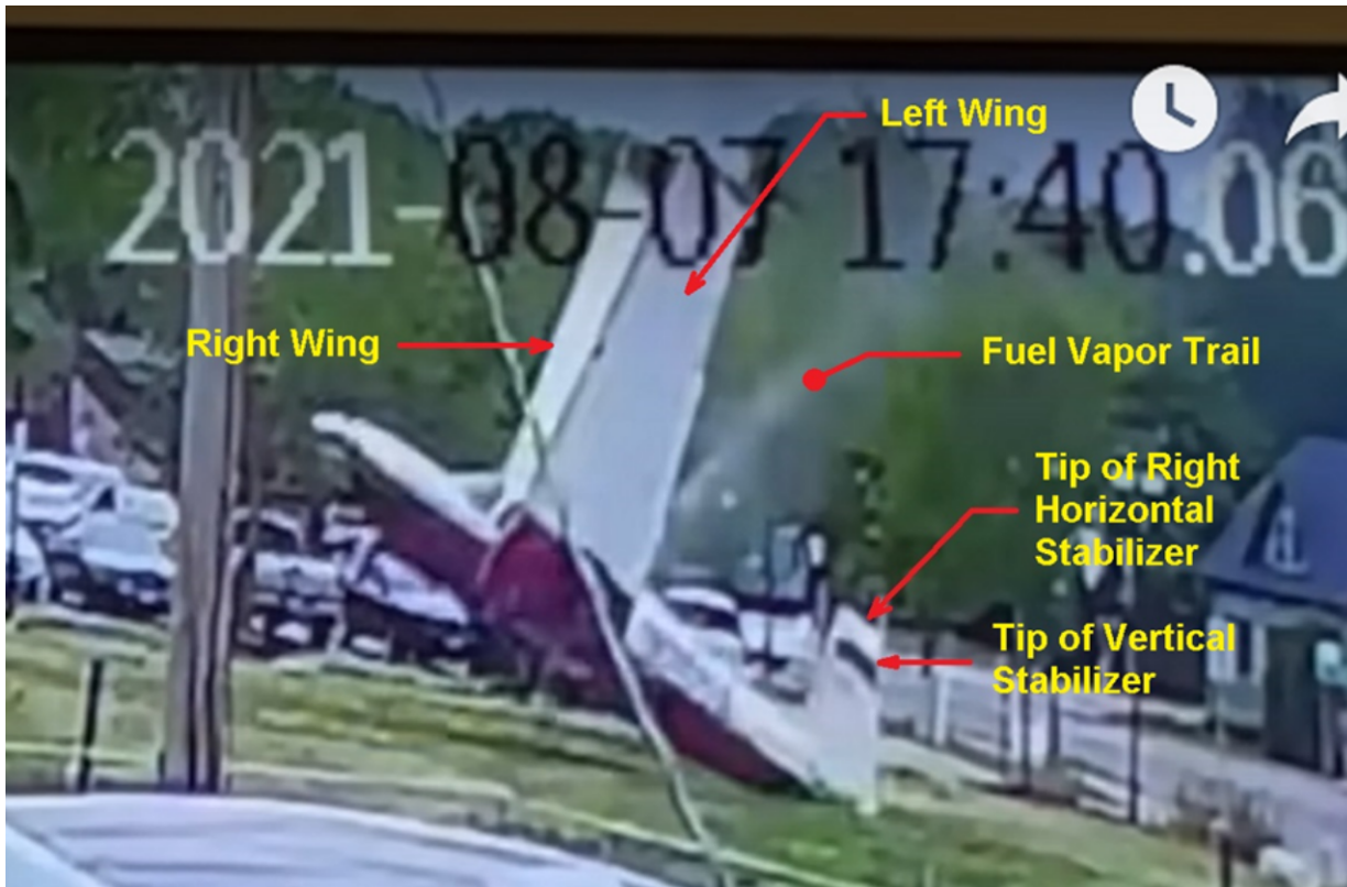
Figure 1. Screen capture of airplane just before impact.