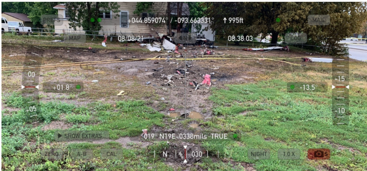
Figure 2. Airplane at accident site with parametric data overlaid.

The airplane impacted the ground on a northerly heading (see figure 2). The left horizontal stabilizer and left elevator were found about 720 and 800 ft southwest of the accident site, respectively. A 6-inch section of the main wing spar upper cap splice plate was found about 300 ft southwest of the accident site.