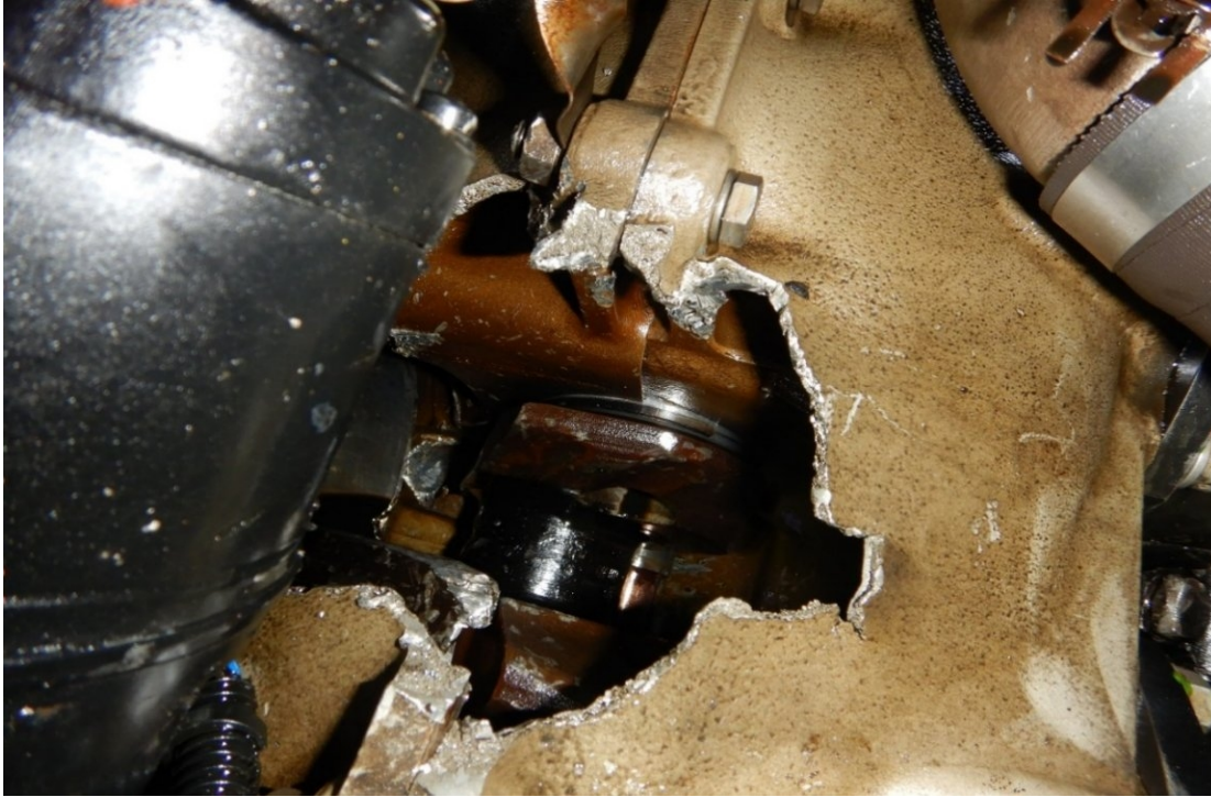
Figure 1. – Crankcase damage and view of interior engine components.

The No. 2 connecting rod and piston were separated from the crankshaft. The left half of the No. 2 main bearing was found rotated about 15° within the saddle area and overlapping the right half of No. 2 bearing. The left bearing half was shifted forward about 1/8 of an inch from its original position.