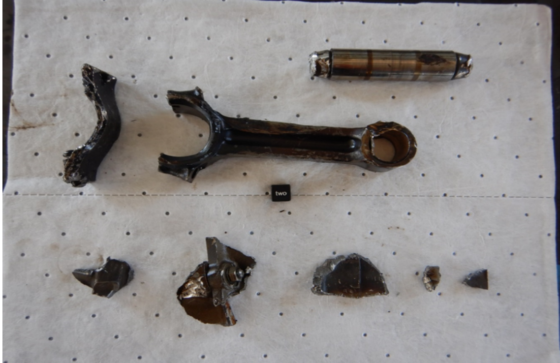
Figure 2. No. 2 connecting rod, piston, crankcase pieces, and piston material.