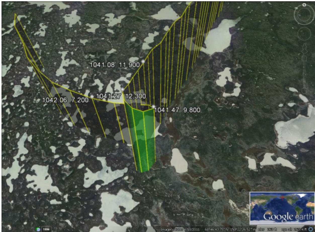
Figure 1. A graphical depiction of the flight path and altitude of the airplane at certain points during the loss of control portion of the flight.

FDR data shows the engines were set about 70% of maximum torque when the airplane leveled off at 10,000 feet where they remained until the upset event. After the left roll, the engine power was reduced to about 30% of maximum torque for about 10 seconds before being increased above 100% exceeding the torque limitations. The engine power was reduced to about 90% before the airplane reached its lowest altitude and leveled off before being increased again further above 100% than previously.