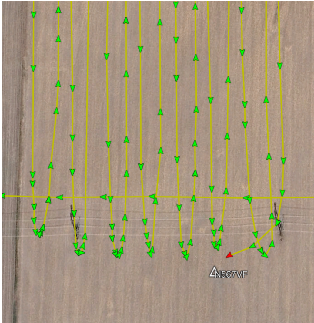
Figure 1. ADS-B Data with Wreckage Location

A resident who lives about 1.4 miles to the west of the accident site reported hearing and seeing the helicopter as it sprayed the field. The engine sounded normal until she did not hear an engine sound. When she looked over towards the field, she saw a plume of dust.