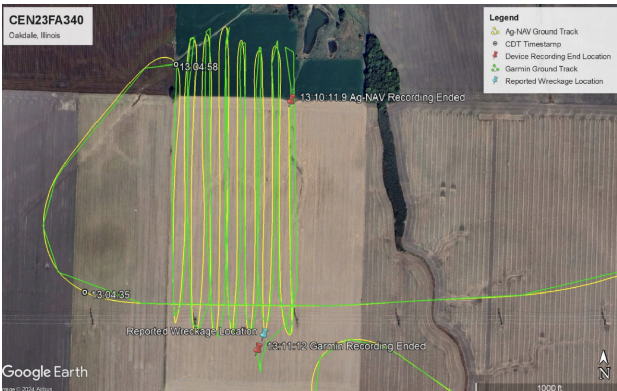
Figure 2. Charted Ag-Nav & Garmin GPS Data

Data extracted from the Garmin Aera 510 included the accident flight and recorded data from 0710:31 to 1311:12. The data rate varied from 1 second per sample to greater than 60 seconds per sample.