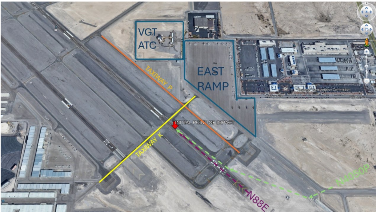
Figure 2. View of initial point of impact in relation to Taxiway Papa, Taxiway Kilo, the East Ramp, and ATC.

At 10:27, the controller instructed the accident helicopter to, when able, make a right turn on taxiway Kilo, and that landing on the east ramp was at the pilot's own risk. (See Figure 2.) The pilot responded by stating "Las Vegas tower, five zero papa." The controller again instructed the helicopter pilot to make a right turn onto taxiway Kilo. The pilot did not acknowledge the instruction.