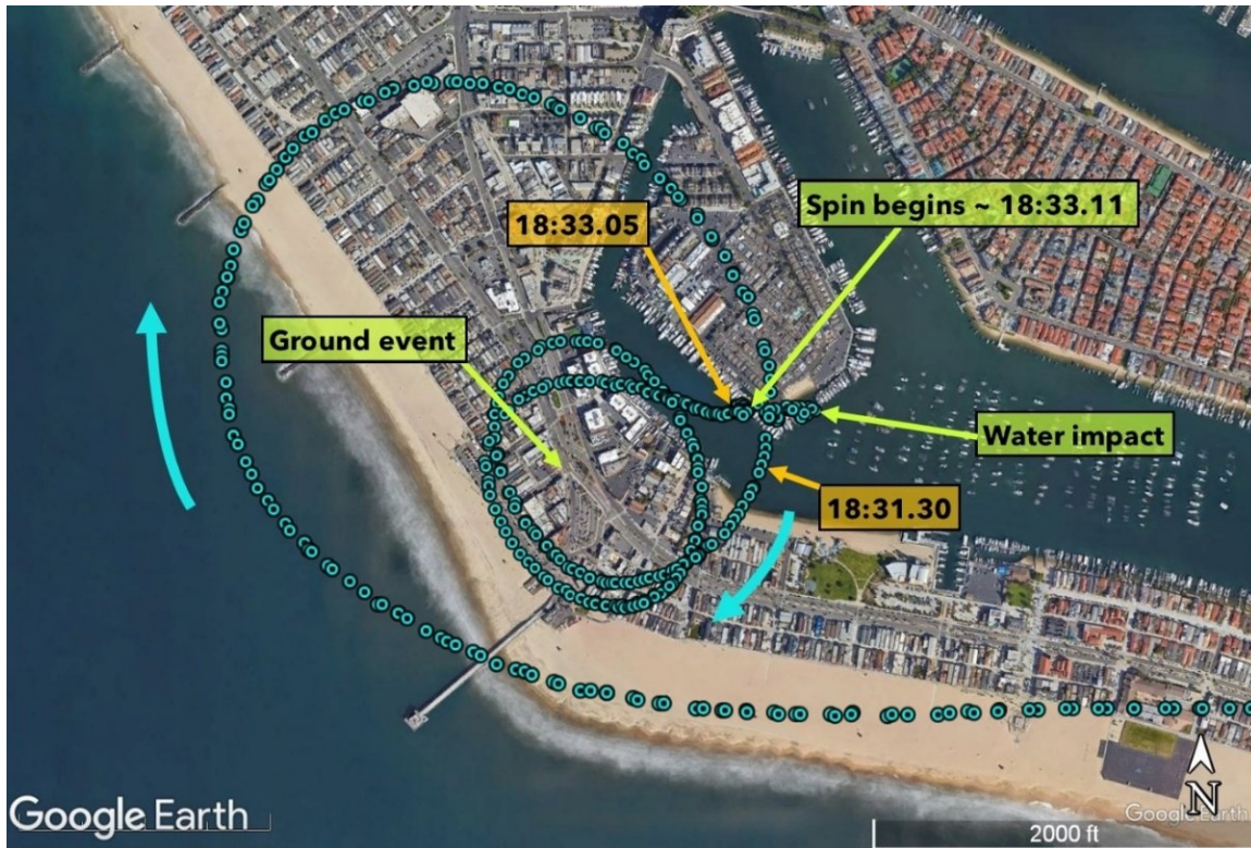
Figure 1 – Final flight path segment

The pilot stated that the rotation became more aggressive, and he began to modulate the throttle, collective, and cyclic controls to try to arrest the rotation rate. He stated that his efforts appeared to be partially effective, as the helicopter appeared to respond; however, because it was dark, he had no horizon or accurate external visual reference as the ground approached. The engine continued to operate, and he chose not to perform an autorotation because the area was heavily populated. He then had a sense that impact was imminent, so he pulled the collective control in an effort to bleed off airspeed.