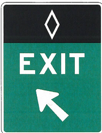
Fig. 3. Exit Gore sign at a direct exit from a preferential lane.