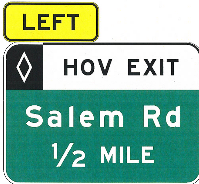
Fig. 1. Example of an Advance Exit Guide sign for a direct exit from a preferential lane.