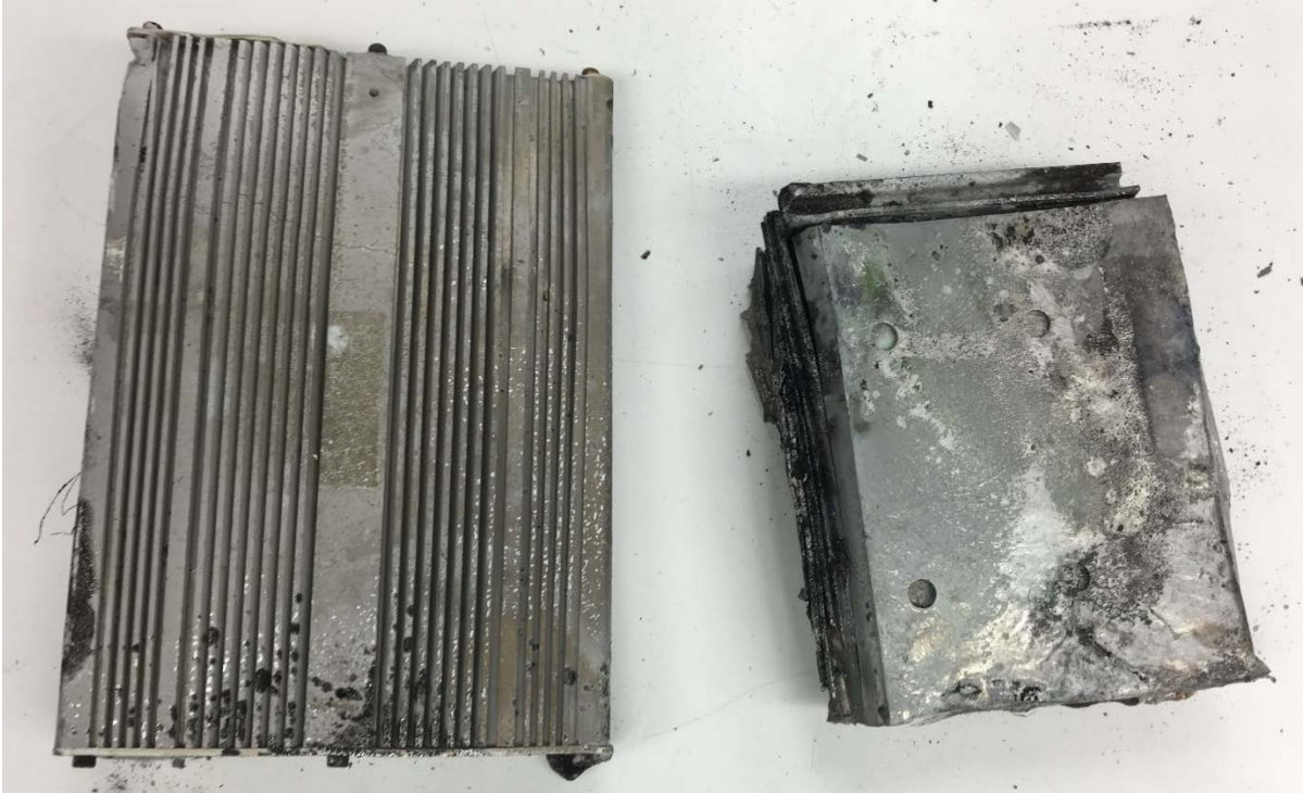
Figure 1. Image showing the top of the recording system and the hard drive casing after removal from the school bus.

the hard drive was removed. The hard drive was sent to a third party hard drive recovery company for further analysis. Figures 1 through 4 show the extent of the damage and the disassembly of the device. Figure 5 shows an exemplar undamaged version of the hard drive and suspension system.