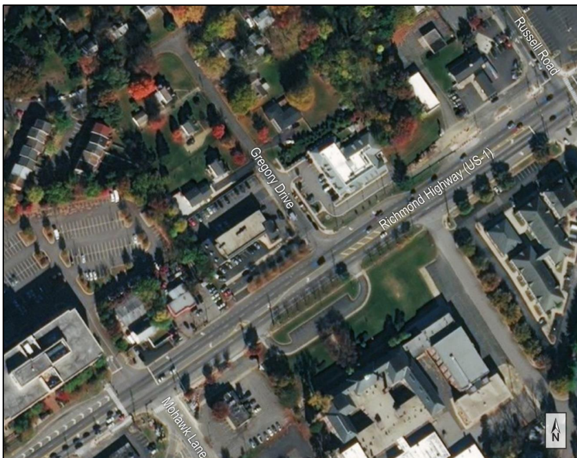
Figure 2. Aerial view of crash location showing nearest intersection to crash site (Gregory Drive), nearest pedestrian crosswalks (at Russell Road and Mohawk Lane), surrounding buildings and parking lots, and nearby residential neighborhood.

right-turn-only lane is about 15 feet wide. The speed limit in this area of Richmond Highway is 45 mph. Figure 2 is an aerial view of the area near the crash site.