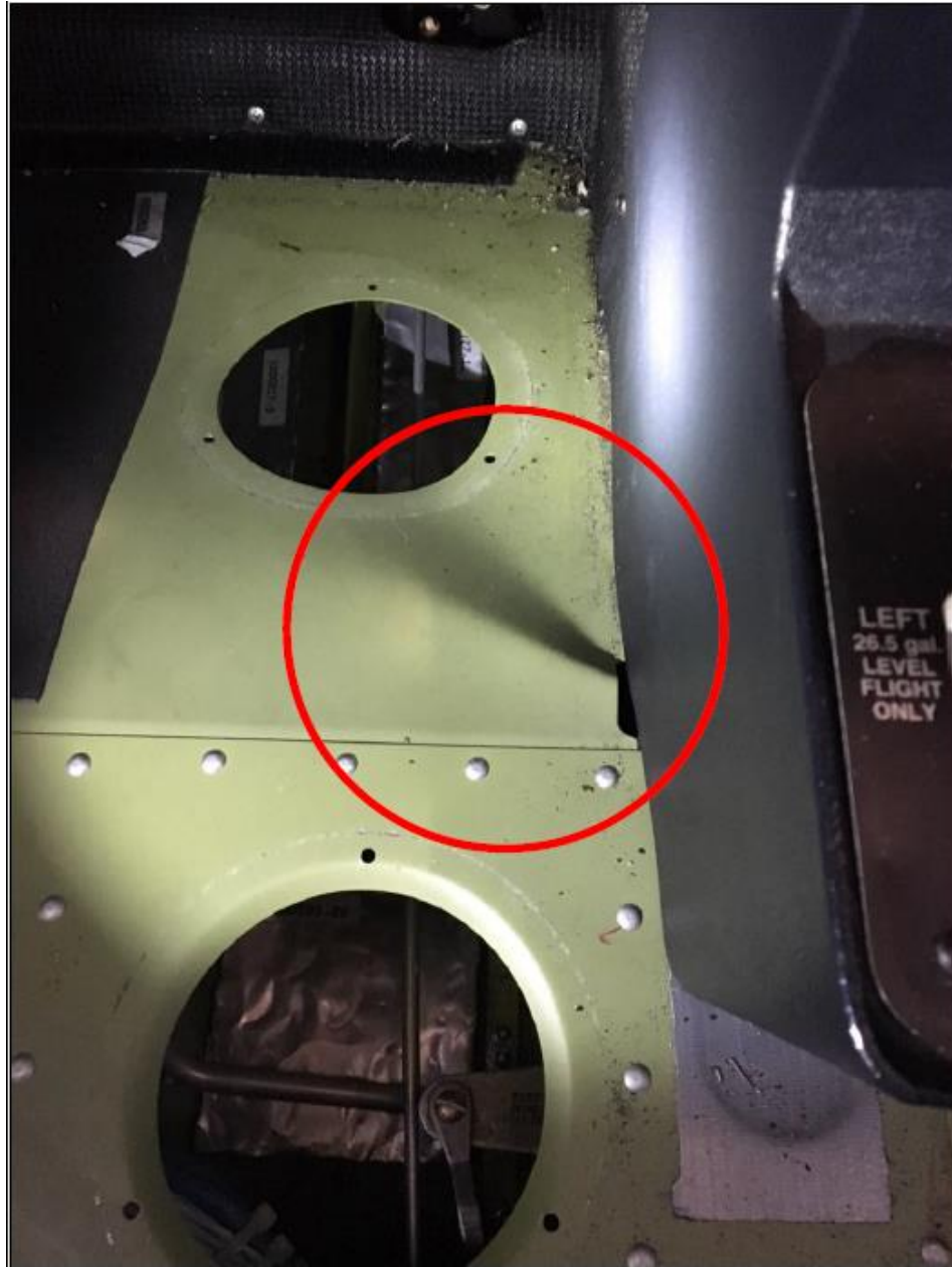
Photo 1 – View of left cabin floor panel