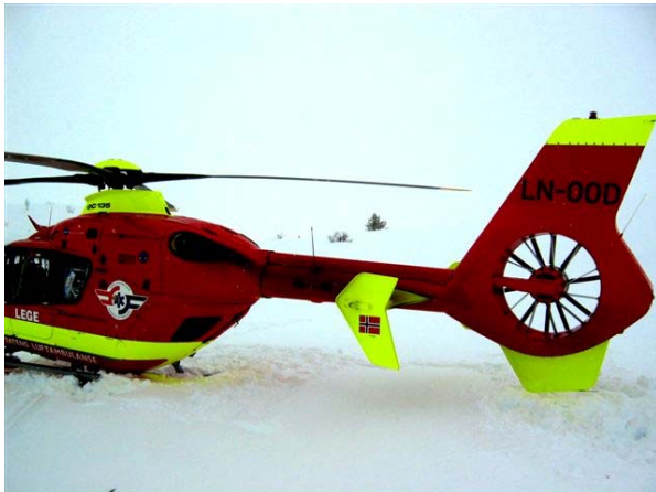
Fig. 3 Left side