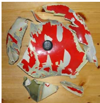
Fig. 5a Pieces of the hub cover