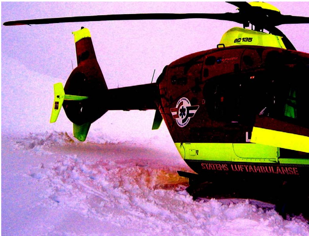
Fig. 1 Note the pile of snow to the right of the tail bumper (brightness/contrast adjusted to show details in snow)

The tail bumper is actually part of the aerodynamic stabilising vertical tail surface and is mounted a little diagonally of the helicopter's longitudinal axis. The airflow goes through the Fenestron from right to left.