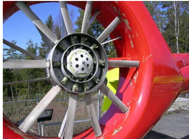
Fig. 4 Damaged tunnel and deformed blade tips