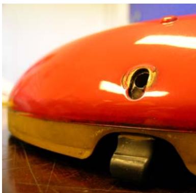
Fig. 6a Illustration photo: Cover with retaining clips (bolt not mounted)