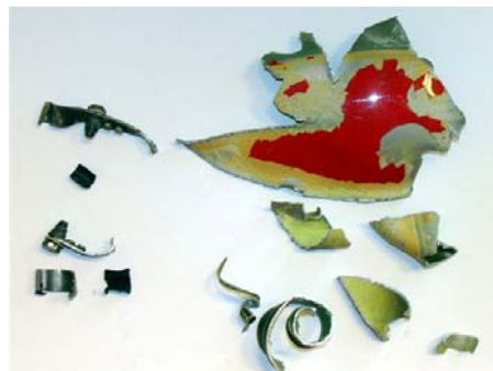
Fig. 5b More pieces of the cover and clips with bolts