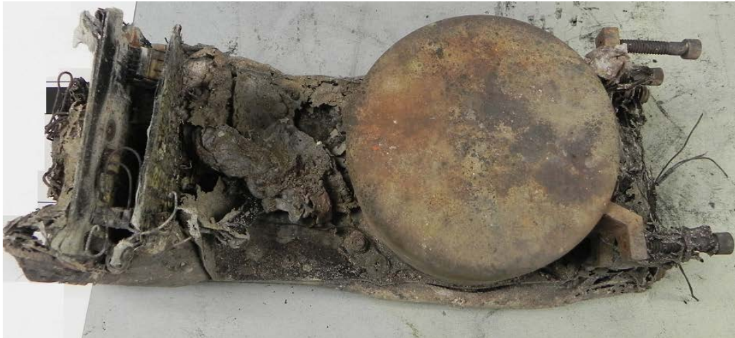
Figure 2. CSMU removed from CVR assembly.