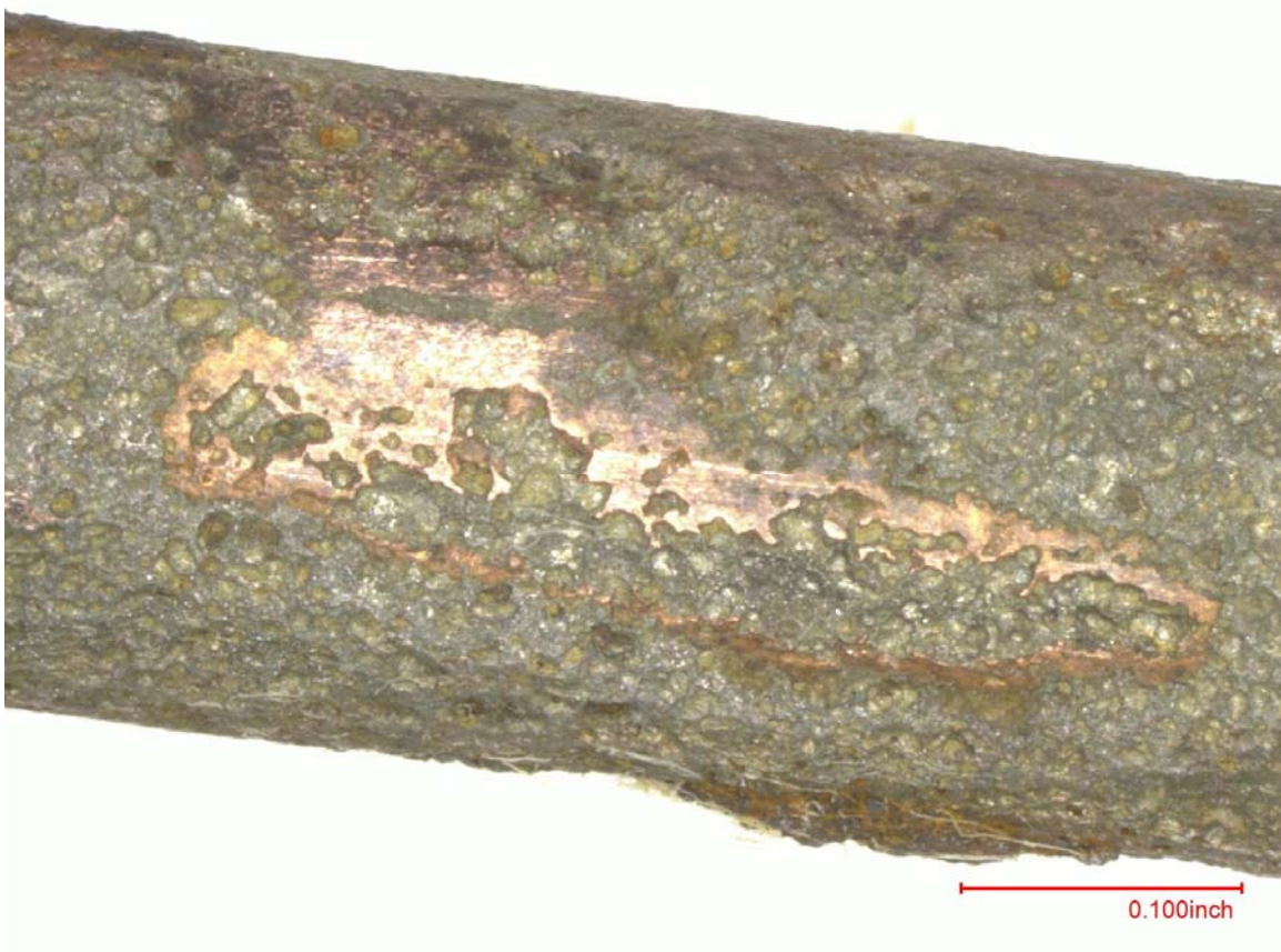
Figure 2. Area with corrosion on Line #1.