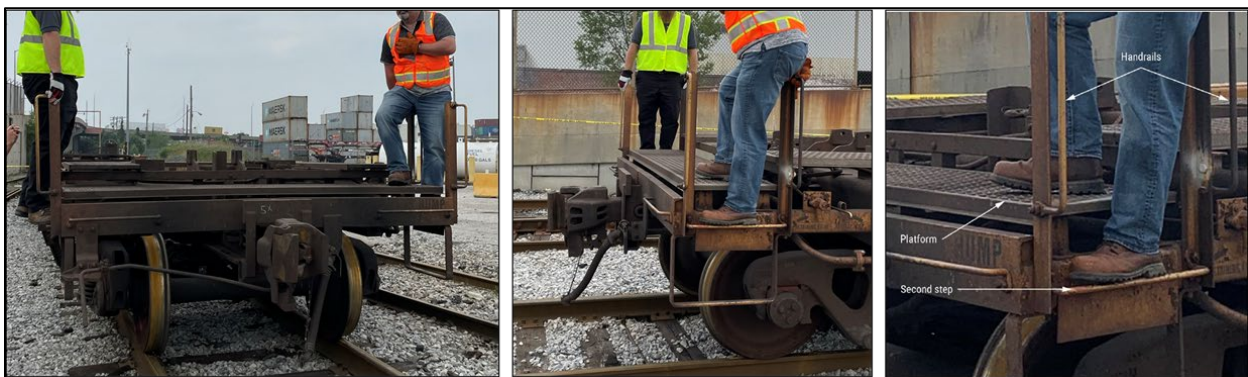
Figure 4. Investigator re-enactment on accident car.

The purpose of this reenactment was to observe the level of stability on the railcar that the conductor and trainee could have reasonably had in relationship to the location of the fixed safety appliances. The photographs in figure 4 document this reenactment: