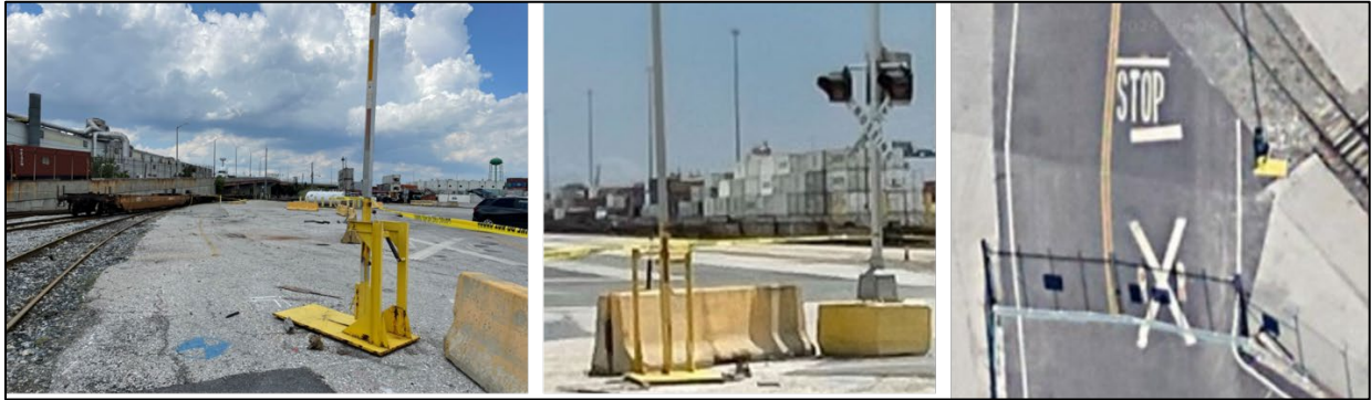
Figure 3. Seagirt vehicle crossing.

On the western most portion of the Penn Mary end, tracks 3, tracks 5 and track 8 have a privately marked crossing for vehicles and equipment to cross (Figure 3). This private crossing was installed by the Ports of America and is equipped with manual gates, standard flashing light signals 15 and railroad crossing signage (Highway-Rail Grade Crossing 16 ). This crossing is not equipped with any type of train detection circuit and is activated manually by Ports of America employees who activate this crossing when they view train movements approaching the crossing through security camera's mounted on poles overlooking this crossing.