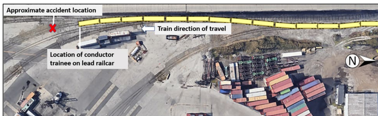
Figure 1. Accident overview illustration.

After the trainee fell into the gauge, the equipment continued to move for another 34 feet as the slack ran out of the train and before the conductor could initiate a train line emergency. During this time, the trainee became pinned at the mid-section of his torso between the eastern leading wheel of the car and the rail, sustaining fatal injuries (figure1).