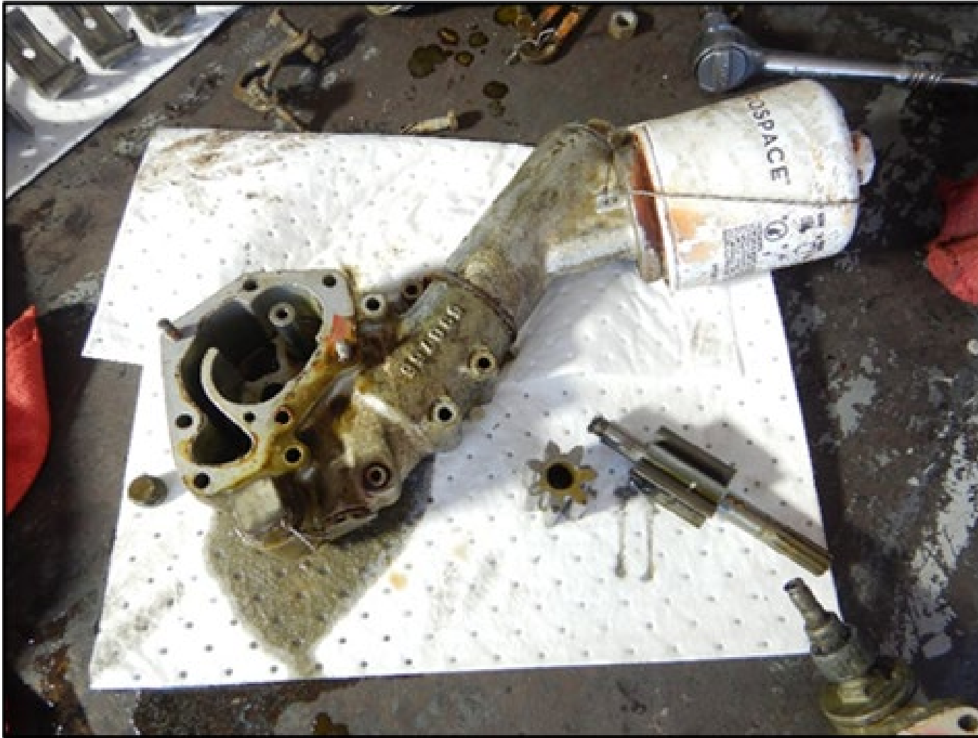
Photo 3 - Oil filter adapter housing and filter.