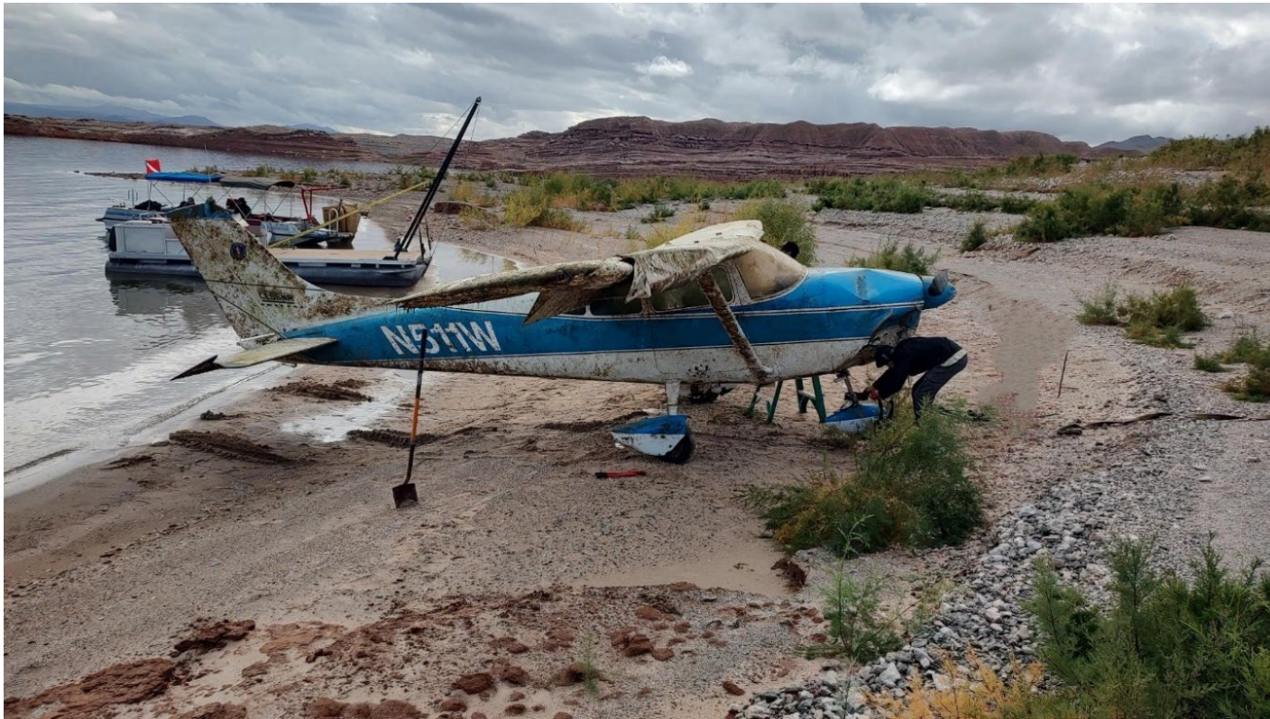
Photo 2 - Recovery of airplane out of Lake Mead.