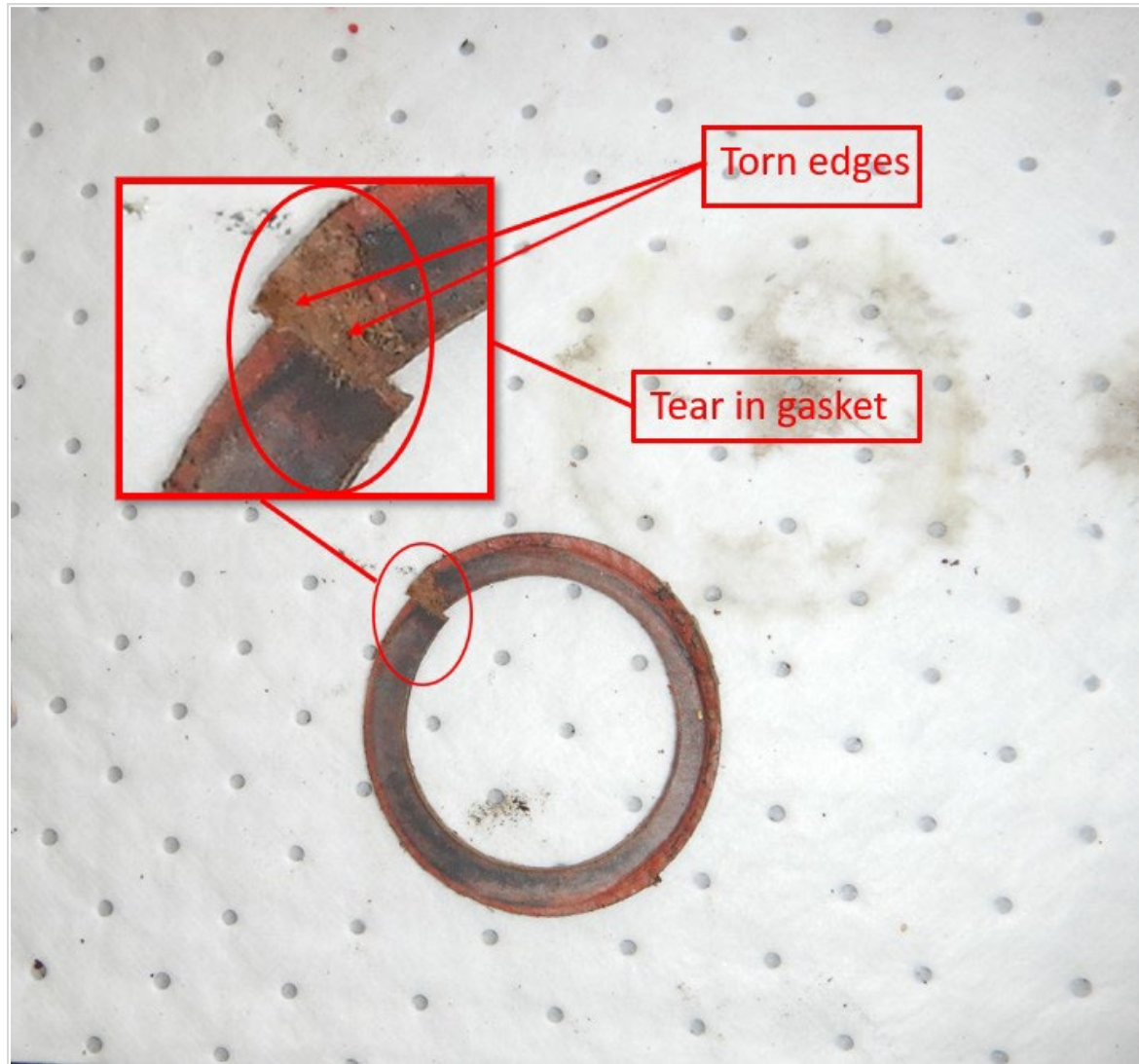
Photo 4 - Oil filter adapter housing gasket.