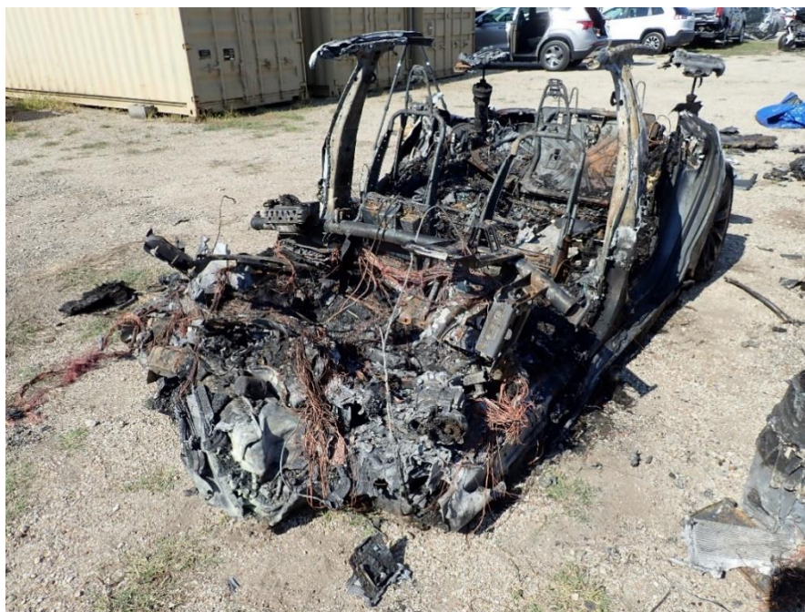
Figure 4. Interior of fire-damaged car, looking front to rear.

The frontal impact with the tree resulted in a power loss of the car's 12-volt system, which runs the non-traction power systems. During normal operation, the front door latches operate electronically with the pull of the interior lever. In the event of a 12-volt system power loss, the interior front doors open as usual using the interior door handles. The rear doors also have both electronic and mechanical latches; however, mechanically opening the rear door during a power loss requires additional steps. According to the owner's manual, during a loss of 12-volt system power, a rear-seated occupant must locate a small cutout in the carpet beneath the seat cushions and pull the mechanical release cable tab toward the center of the vehicle to manually open the rear door. 5 Inspection of the door latches and locking hardware was limited by postcrash fire damage.