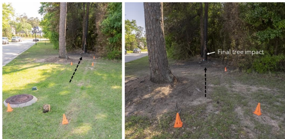
Figure 1. Car’s path after departing right-side roadway toward final tree impact, marked by cones (left). A closer view of the impact site is shown on the right, with the tree that was sideswiped by the car on the left side of the image.

On April 17, 2021, about 9:07 p.m. central daylight time, a 2019 Tesla Model S P100D electric car was traveling west on Hammock Dunes Place—a residential road in Spring, Harris County, Texas—when it crashed and caught fire. 1 The crash trip originated at the driver’s residence near the end of a cul-de-sac. The car traveled about 550 feet before departing the road at a leftward curve, driving over the right-side curb, hitting a storm sewer inlet and a raised manhole, sideswiping a tree, and running into a second tree (see figure 1). The crash damaged the front of the car’s high-voltage lithium-ion battery case, where a fire started. As a result of the crash and the postcrash fire, the driver and passenger were fatally injured.