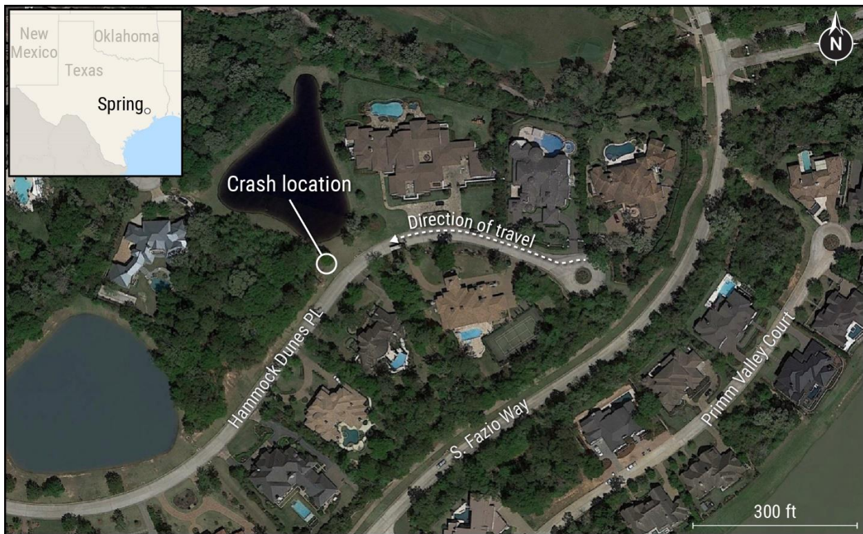
Figure 2. Area where crash occurred.