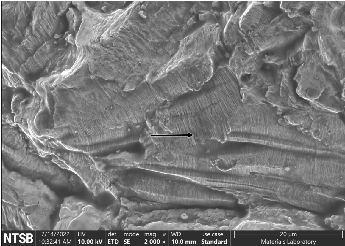
Figure 3. SEM image of typical fatigue striations observed within the fatigue region. An arrow indicates the direction of fatigue propagation in the image.