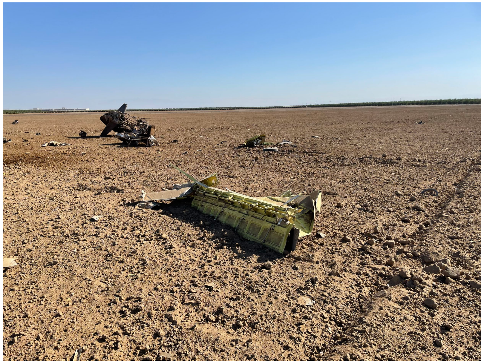
Photograph 2 - View of the accident site.