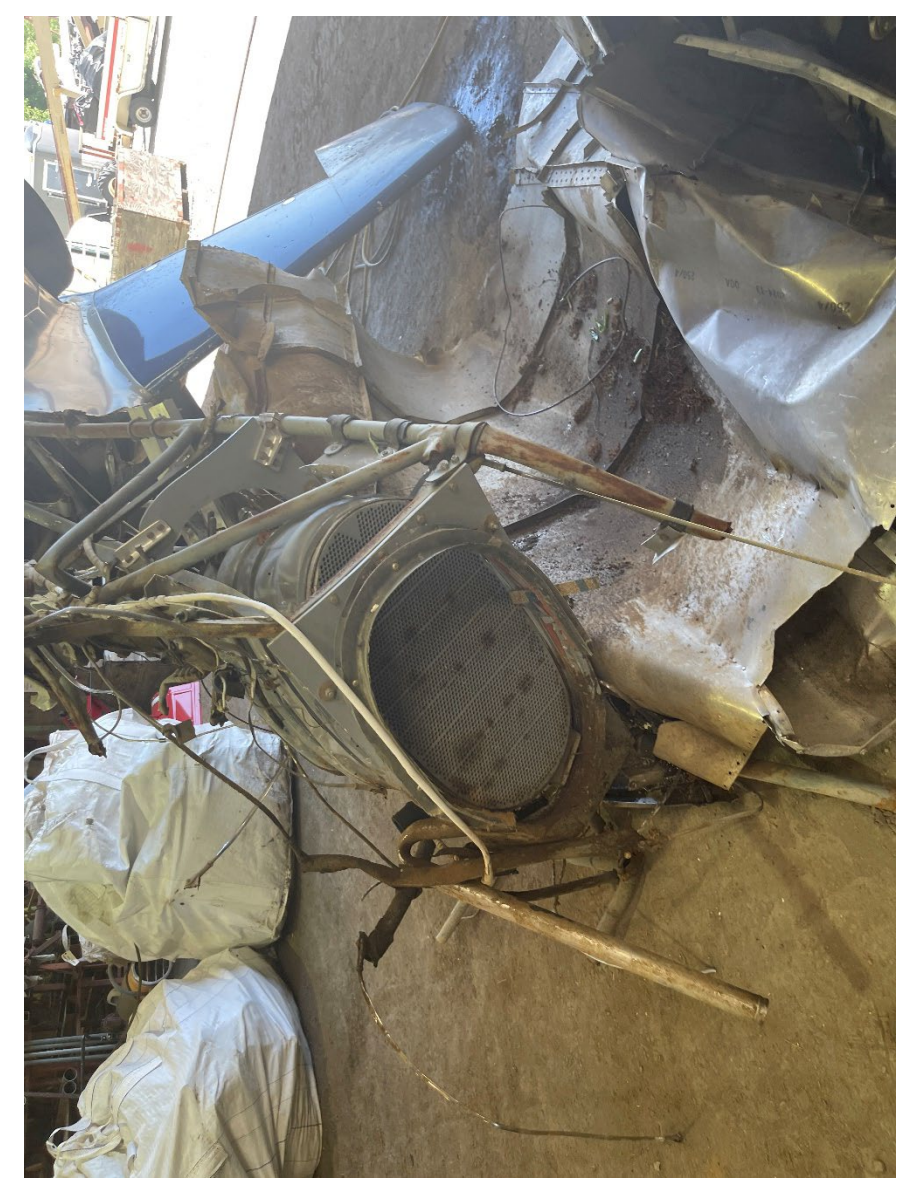
Photograph 3 - View of the aft fuselage structure and oil coolers.