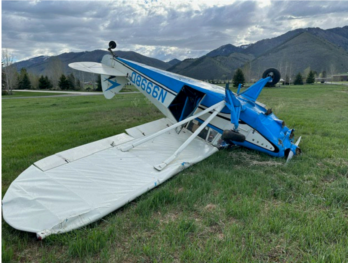
Photograph 2 - Image of left wing, fuselage, and empennage