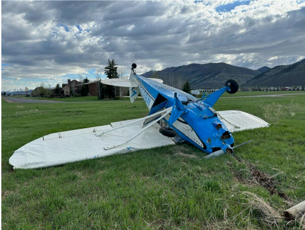
Photograph 1 - Image of wings, fuselage, and empennage