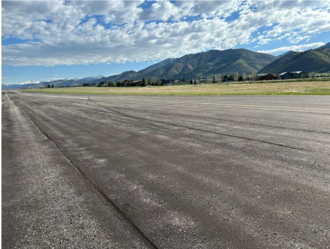
Photograph 3 - Image of tire signature on runway surface