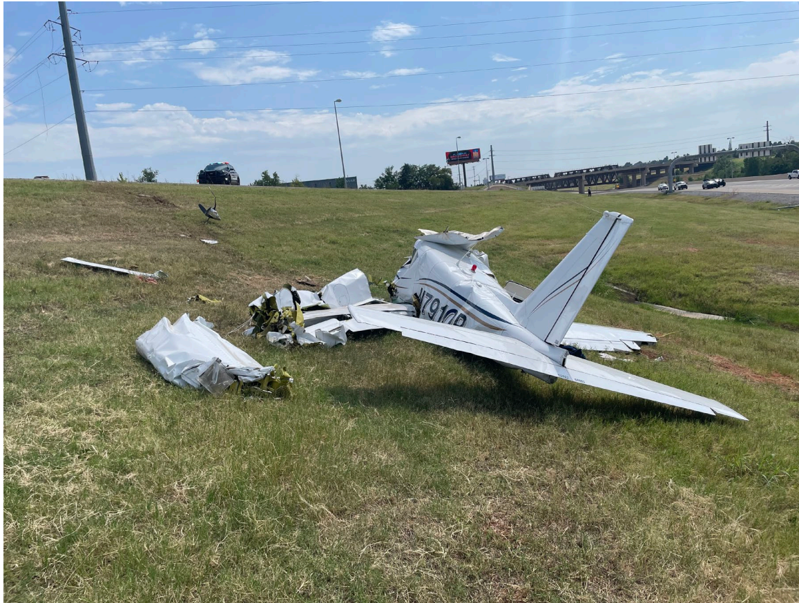
Photograph 3 - Accident airplane