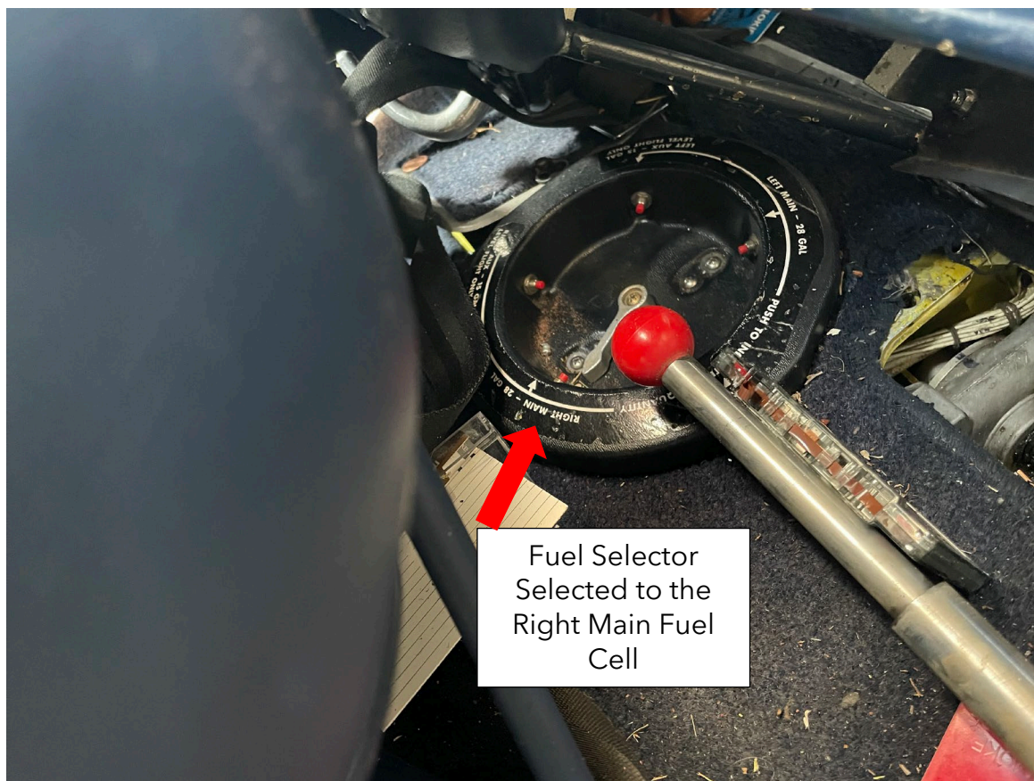
Photograph 6 - Airplane fuel selector valve