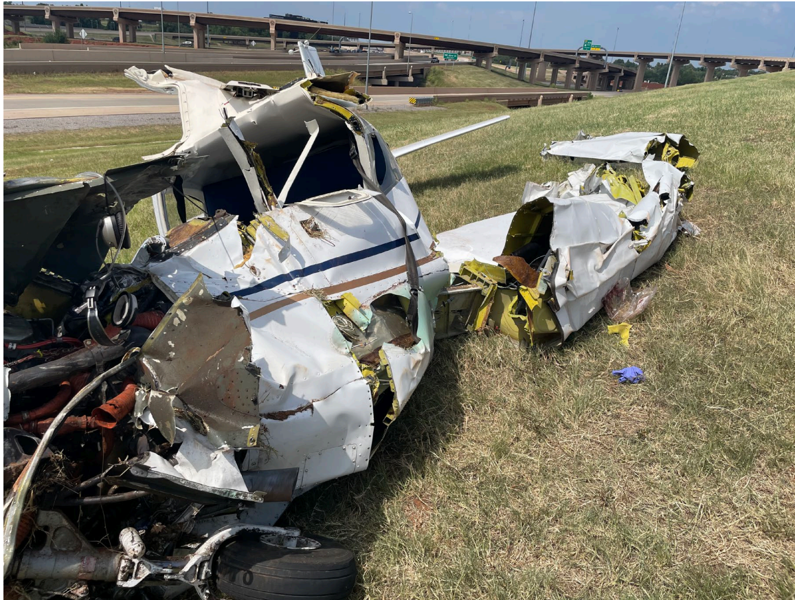
Photograph 4 - Accident airplane