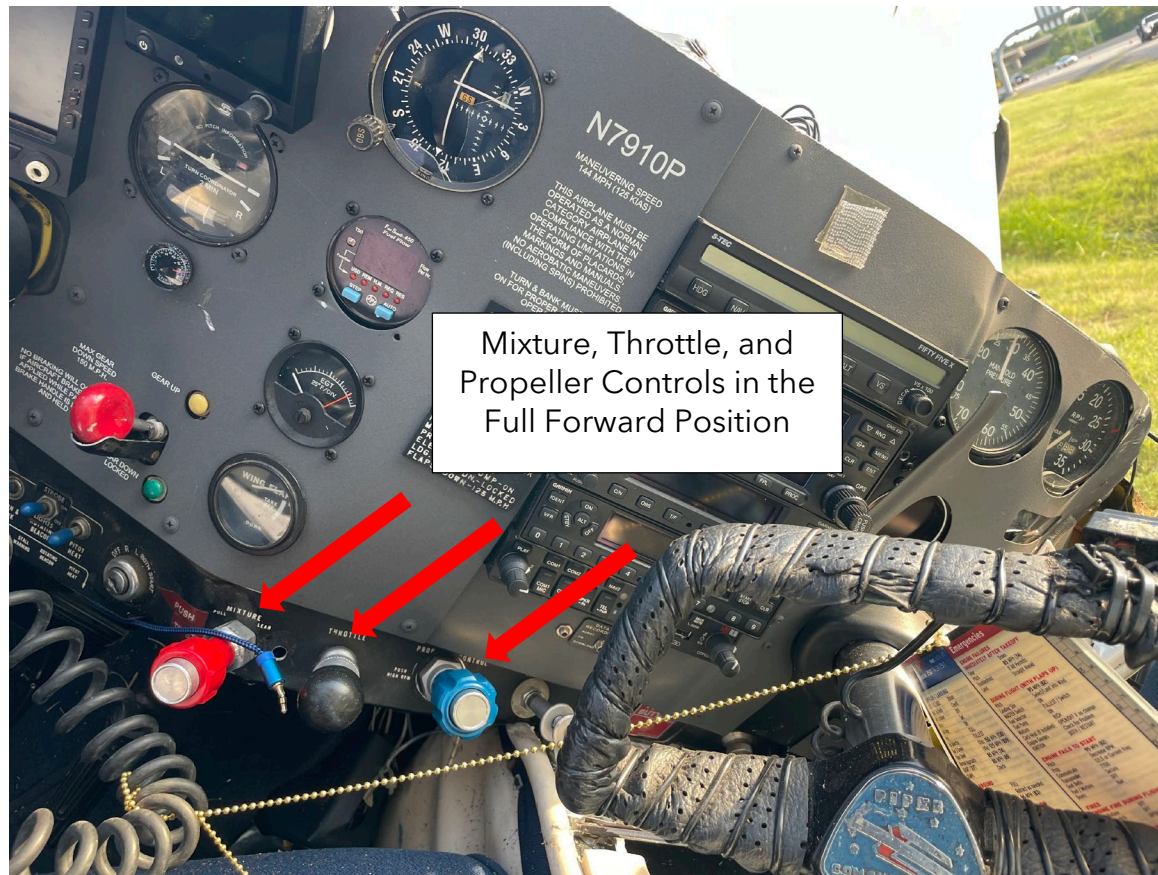
Photograph 5 - Airplane instrument panel