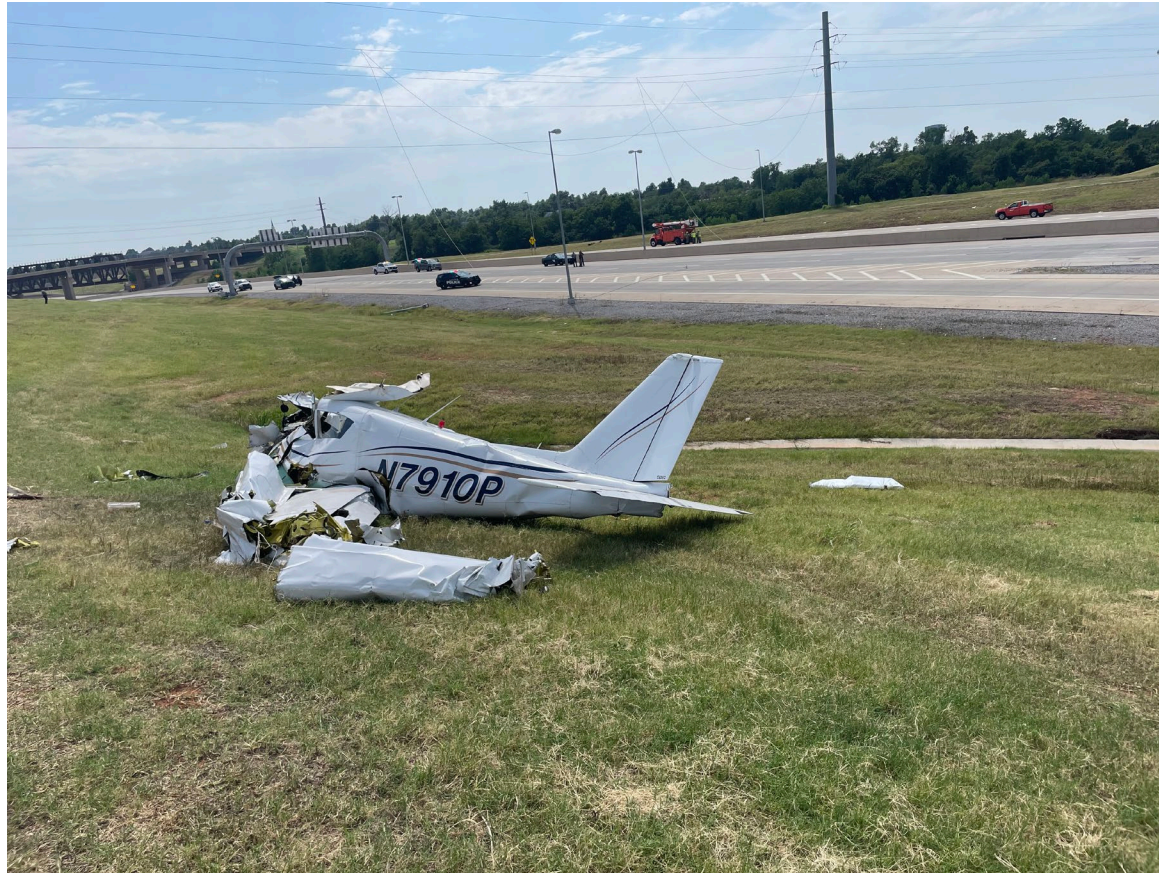
Photograph 2 - Accident airplane