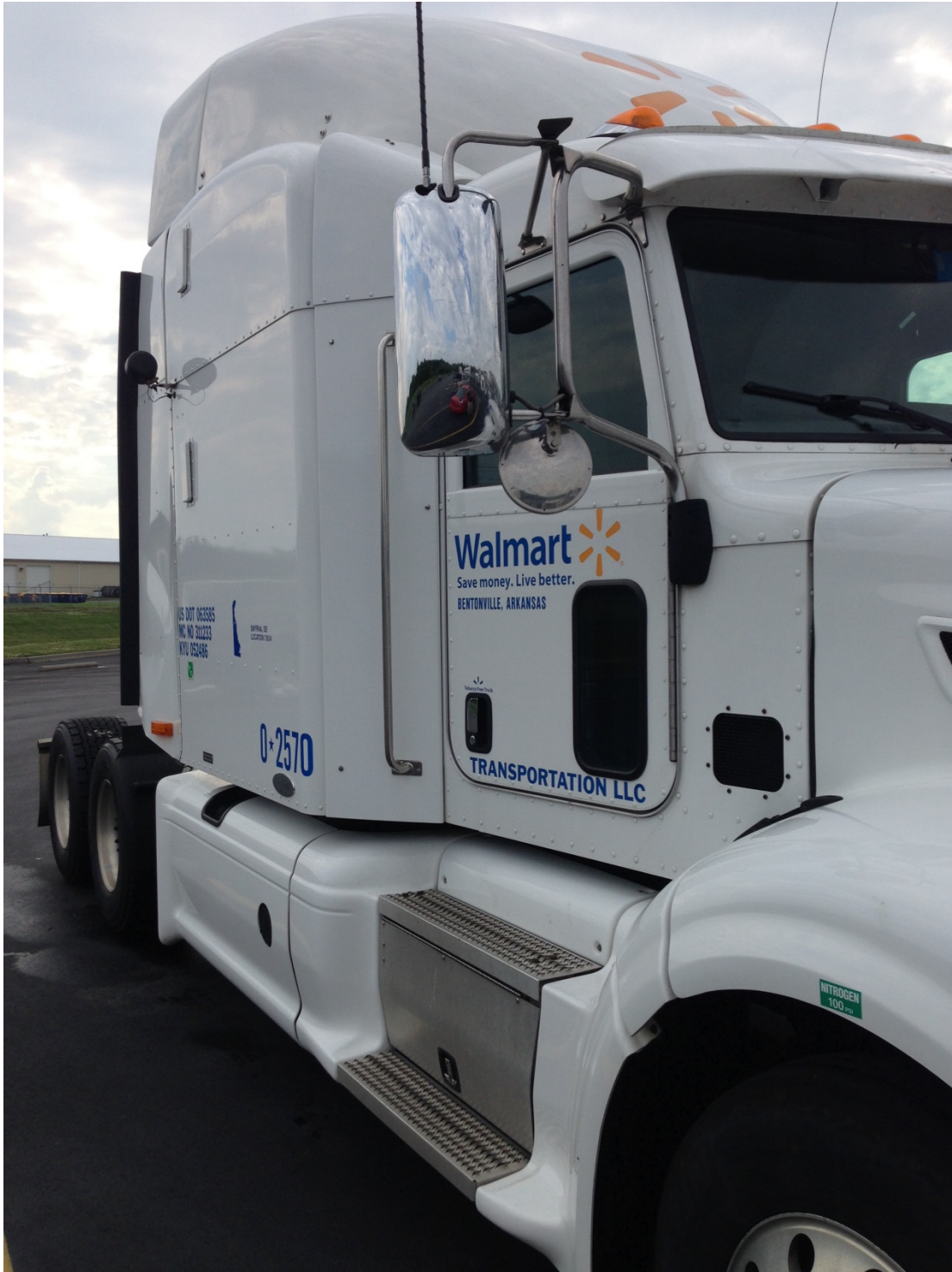
Photo 5: This photo depicts the exemplar Walmart truck-tractor observed by the NTSB. This unit was manufactured the same year and represents the identical configuration as the accident truck-tractor. This photo displays the passenger side view of the exemplar truck-tractor.