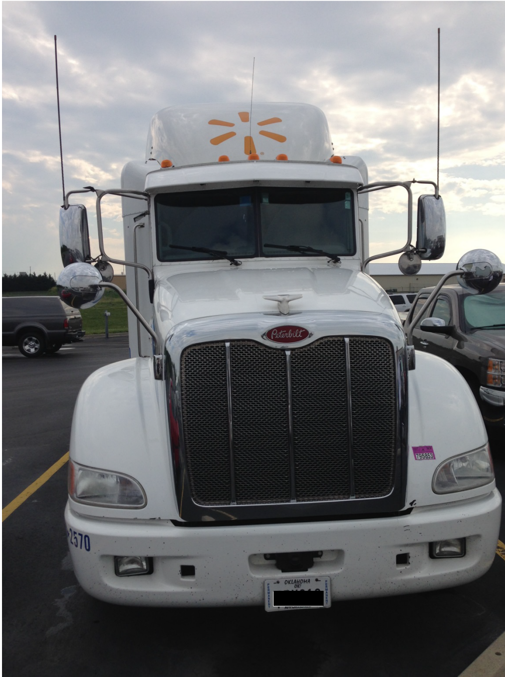
Photo 6: This photo represents frontal view of the exemplar accident truck-tractor, a 2011 Peterbilt.