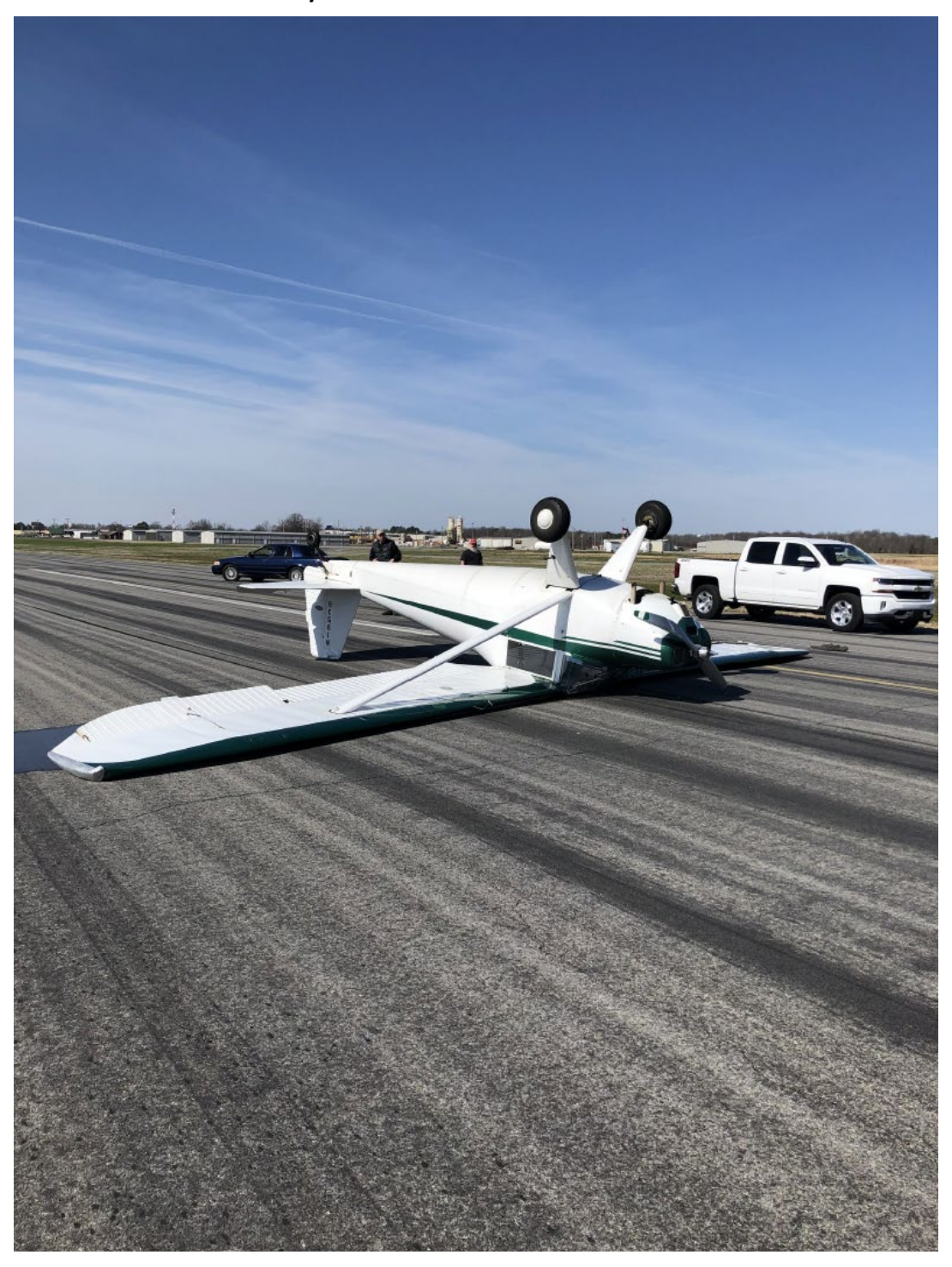
Figure 1: Airplane on Runway