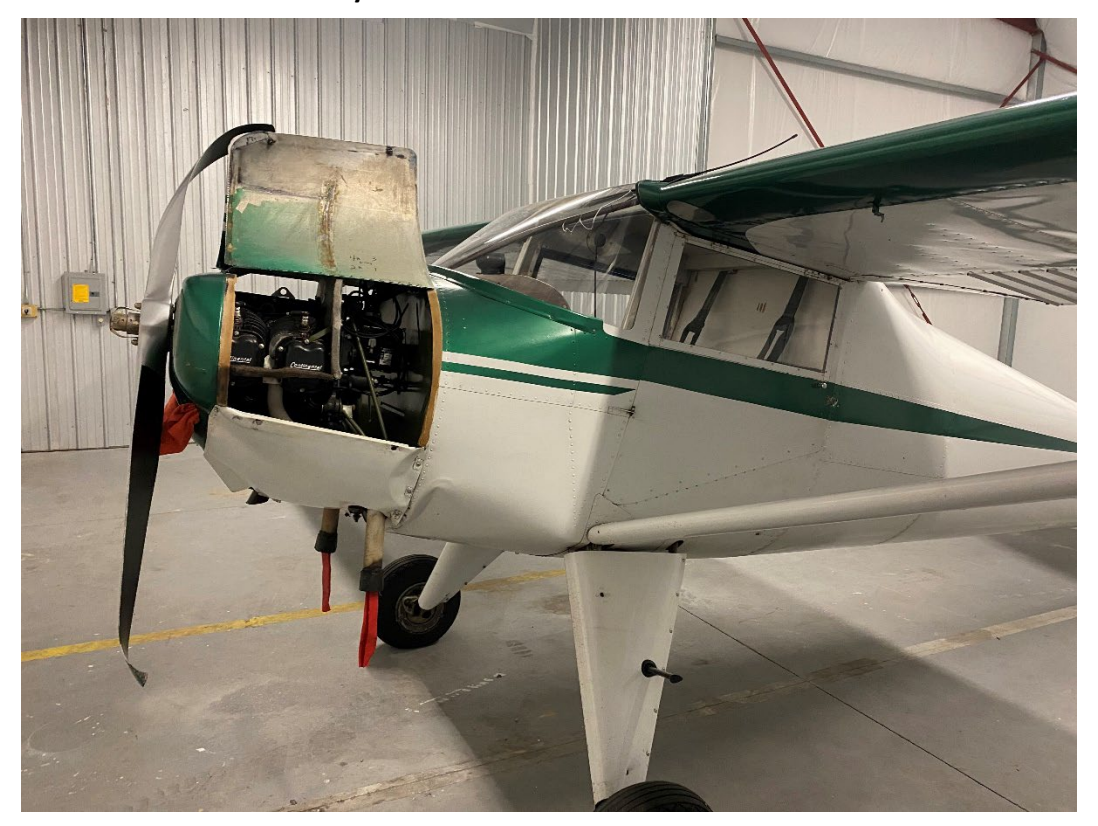
Figure 3: Damage to the Lower Cowling near the Firewall