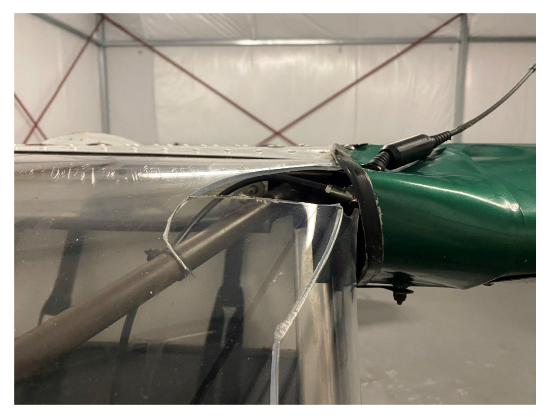
Figure 4: Damage to Wing Root