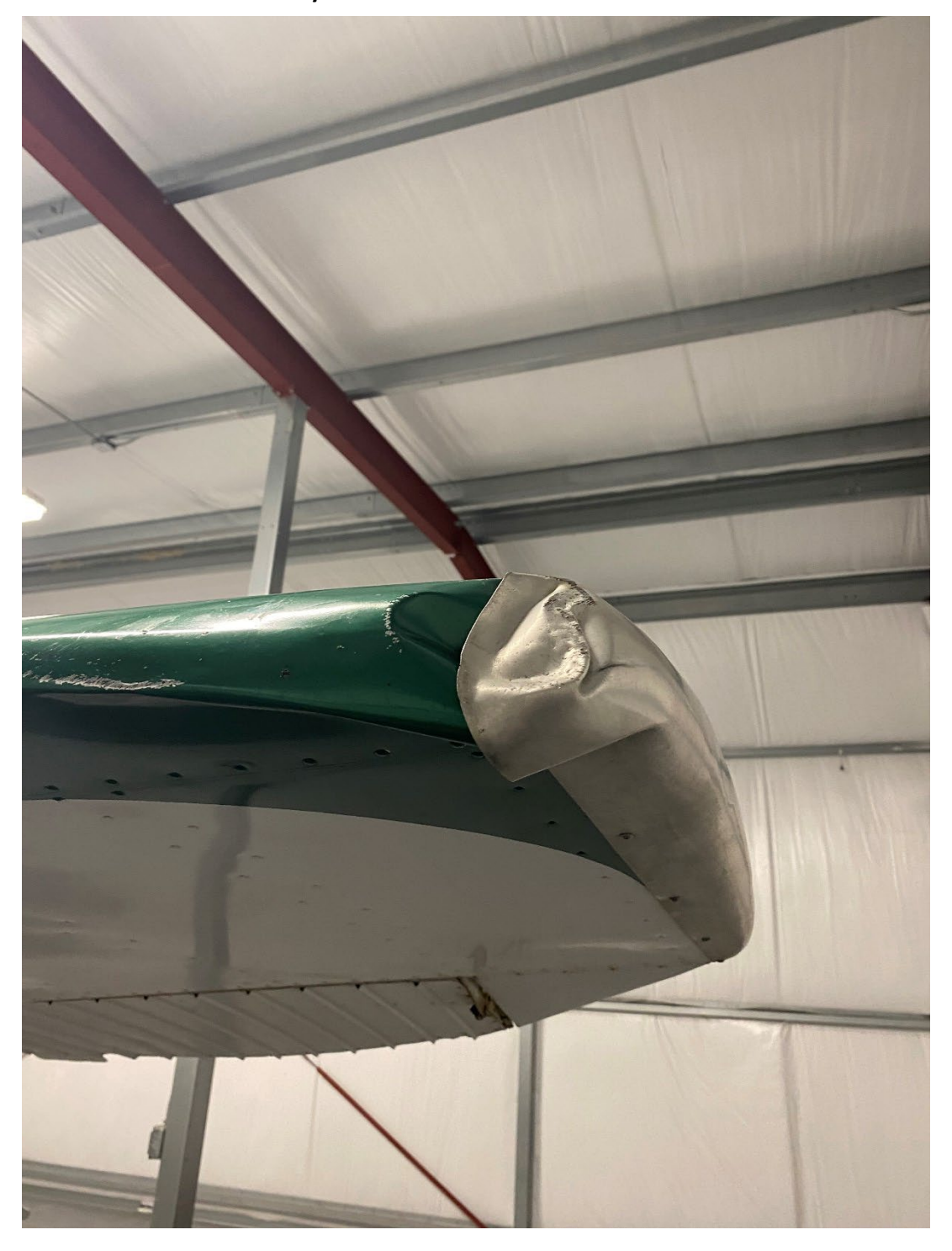
Figure 5: Damage to Left Wingtip