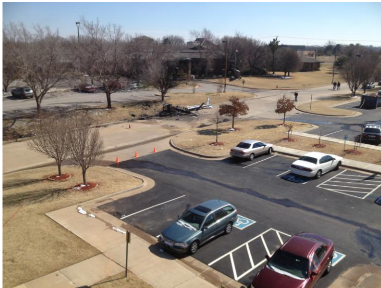
View of accident site from Mrs. Sardis' apartment window taken several hours after the accident

Mrs. Sardis' apartment is on the third floor of the retirement community adjacent to the crash site. The window from which she observed the helicopter wreckage faces in an approximate south-easterly direction. Please see view of helicopter wreckage from window below (taken at approximately noon on the date of the accident).