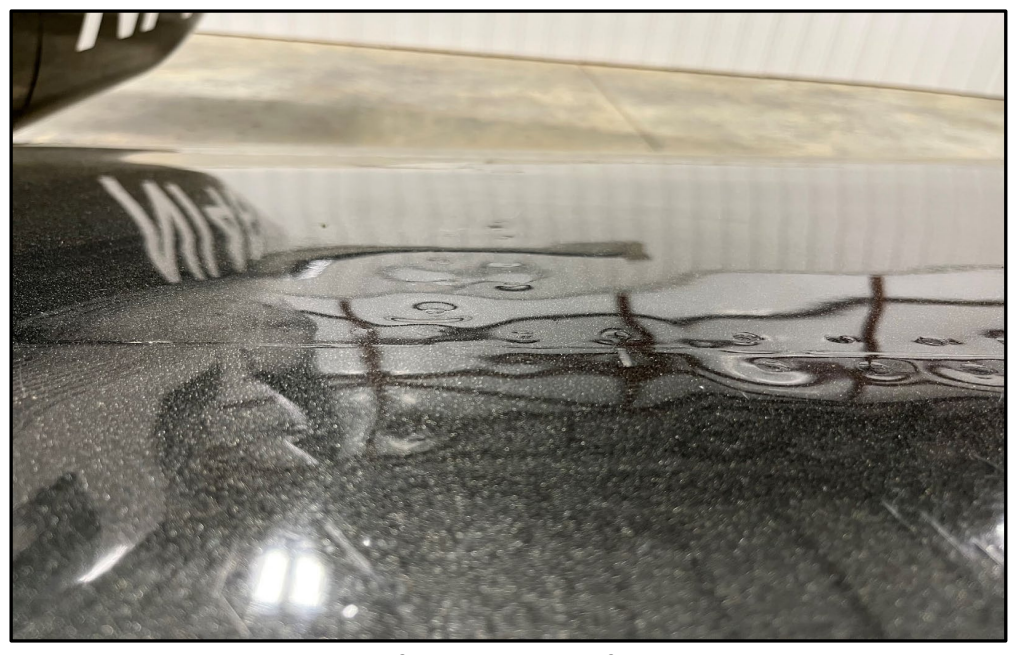
Figure 2: Left wing as viewed from the top.