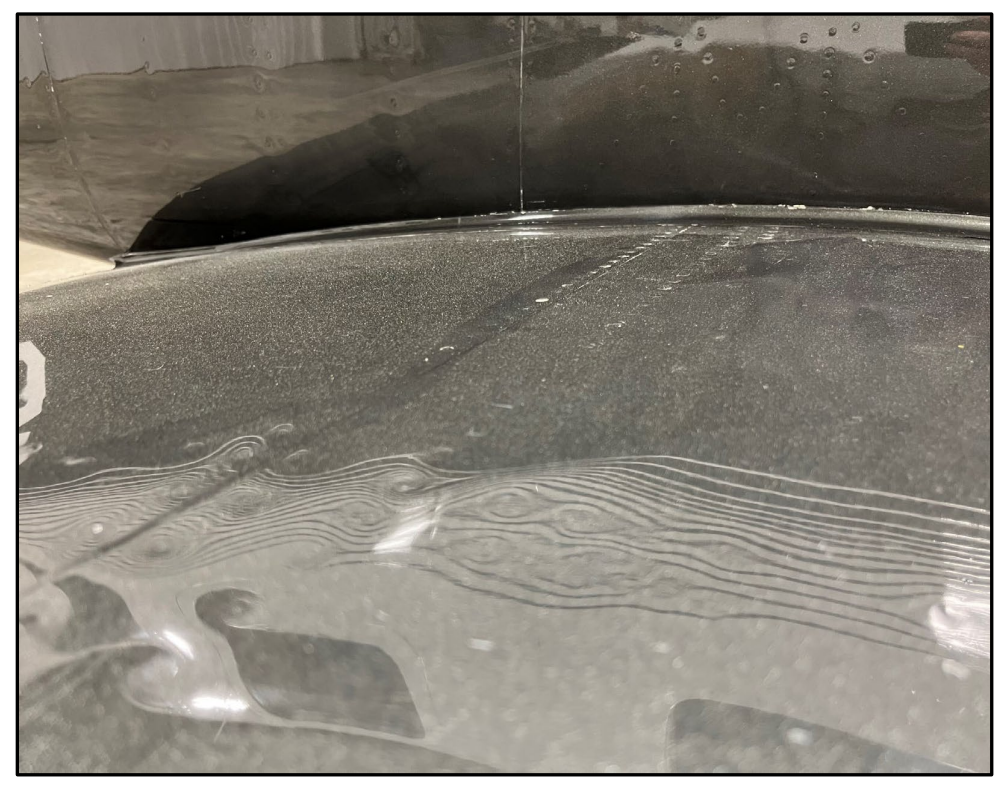
Figure 4: Right wing as viewed from the top.