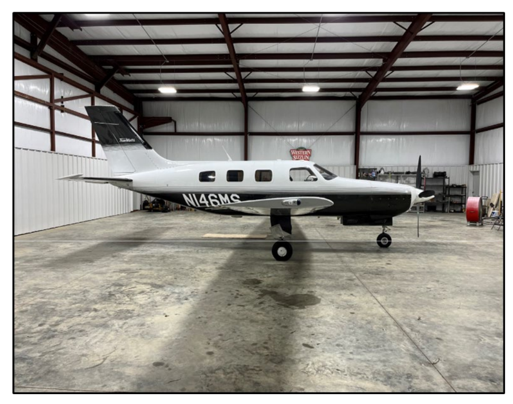
Figure 1: Airplane as viewed from the right side.