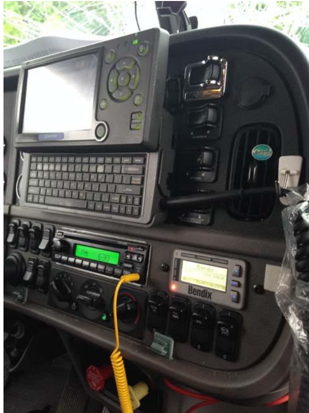
VEH Photo 7. 2011 Peterbilt truck-tractor driver controls to the right of the steering wheel.