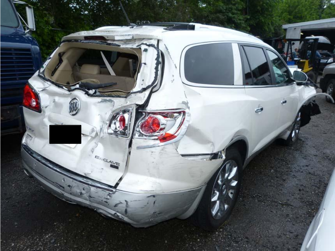
VEH Photo 16. 2011 Buick Enclave, showing rear damage.