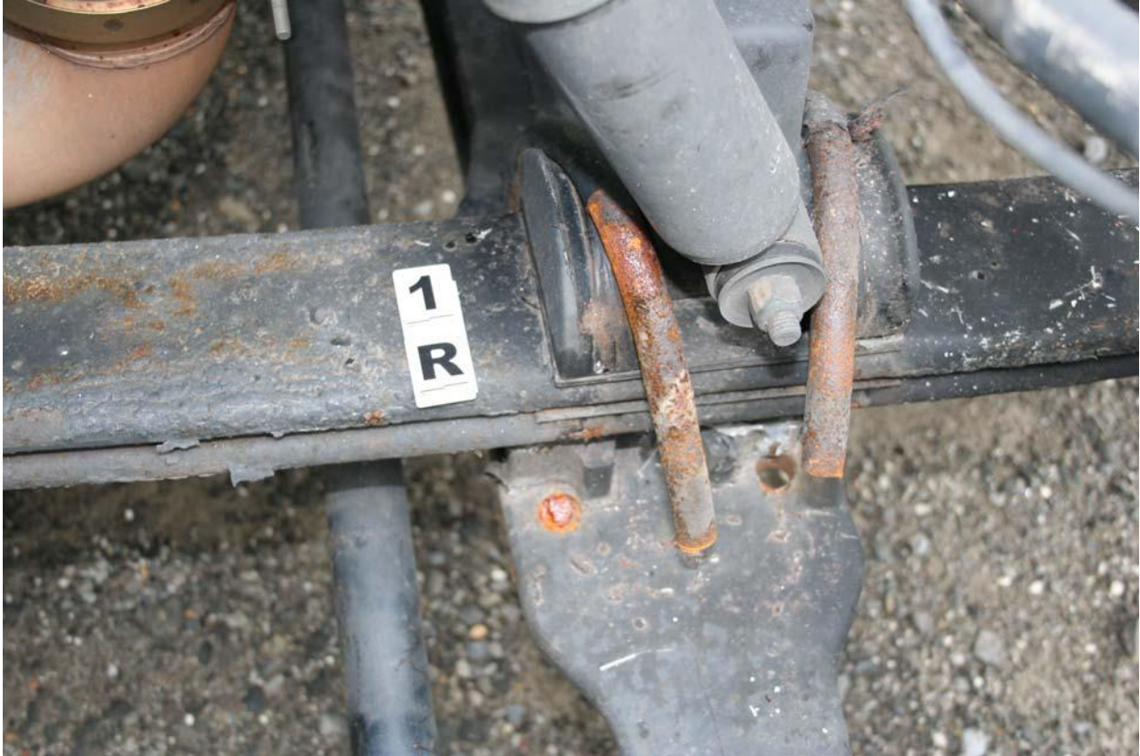
VEH Photo 2. View of the broken right front axle leaf spring U-bolts on the 2011 Peterbilt truck-tractor.