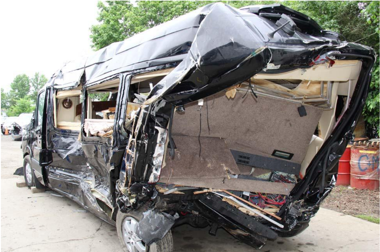
VEH Photo 13. 2012 Mercedes-Benz Sprinter van, view of left rear corner damage.