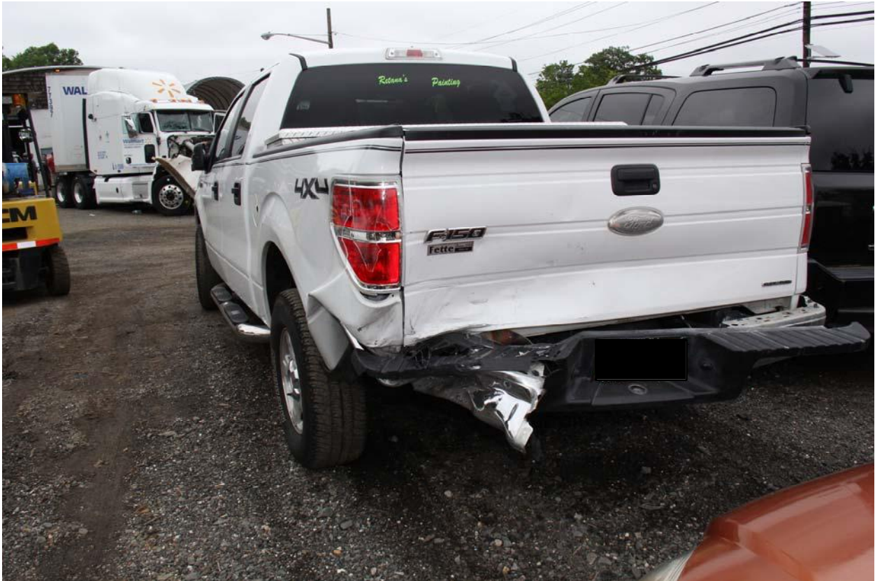
VEH Photo 17. 2011 Ford F-150, showing rear damage.