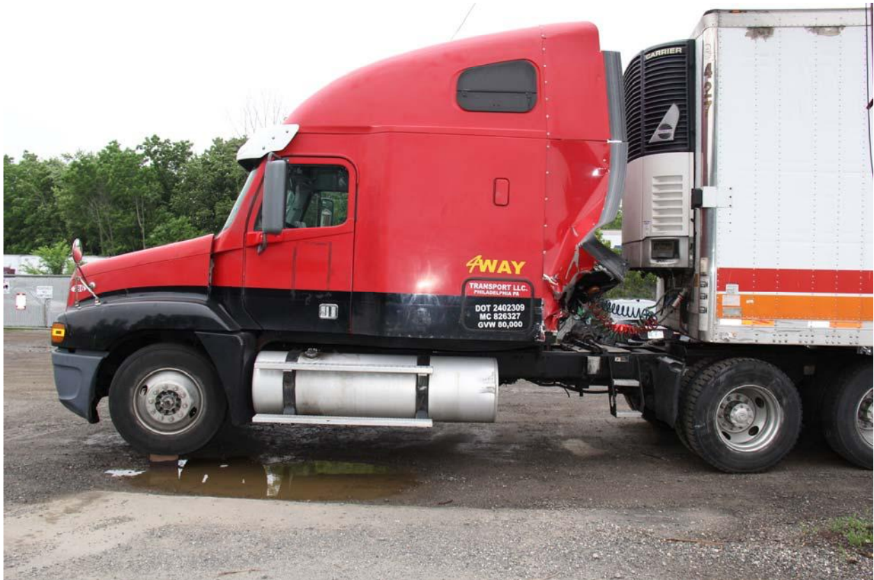
VEH Photo 19. 2006 Freightliner combination unit, showing damage to the left side of the truck-tractor.