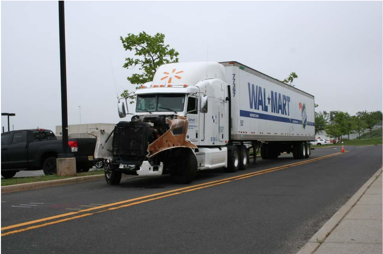
VEH Photo 1. Overall photograph of the 2011 Peterbilt combination unit, left front view.