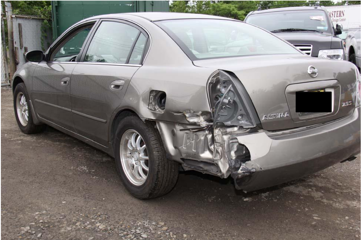
VEH Photo 18. 2005 Nissan Altima, showing left rear corner damage.