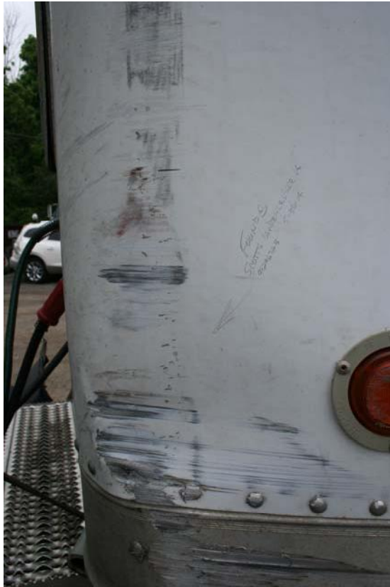
VEH Photo 5. Preexisting left front leading edge damage on the 2003 Great Dane semitrailer.