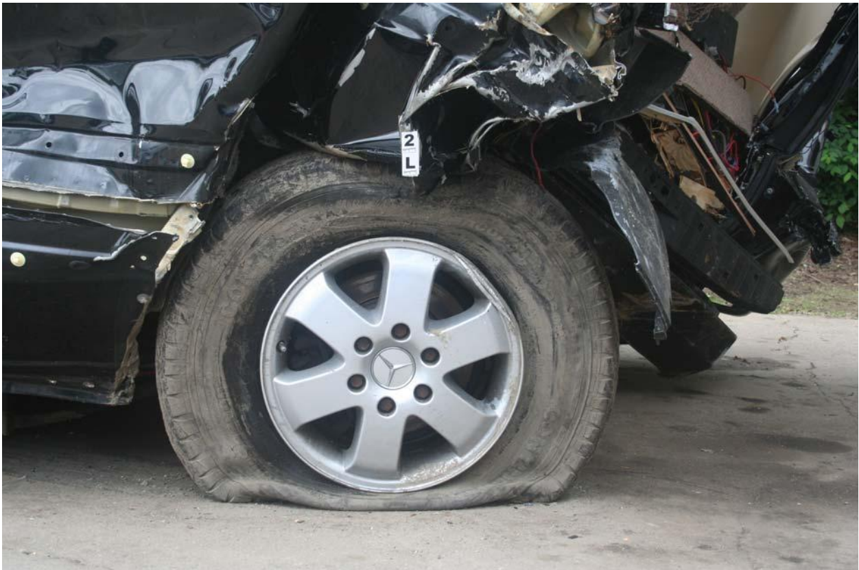
VEH Photo 14. Showing the deflated left rear tire and left rear wheel damage in contact with the crushed-in rear portion of the van.