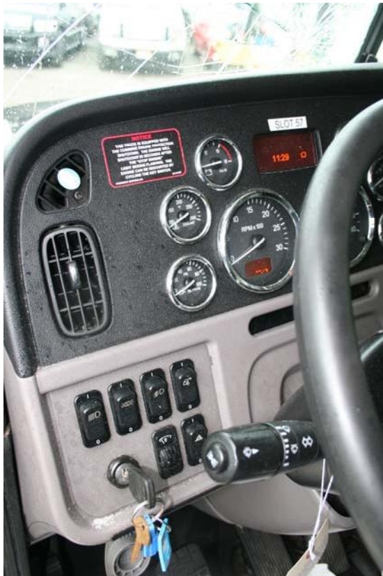
VEH Photo 6. 2011 Peterbilt truck-tractor driver controls to the left of the steering wheel.