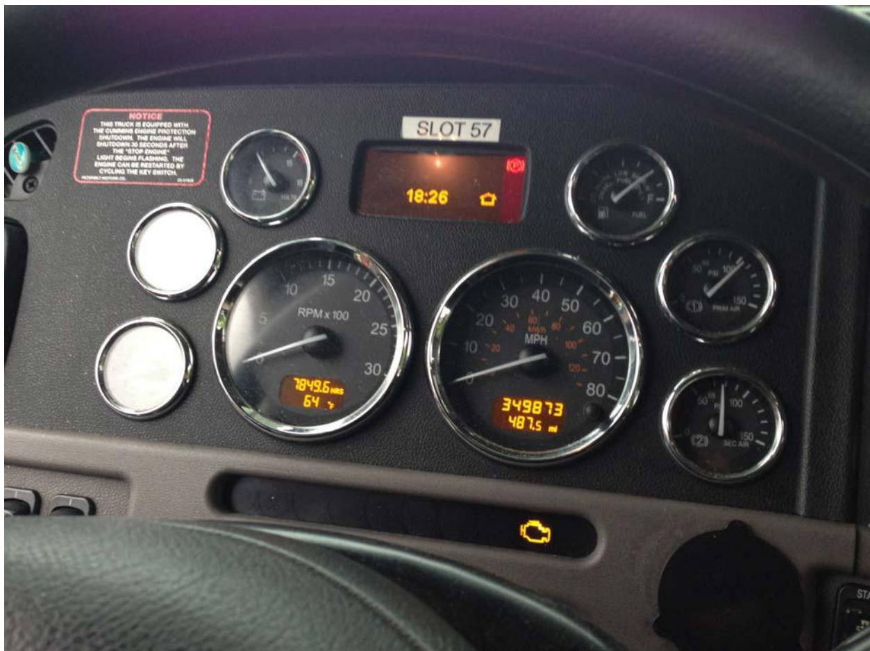
VEH Photo 8. 2011 Peterbilt truck-tractor center dash gauges at postcrash key-on position.