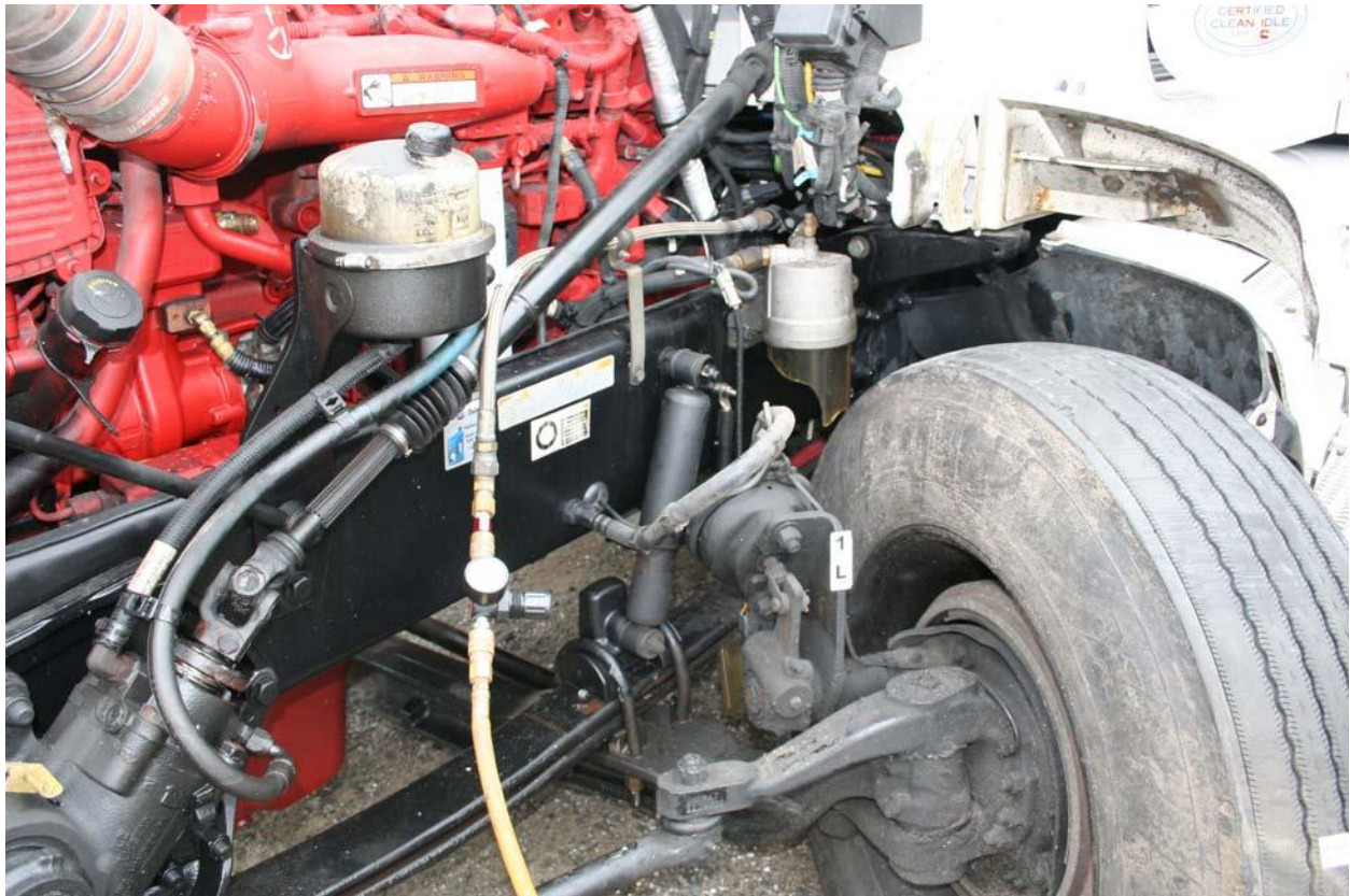
VEH Photo 3. View of the left side engine compartment of the 2011 Peterbilt truck-tractor; the distorted leaf springs and U-bolts can be seen below the frame rail toward the bottom of the photograph.