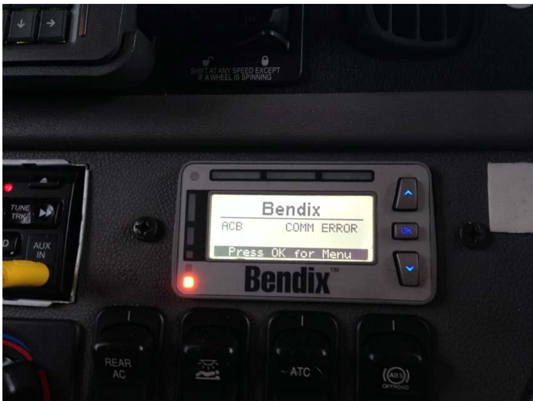
VEH Photo 12. Showing postcrash Bendix display unit and error message in the cab of the 2011 Peterbilt truck-tractor.