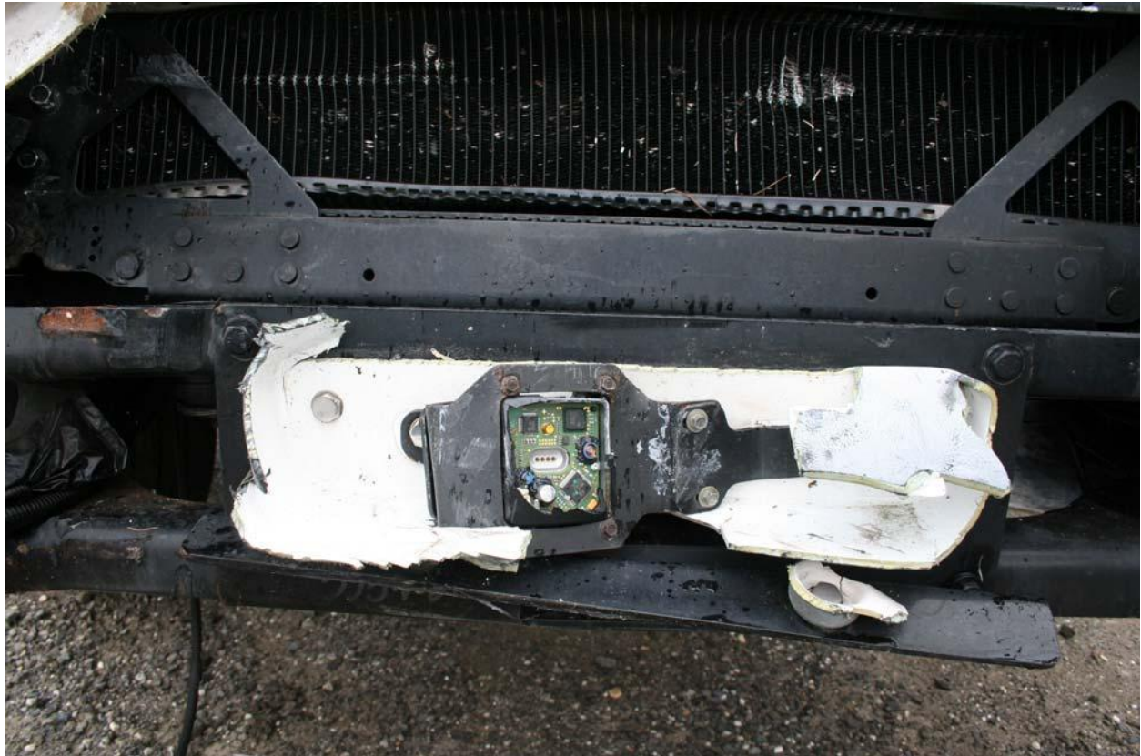
VEH Photo 11. Showing damaged Bendix radar module on the front bumper of the 2011 Peterbilt truck-tractor.