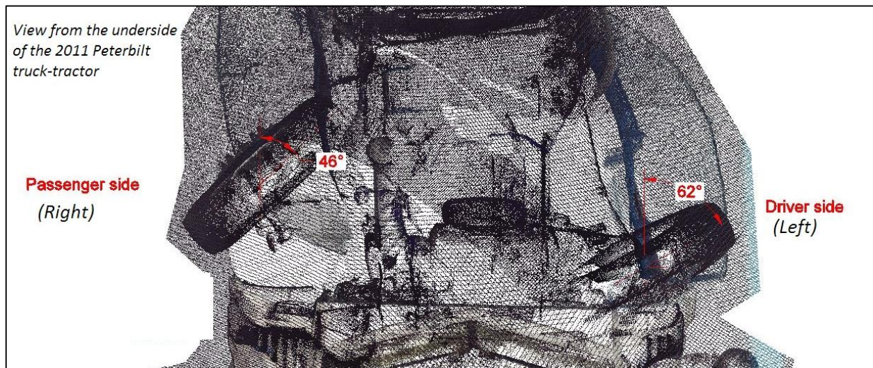
VEH Photo 4. View from the underside of the 2011 Peterbilt truck-tractor, showing the front axle wheel alignment angles noted during the postcrash inspection.