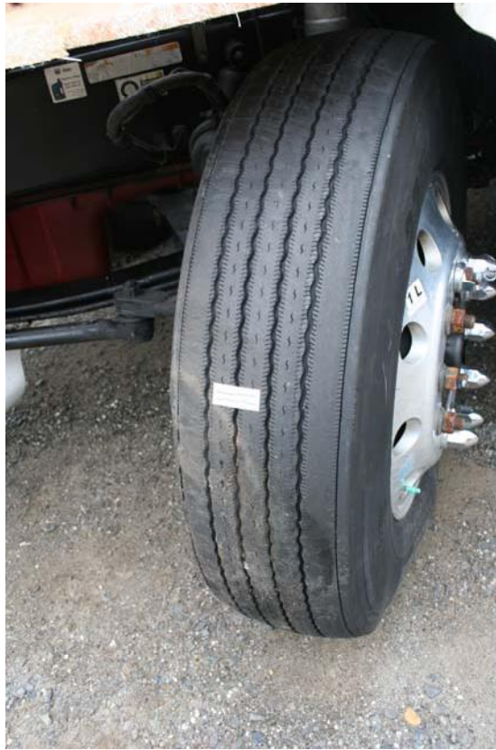
VEH Photo 9. Left front axle tire of the 2011 Peterbilt truck-tractor, showing the area of tire tread scuffing and a 2-inch reference marker.