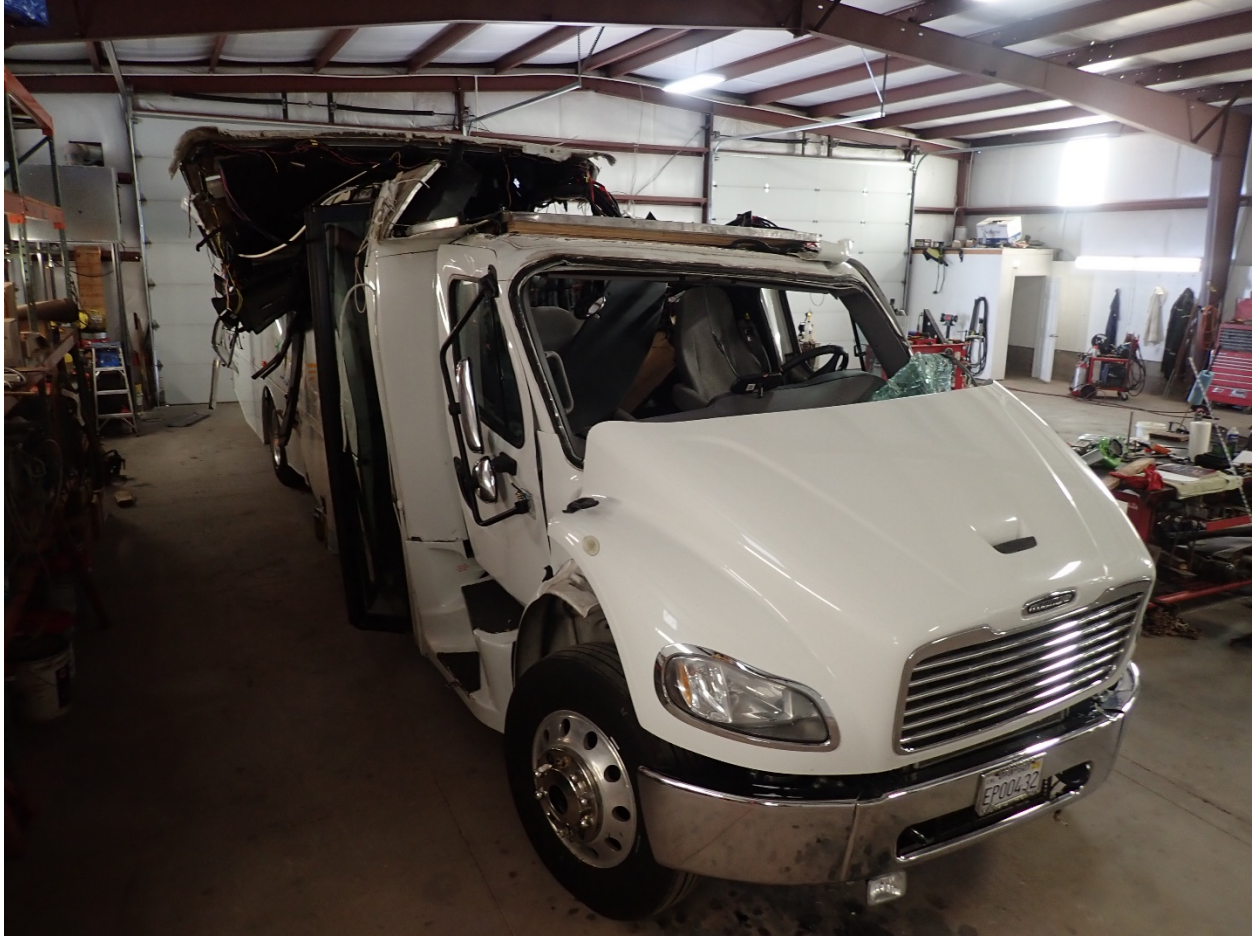
View of the damage to the right side of the Freightliner as photographed from the right front corner