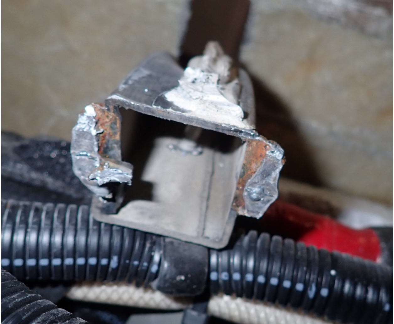
Roof bow showing weld with attached frame material