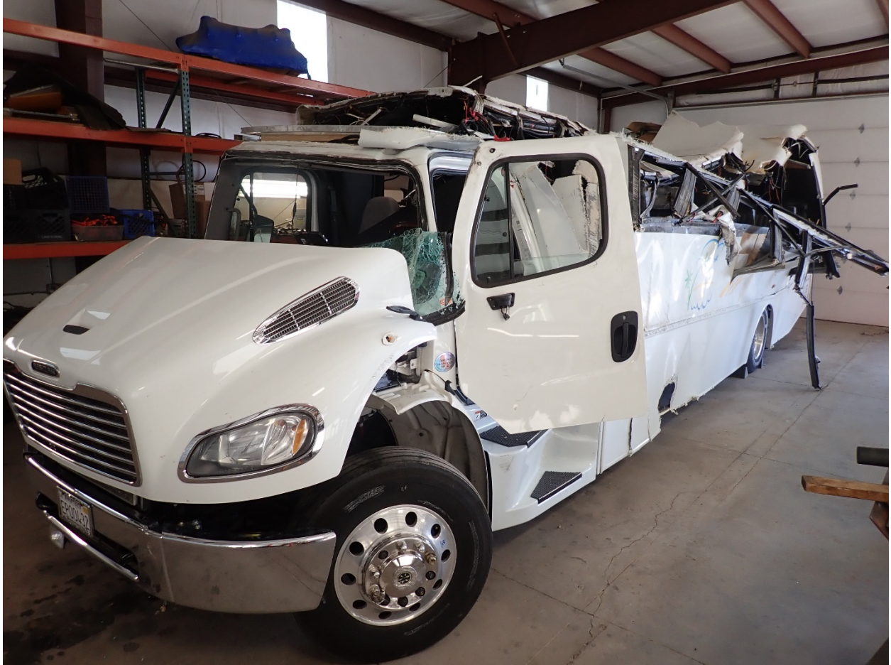
View of damage to Freightliner as photographed from the left front corner