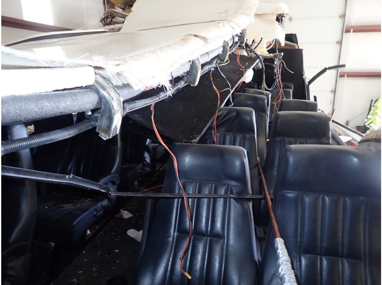
View of the damage to the roof structure as seen from front to rear