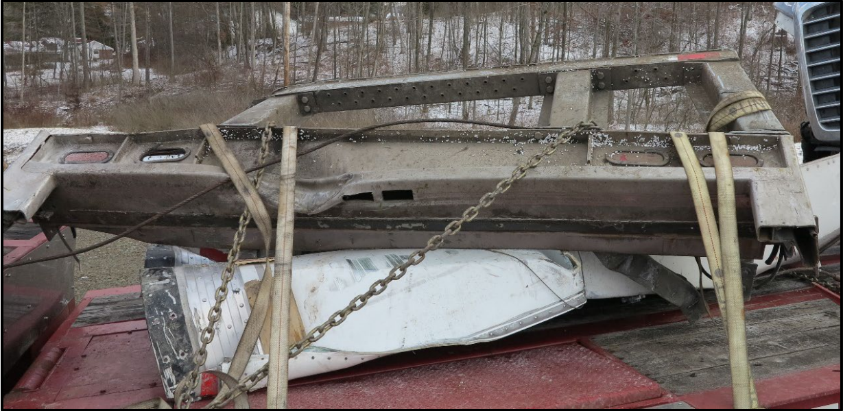
Photograph 12: Looking at the damage to the steel frame from above the cargo doors on the 2019 Hyundai semitrailer.