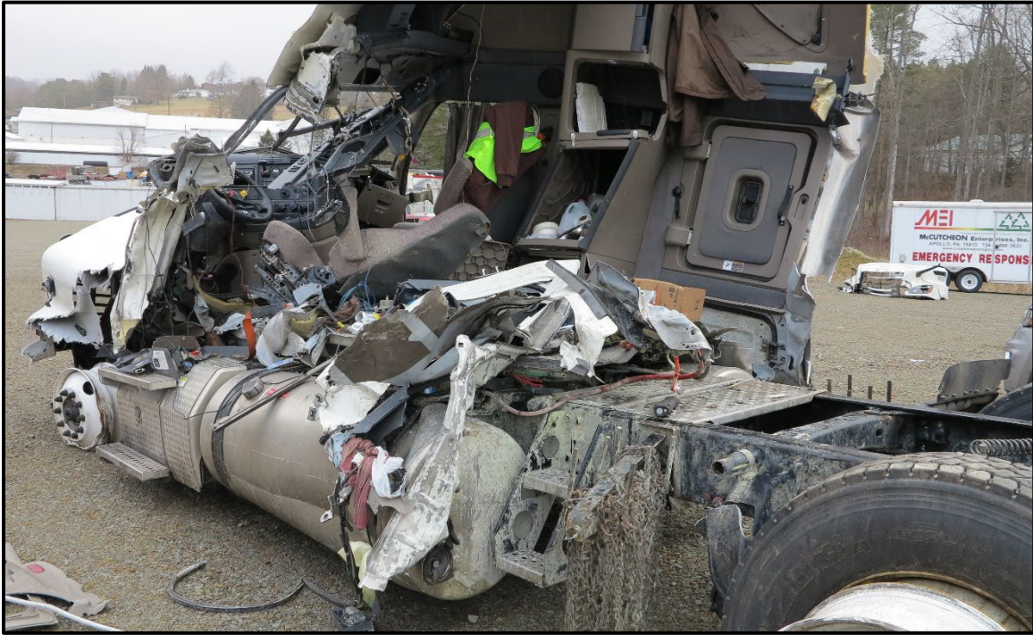
Photograph 16: This is a view of the displaced steering wheel and damaged instrument panel from the UPS #1 2018 Freightliner.