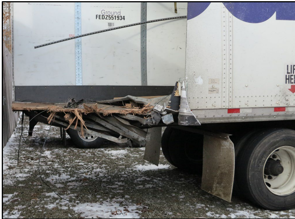
Photograph 14: A view looking from the front bumper toward the rear drive axle along the left side of the UPS #1 2018 Freightliner.