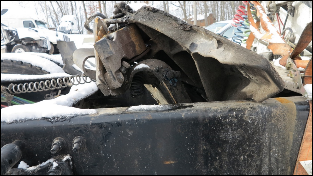
Photograph 10: Looking at the trapped brake and accelerator pedals of the 2018 FedEx truck-tractor.