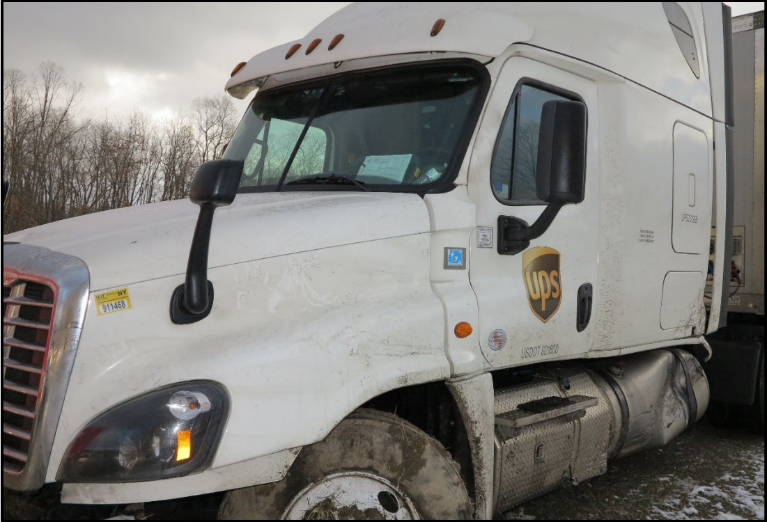
Photograph 22: A closer look at the damage to the left-side fuel tank mounted on the UPS #2 2018 Freightliner.