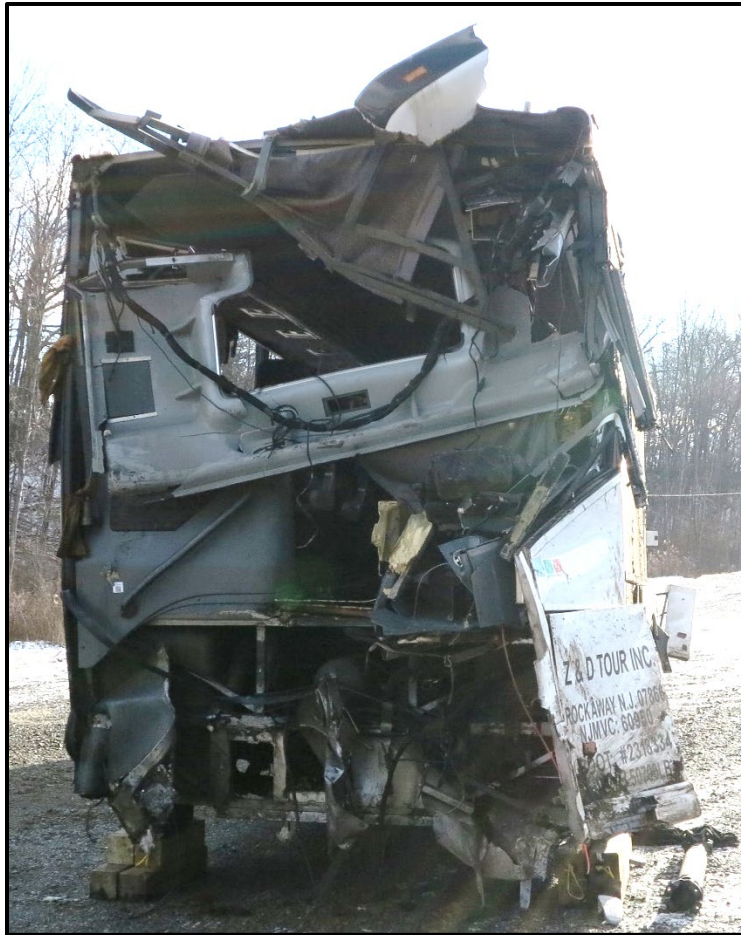
Photograph 2: A closer view of the front of the 2005 Van Hool motorcoach – notice the driver's seat.