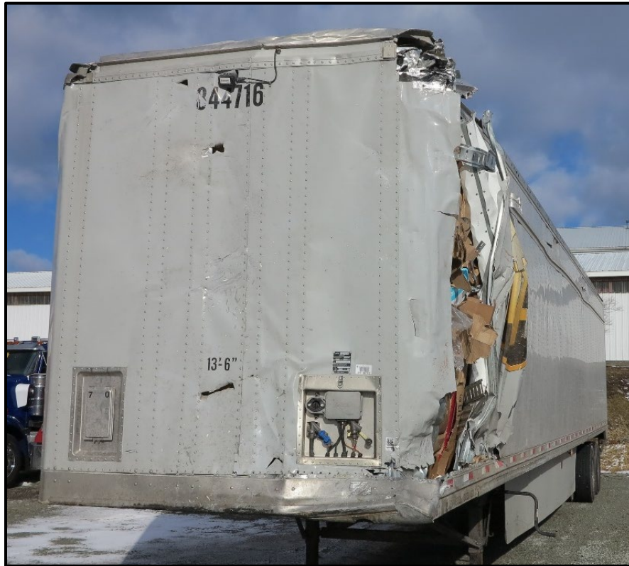
Photograph 18: Looking at the damage sustained to the forward section on the left side of the 2018 Stoughton semitrailer