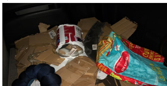
Paint and cardboard in a vehicle on deck 5 of cargo ship, taken in June 2020, provided by the Coast Guard.