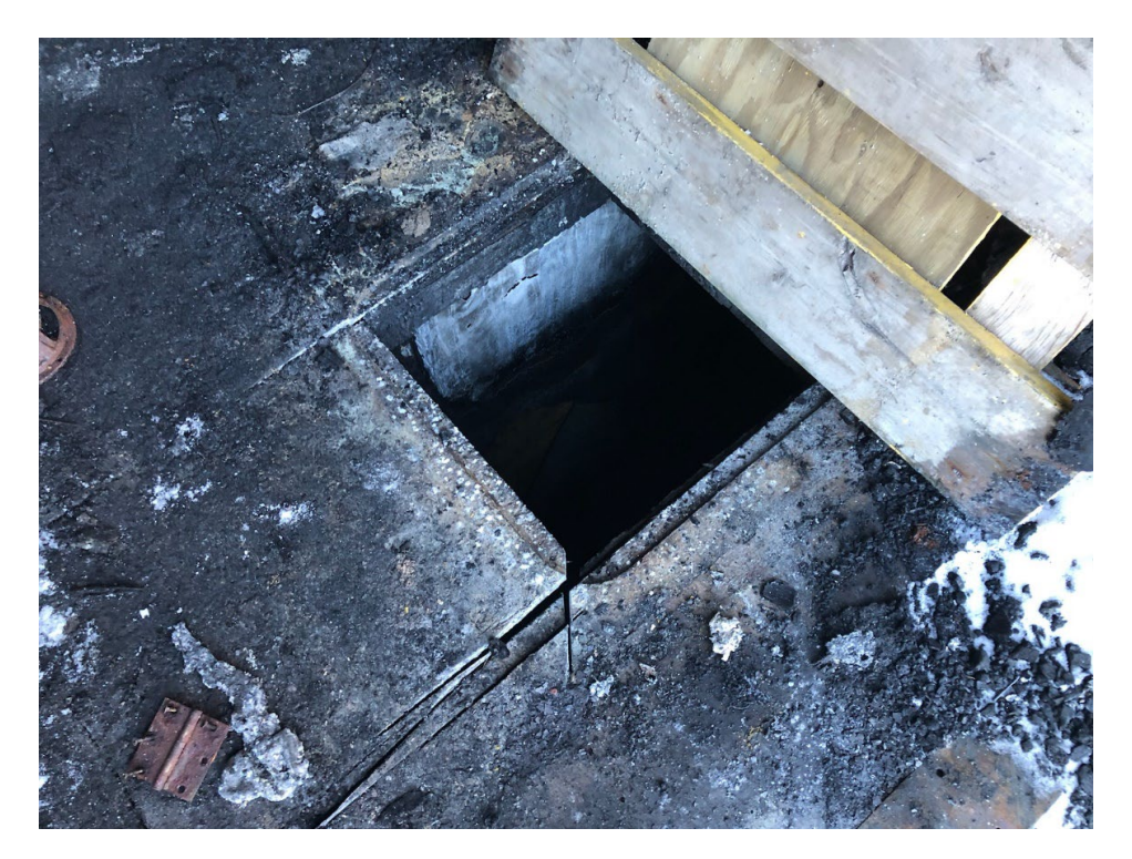
Image no.: 0243 Time: 1002 Description: Close up of escape hatch from lower deck into main cabin.