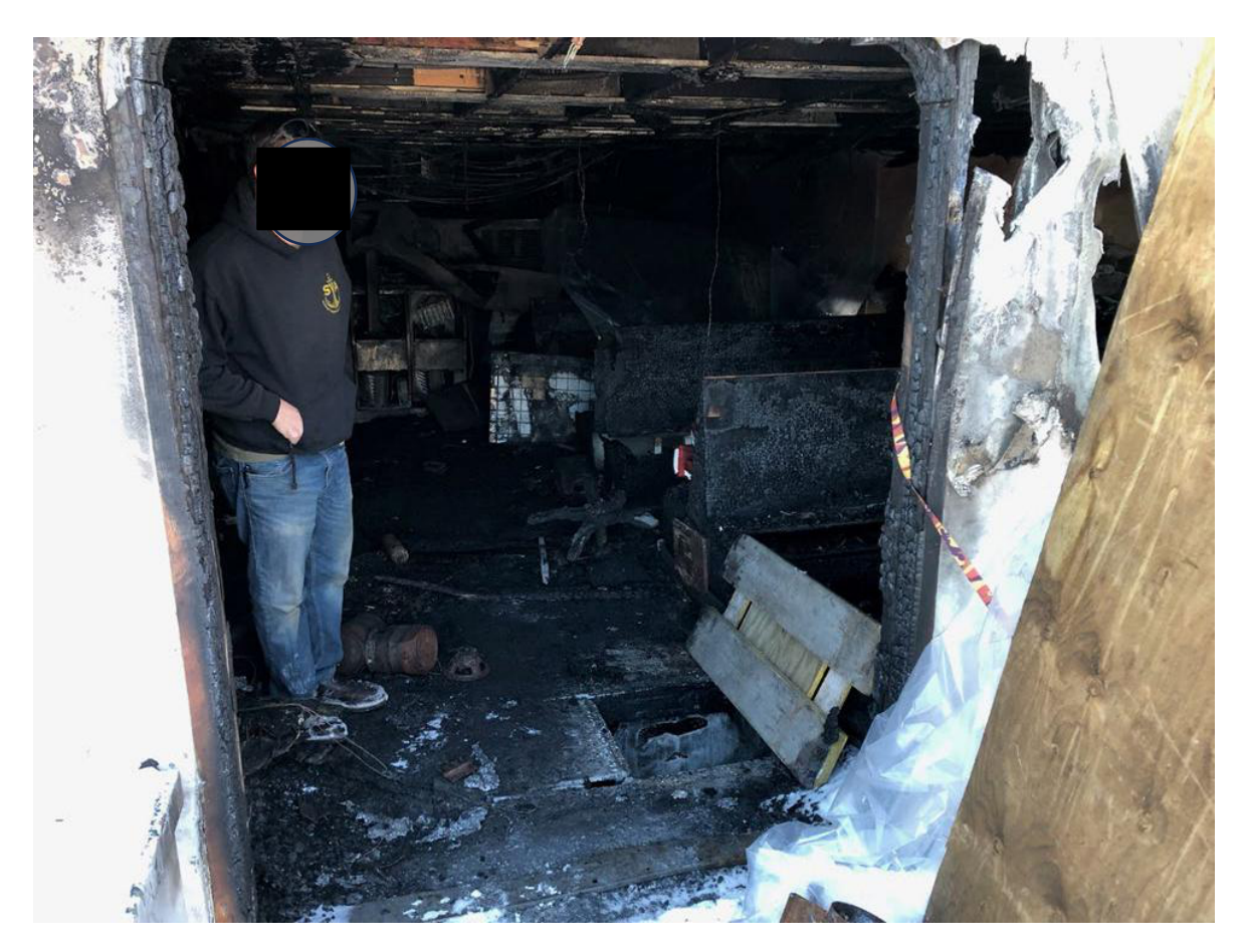
Image no.: 0242 Time: 1002 Description: Looking through aft doors into main cabin from fantail.