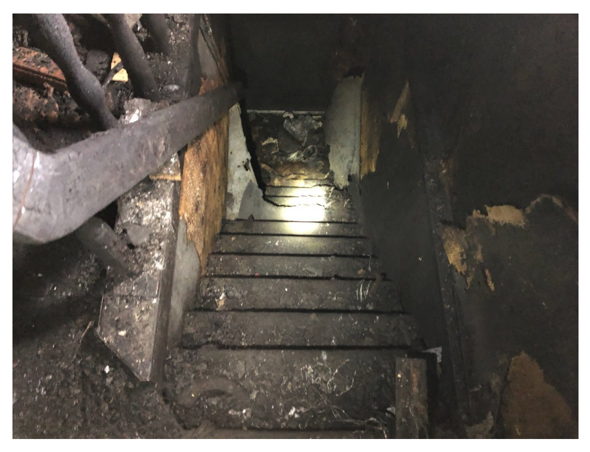
Image no.: 0252 Time: 1004 Description: Descending port stair in main cabin down to after stateroom compartment.