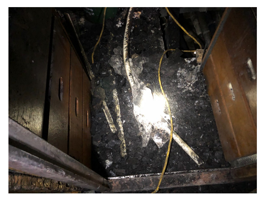
Image no.: 0254 Time: 1005 Description: Stateroom J floor area where welding machine was located.