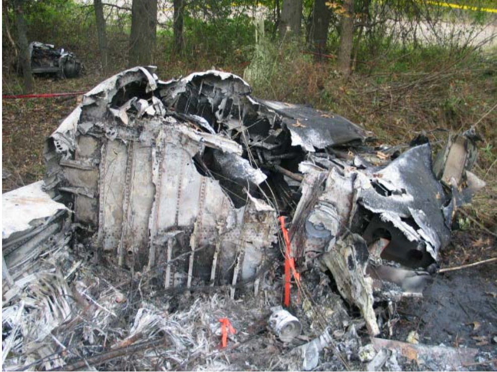
5. View of the aft pressure bulkhead that was found resting on its left side.