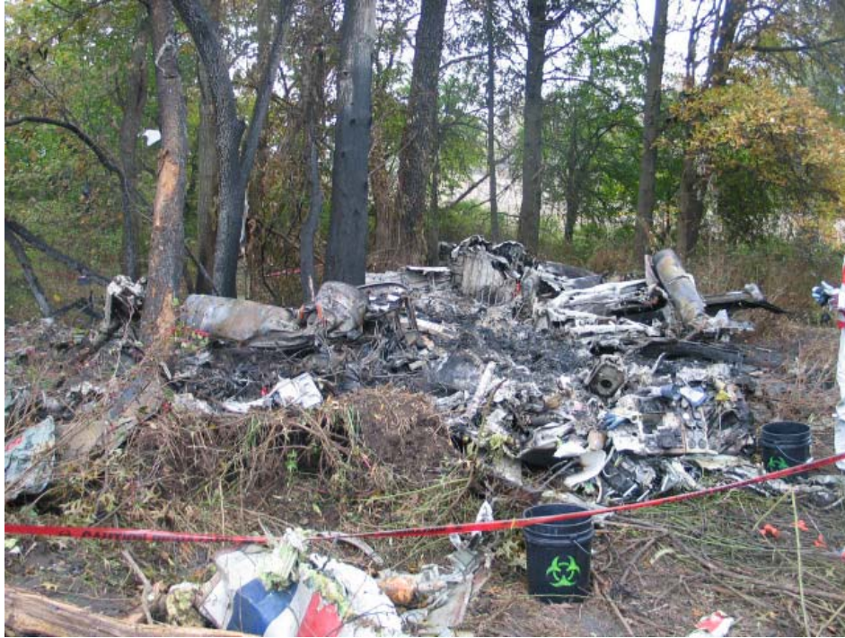
1. View of the main wreckage

Note: The nose of the airplane is in the foreground and the tail of the airplane in the background of the photograph.