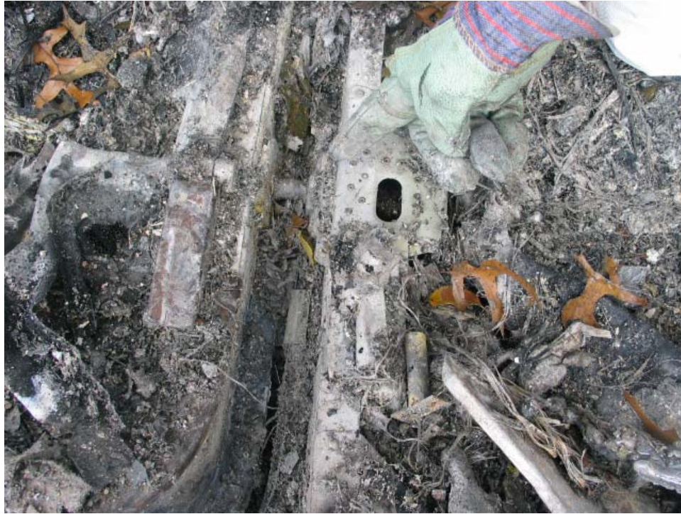
7. View of the main entry door's latching mechanism found in the latched position.