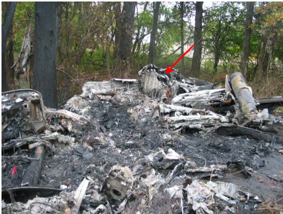
2. View of the wreckage with an arrow pointing to the aft pressure bulkhead that had rolled onto it's left side.

Note: The nose of the airplane is in the foreground and the tail of the airplane in the background of the photograph.