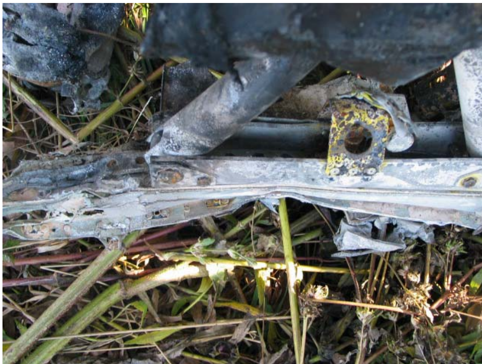
11. View of the Captain's seat that was found in the cockpit wreckage.