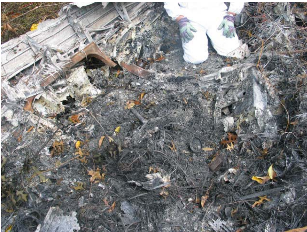
6. View of the aft fuselage and the main entry door that were found resting against the wet ground.