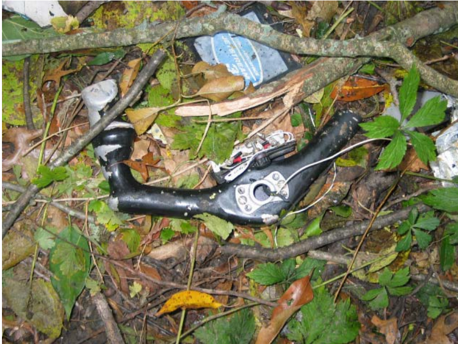
3. View of a crewmember control yoke found near the main wreckage.