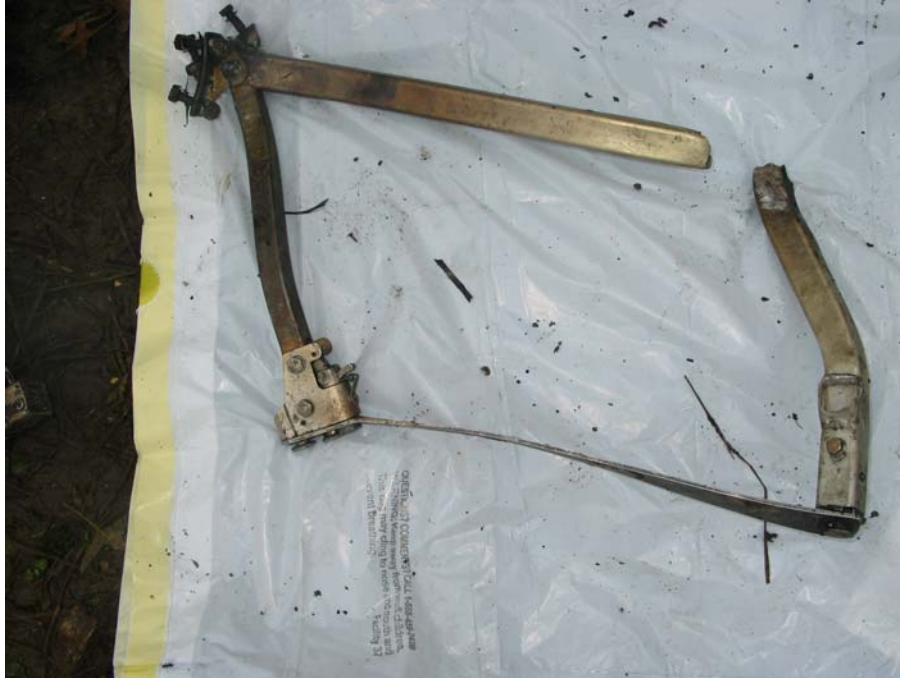
13. View of a bent and distorted seat frame that was recovered near the burned cabin wreckage.