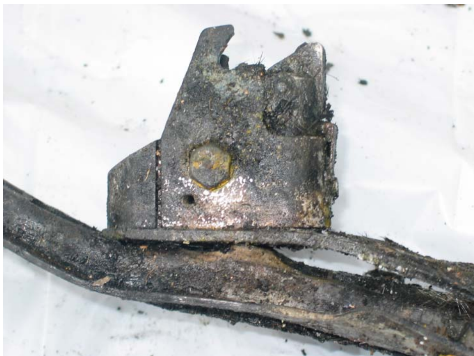
12. View of a forward seat attachment found installed to a section of warped and charred seat track.