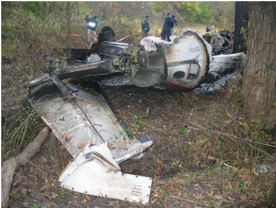
4. View of the main wreckage with the horizontal stabilizer and tail of the airplane in the foreground of the photograph.