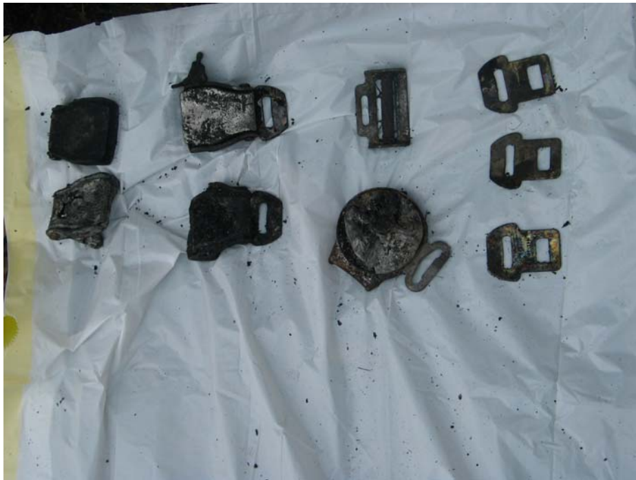
8. View of the seatbelt buckle pieces that were found in the burned and charred cockpit and cabin wreckage.