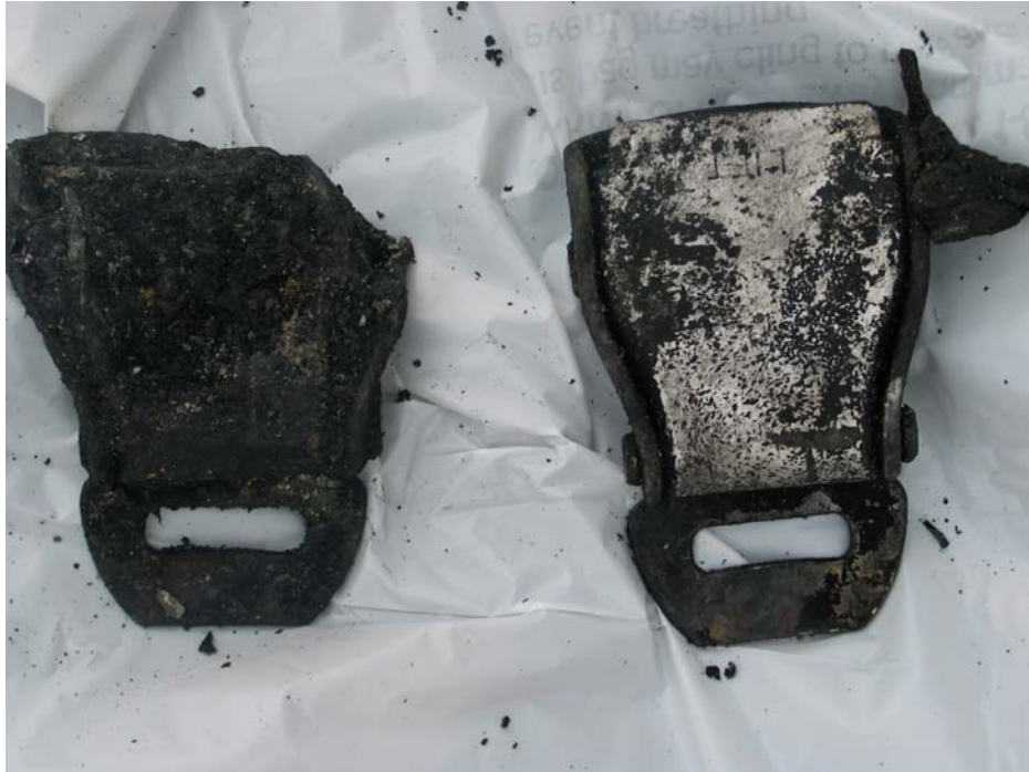
9. View of two seatbelt buckles that were found in the latched position.