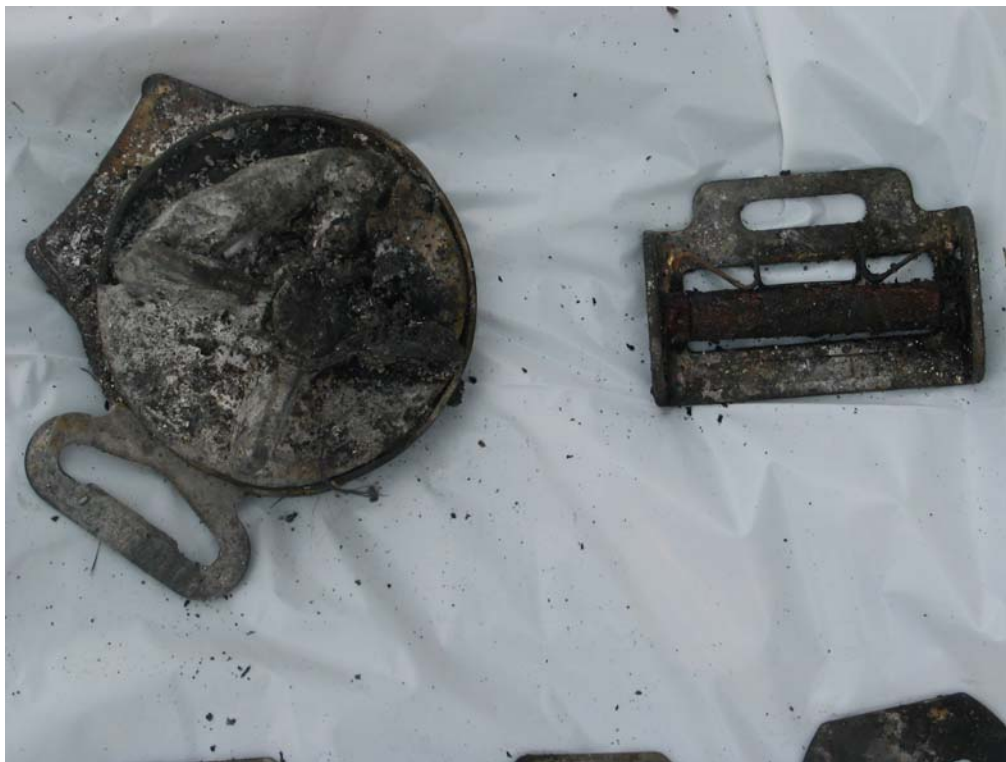
10. View of a crewmember seatbelt buckle and a shoulder harness adjustment bracket that were recovered near the cockpit area of the wreckage.