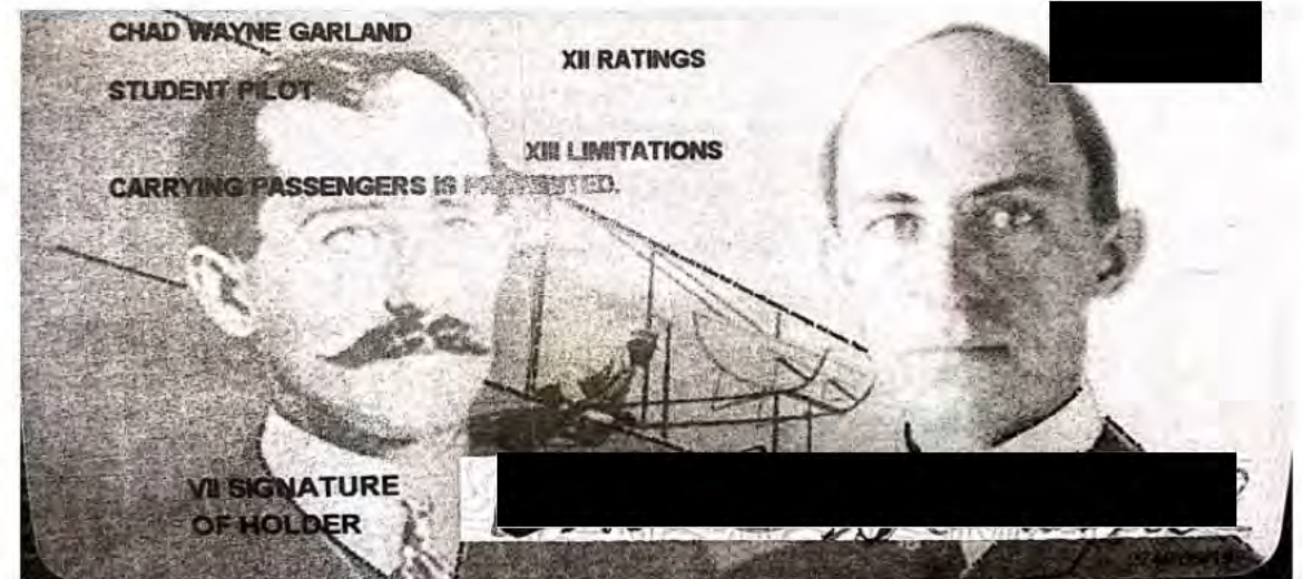
Figure 7 – Student pilot certificate, with limitations of “CARRYING PASSENGERS IS PROHIBITED”