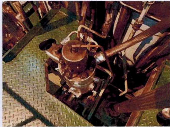
No.1 Fuel Pump