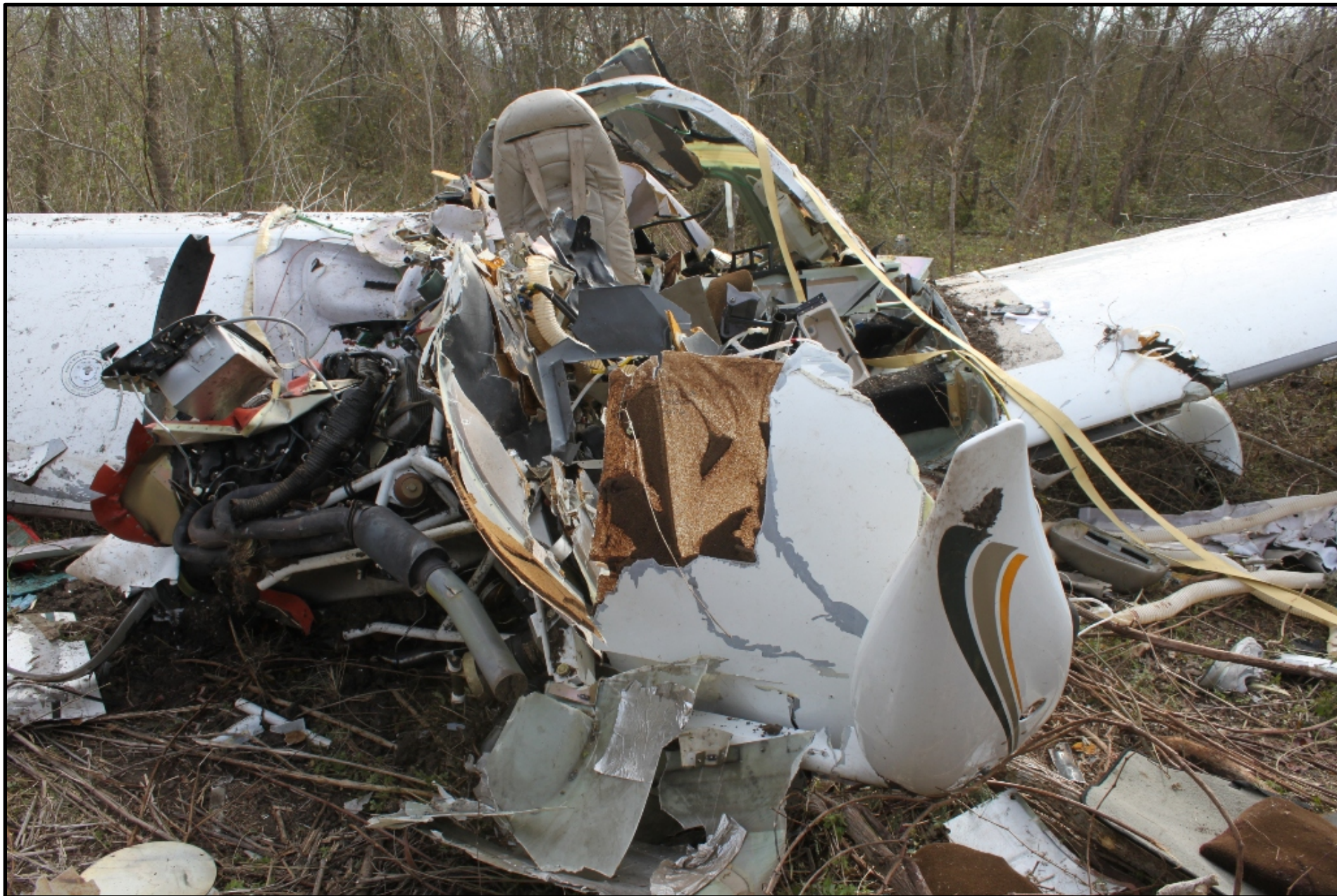
Photo 6 - Fuselage