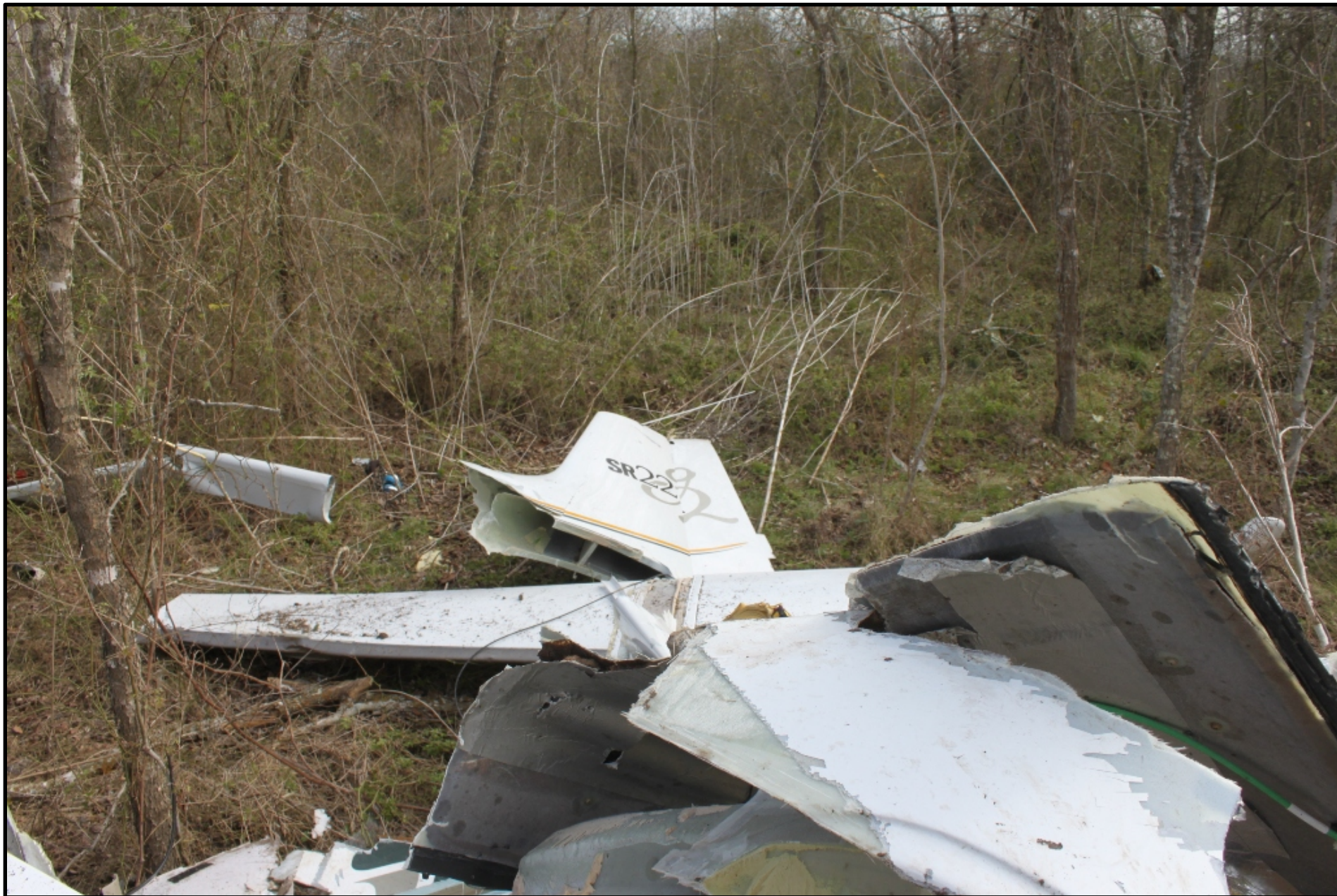
Photo 9 - Empennage