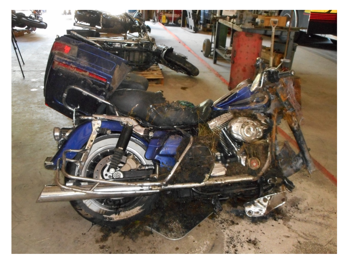
Photo 11 – View of 2007 Harley Davidson Electra Glide Ultra Classic FLHTCU.