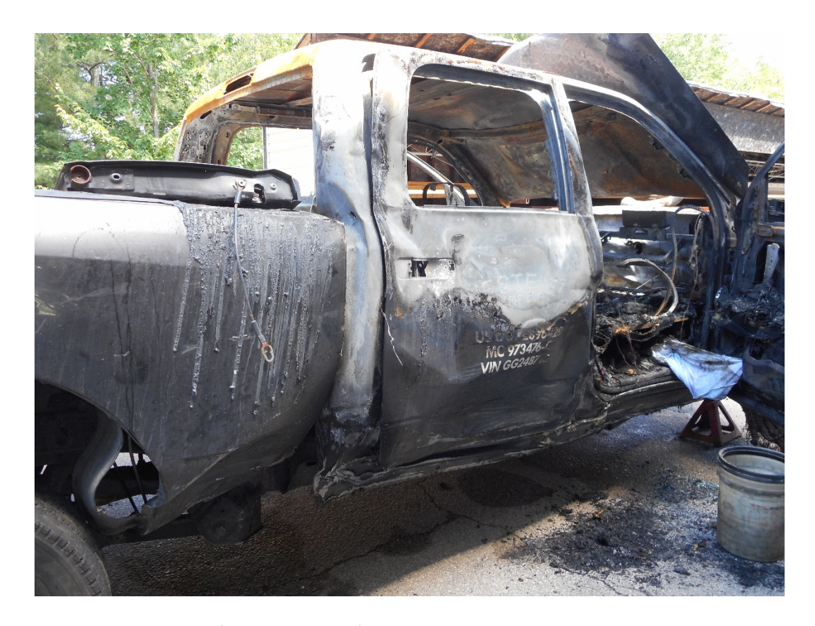
Photo 3 – Right side view of damage and deformation to 2016 Ram 2500.