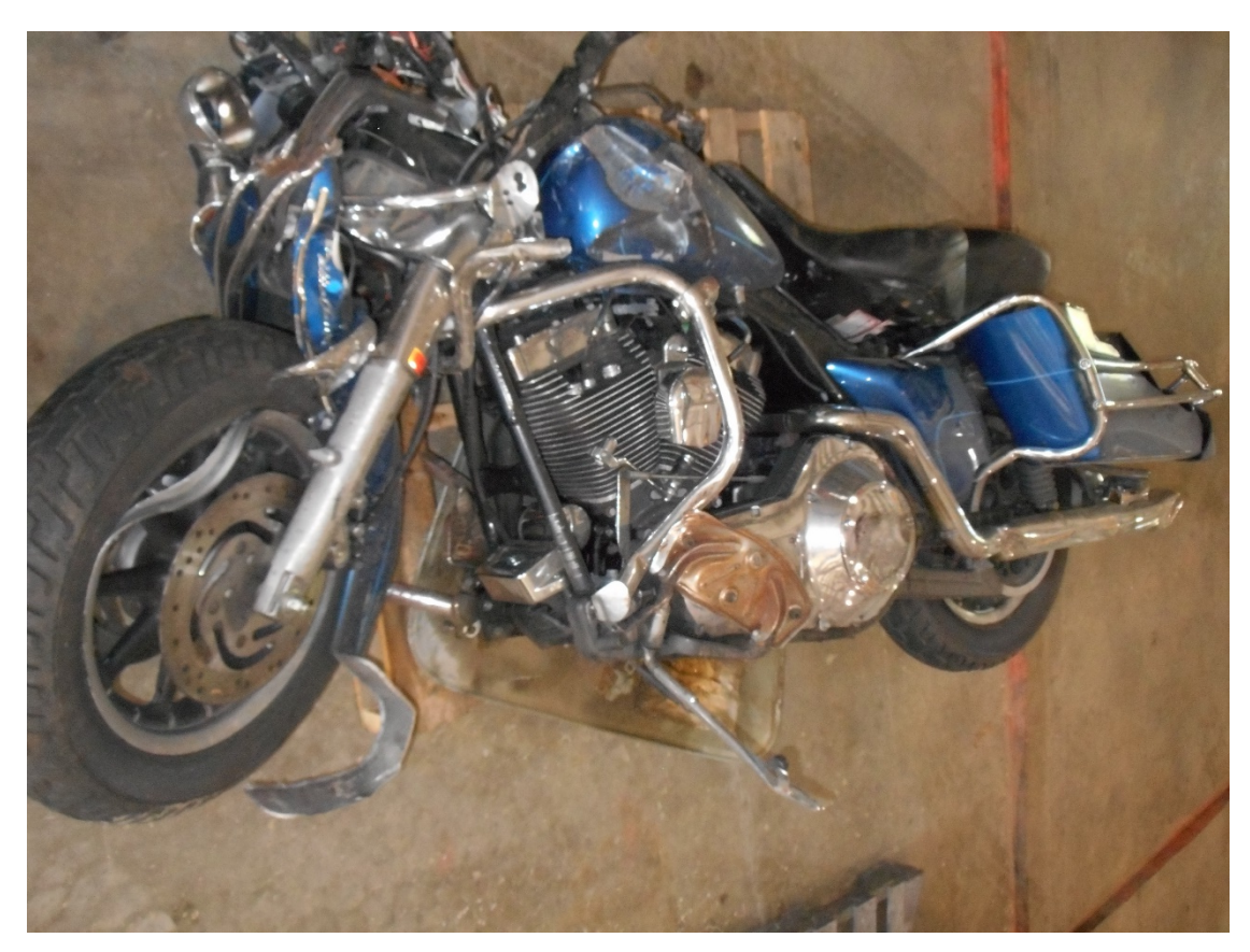
Photo 10 – View of deformation to 2005 Harley Davidson Electra Glide Ultra Classic FLHTCUI.