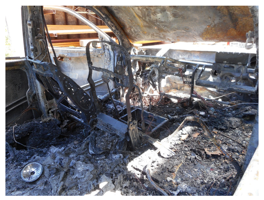
Photo 5 – Interior view from outside right rear passenger window of postcrash fire damage to interior of 2016 Ram.