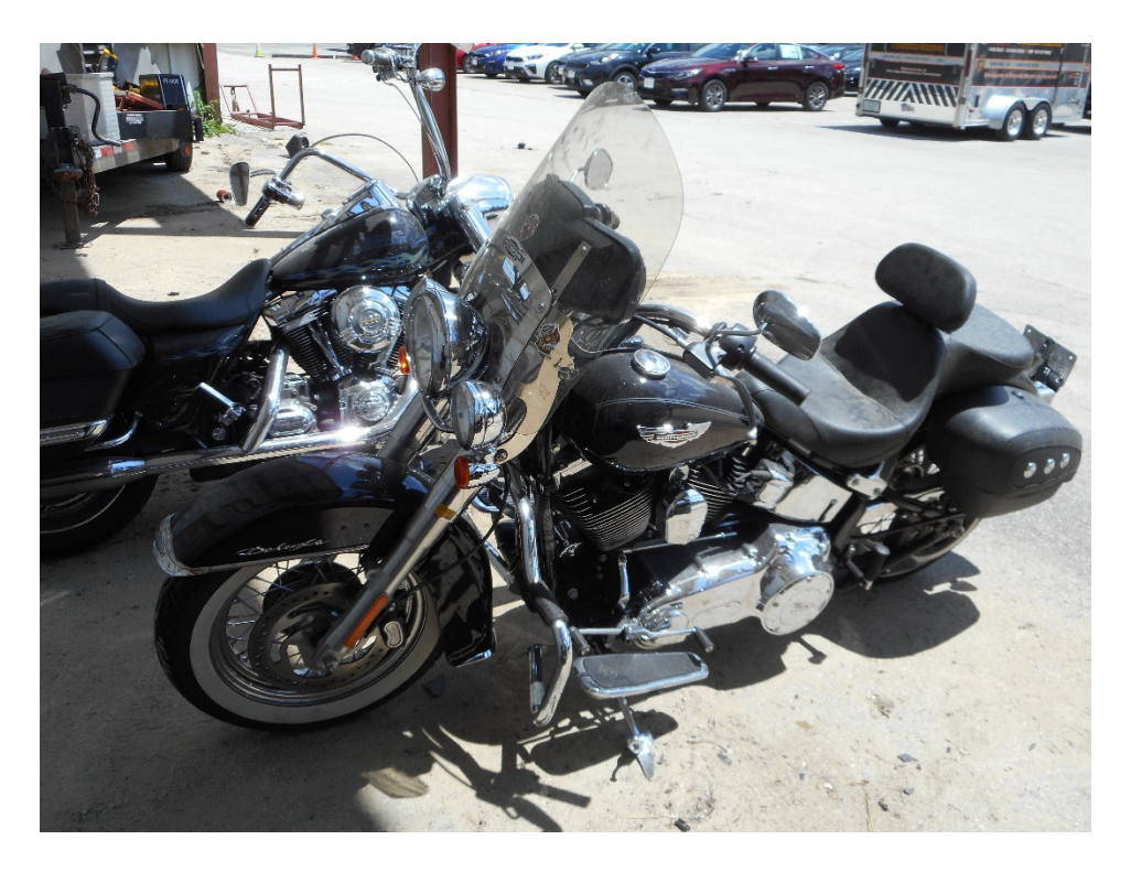
Photo 13 – View of minor damage to 2015 Harley Davidson Softail Deluxe FLST.