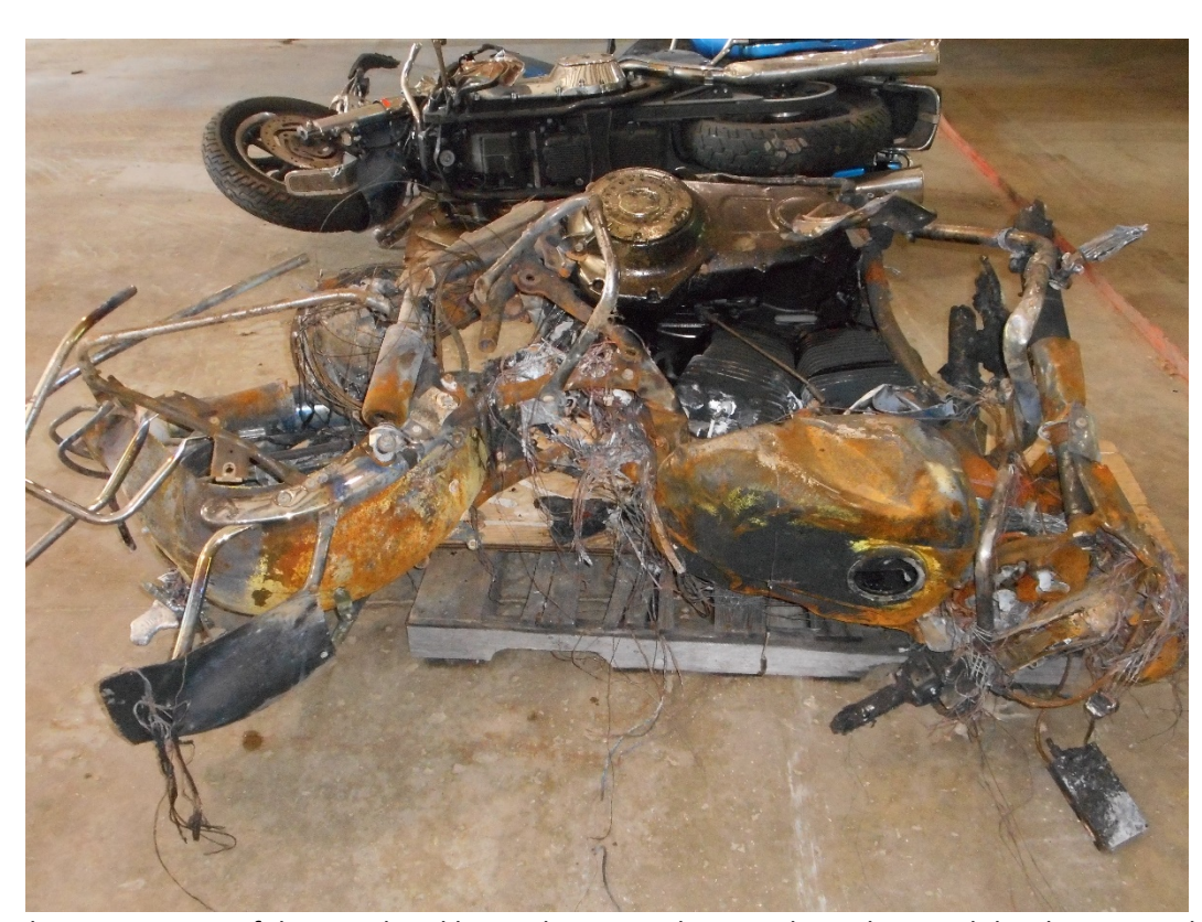
Photo 12 – View of damaged and burned 2012 Harley Davidson Electra Glide Ultra Limited FLHTK EL.