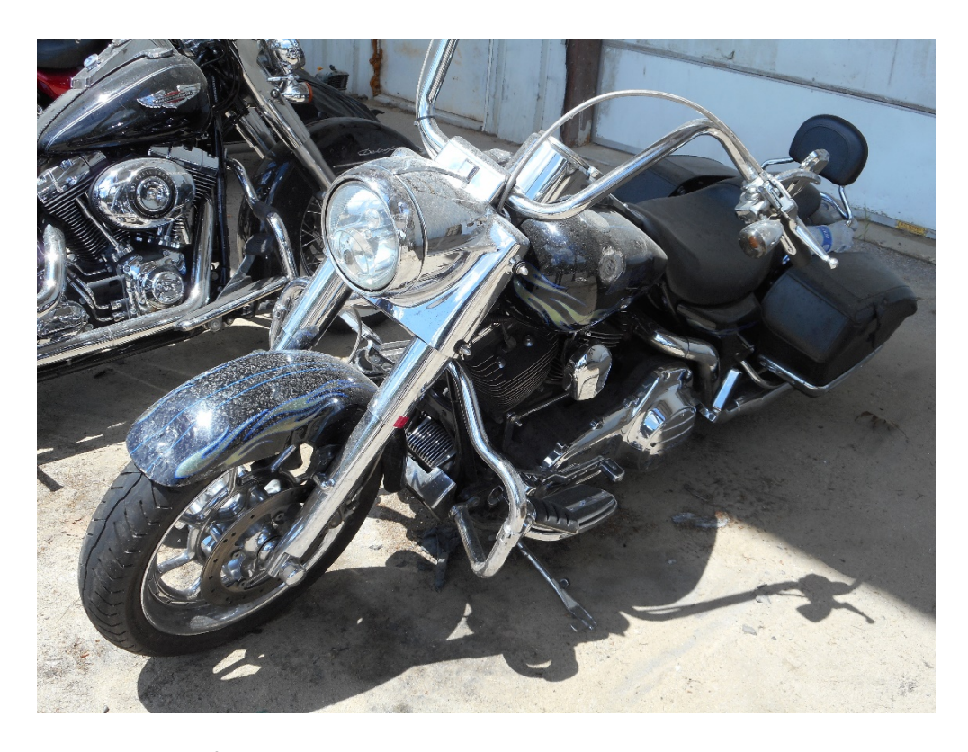
Photo 14 – View of minor damage to 2007 Harley Davidson CVO Road King FLHSE3.