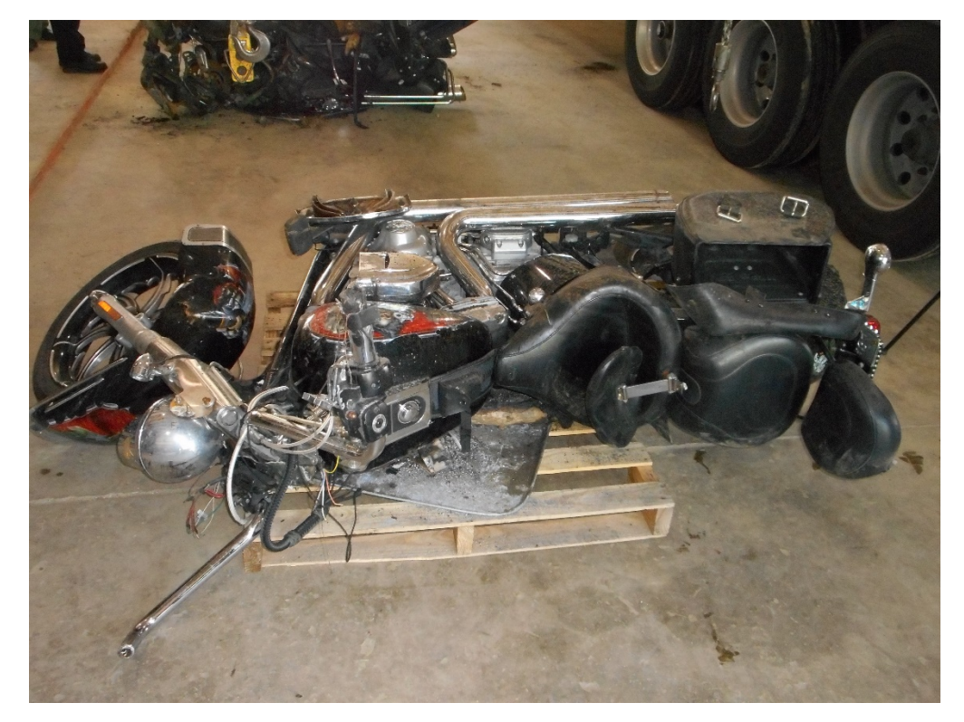
Photo 7 – View of deformation to 2006 Harley Davidson Heritage Softail FLSTI.