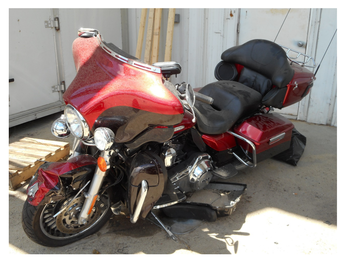
Photo 9 – View of damage to 2012 Harley Davidson Electra Glide Ultra Unlimited FLSTI.