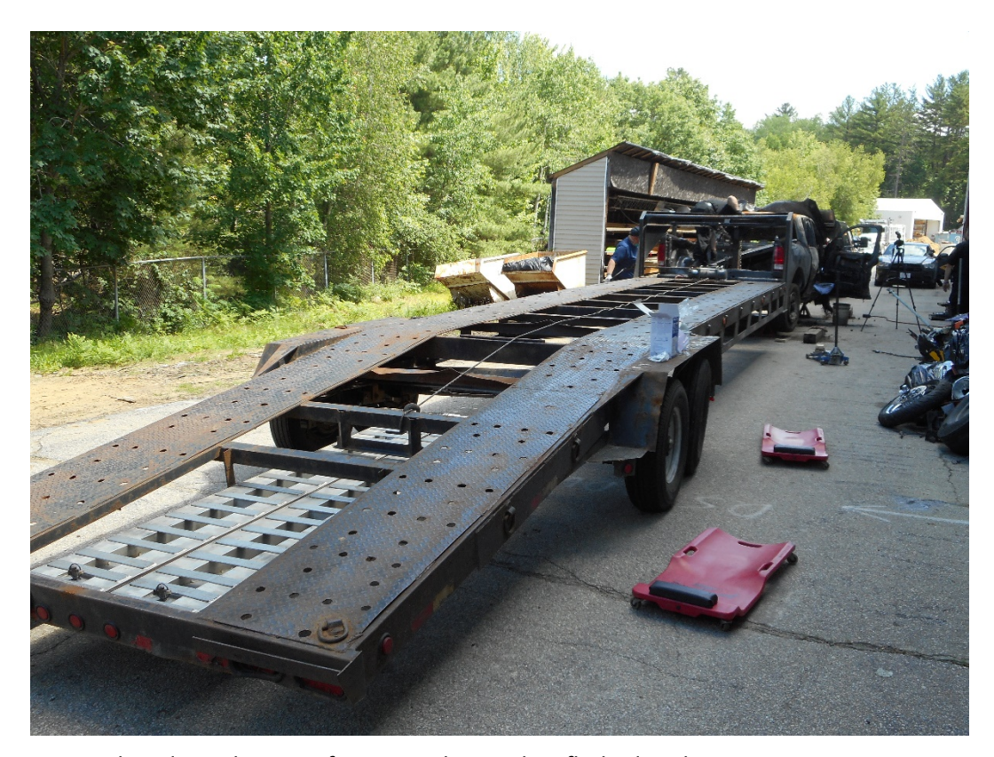
Photo 4 – Right side angle view of 2015 Quality Trailers flatbed trailer.