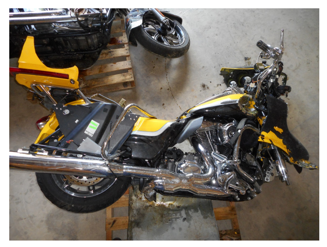
Photo 8 – View of front-end deformation to 2012 Harley Davidson FLHTKCUSE7.