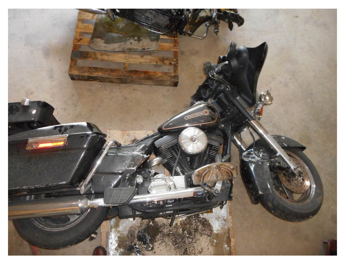
Photo 6 – Right side view of deformation to 1998 Harley Davidson Electric Glide FLHT.