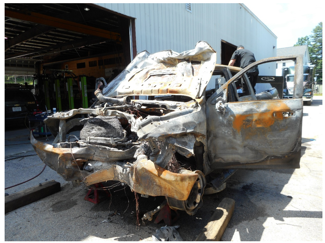
Photo 1 – Frontal left angle view of deformation to front of 2016 Ram 2500 pickup truck.