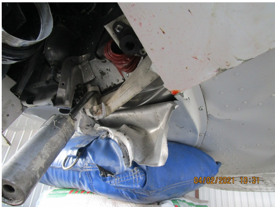
Figure 1: Horizontal Ripples in Firewall