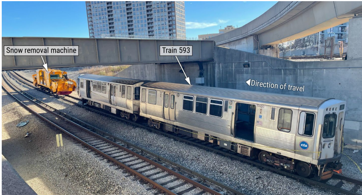
Figure 4. Train 593 and the snow removal machine on the Yellow Line after the accident.