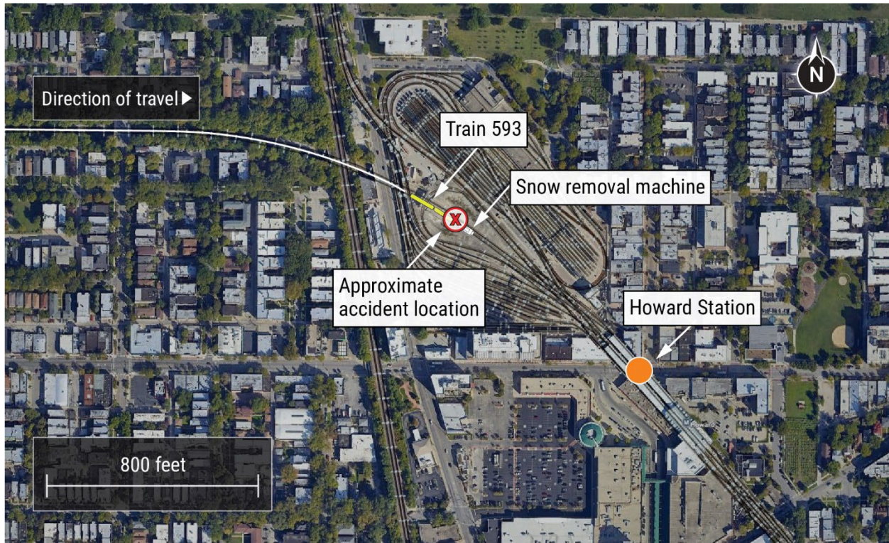
Figure 1. Overview of the accident site.