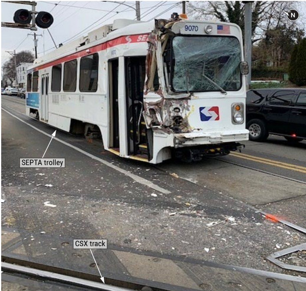
Figure 2. Damaged trolley and CSX track.

collided with the trolley at 8:25:38 a.m. at a speed of 22 mph. The train struck the right front and side of the trolley, pushing it backwards (west) but not derailing it. 5 (See figure 2.)