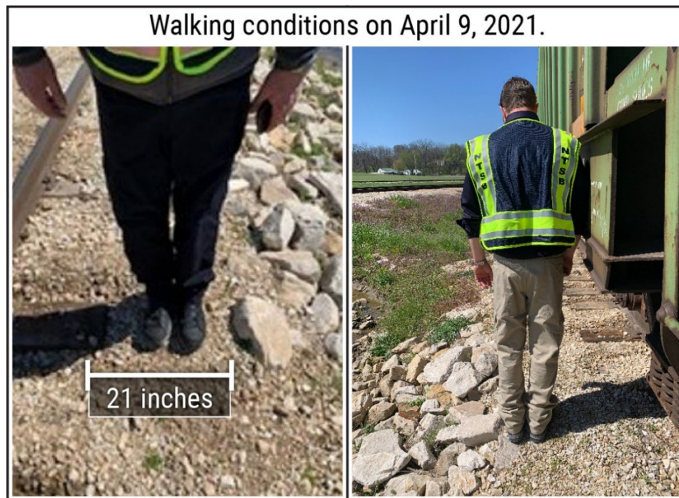
Figure 3. Measurement of the walking space near the accident location.

The track at the accident location was maintained by Dyno Nobel. On April 9, 2021, NTSB investigators inspected the area of the accident and took measurements of the walking space. At the time of this measurement, there was only 21 inches of walking space between the end of the crosstie and the large rocks. (See figure 3, left.) Further, during these inspections, investigators noted insufficient walking space; large rocks were located on the south side of the track near a decline leading to a drainage ditch. (See figure 3, right.)