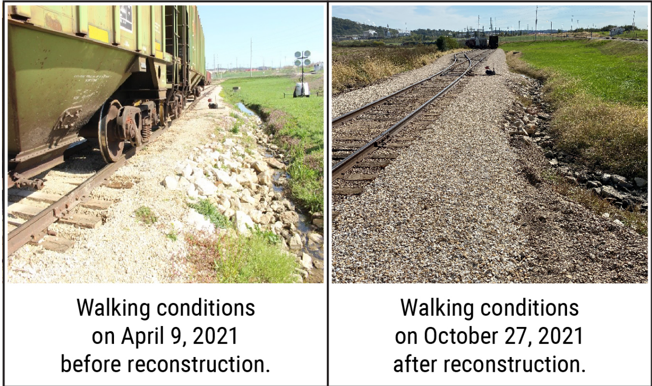
Figure 4. Walking conditions at the time of the accident ( left ) and walking conditions after reconstruction ( right ).