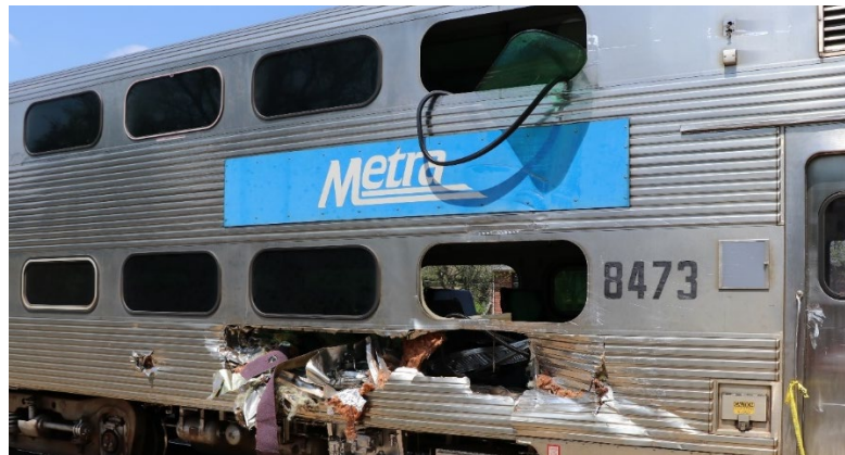
Figure 2. Truck impact damage to side of train cab car.

The following parties are working with the NTSB investigation: