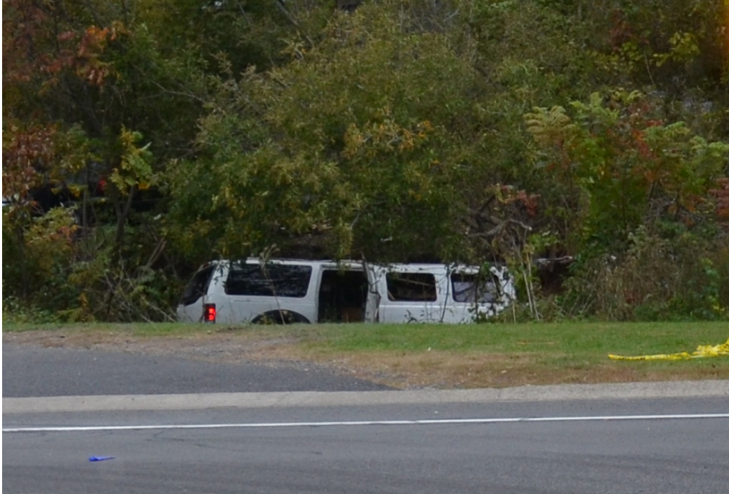
Figure 2. Crash-involved 2001 Ford Excursion stretch limousine at final rest in the ravine.

The original 137-inch-long wheelbase for the 2001 Ford Excursion had been lengthened by 180 inches to increase the seating capacity to 18 occupants (including the driver). To accommodate the additional passenger capacity, non-OEM (original equipment manufacturer) seats were installed in the vehicle. These non-OEM seats were equipped with lap belts and oriented passengers away from a traditional forward-facing seating configuration. Additionally, the vehicle's increased passenger capacity required the passenger-carrying operations of the limousine to be regulated by the New York State Department of Transportation. The National Transportation Safety Board (NTSB) continues to gather information on the modifications and mechanical condition of the vehicle, the seat belt usage and survivability of the passengers, and the oversight of the passenger-carrying operation by the New York State Department of Transportation and New York State Department of Motor Vehicles.