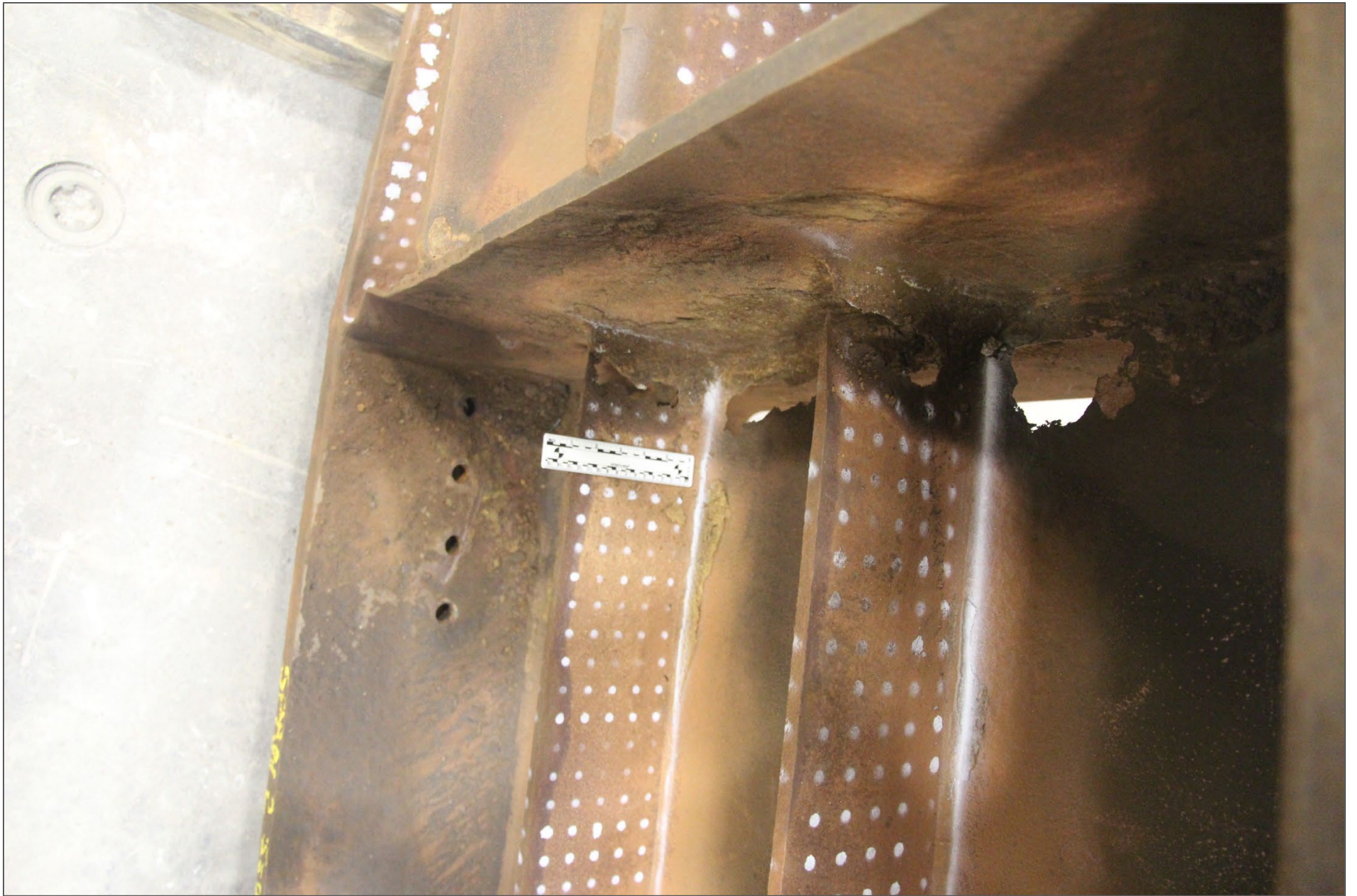
Materials Laboratory Photograph 7 – Northwest Leg, Showing Longitudinal Stiffeners Just Above Transverse Tie Plate