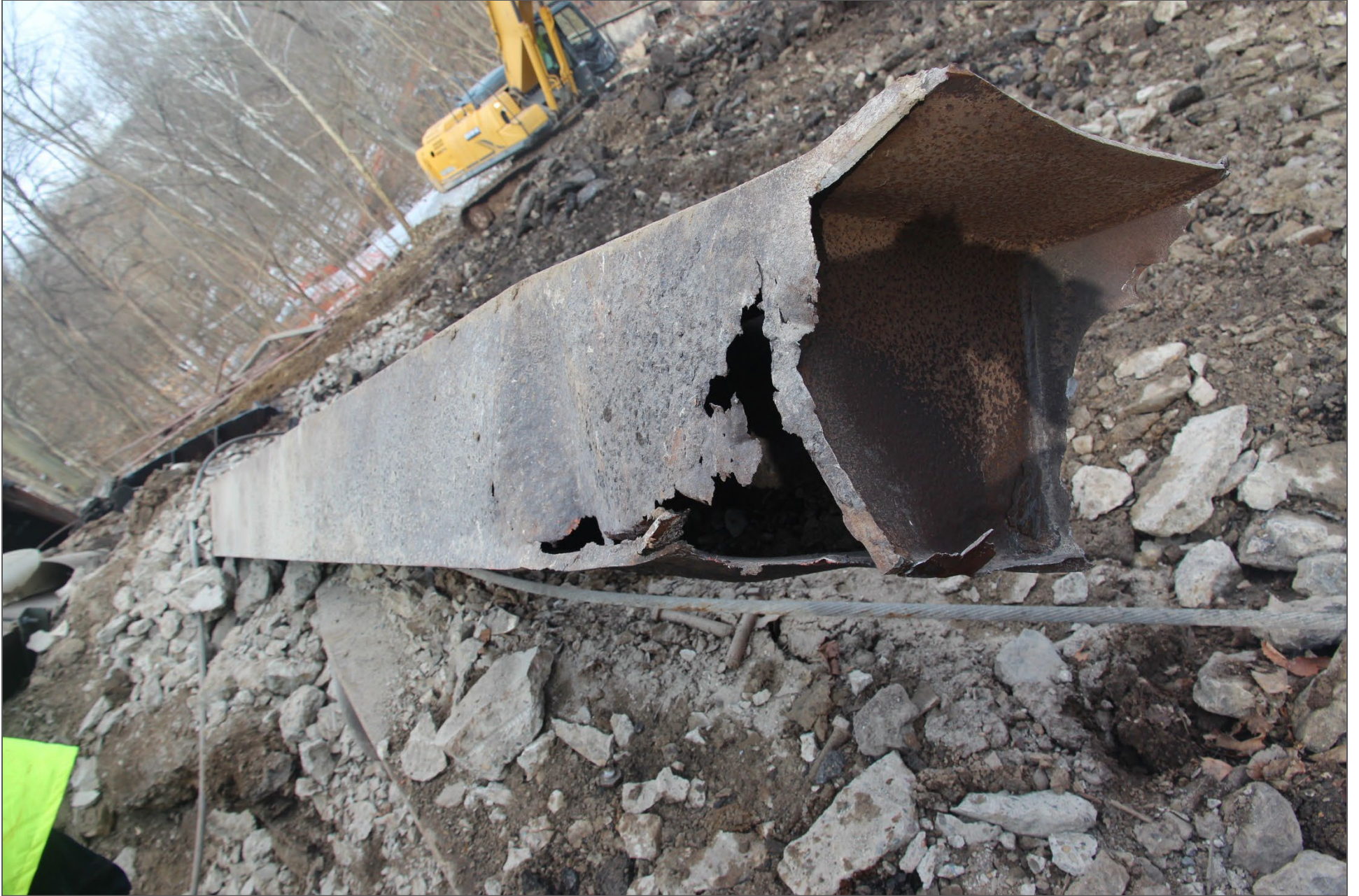
Materials Laboratory Photograph 2 – Portion of Upper Cross-Bracing on West End of Bridge