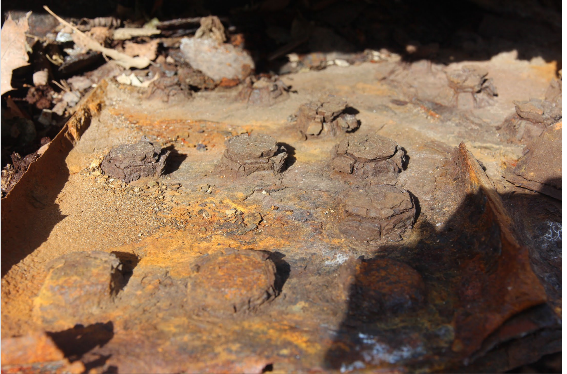
Materials Laboratory Photograph 6 – Closeup Image of Northeast Leg, Mid-length Cross-brace Connection