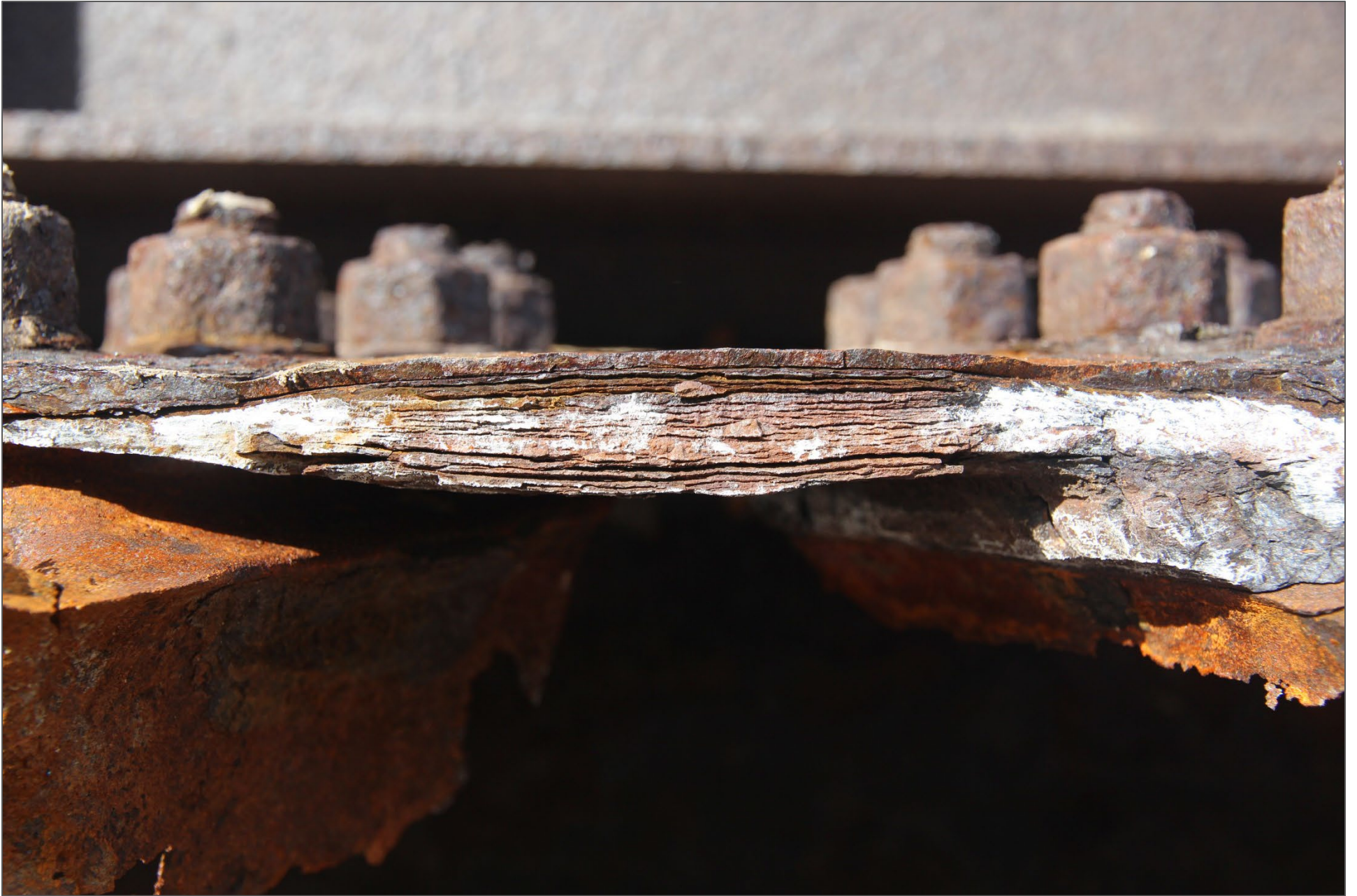
Materials Laboratory Photograph 5 – Closeup Image of Northeast Leg, Mid-length Cross-brace Connection