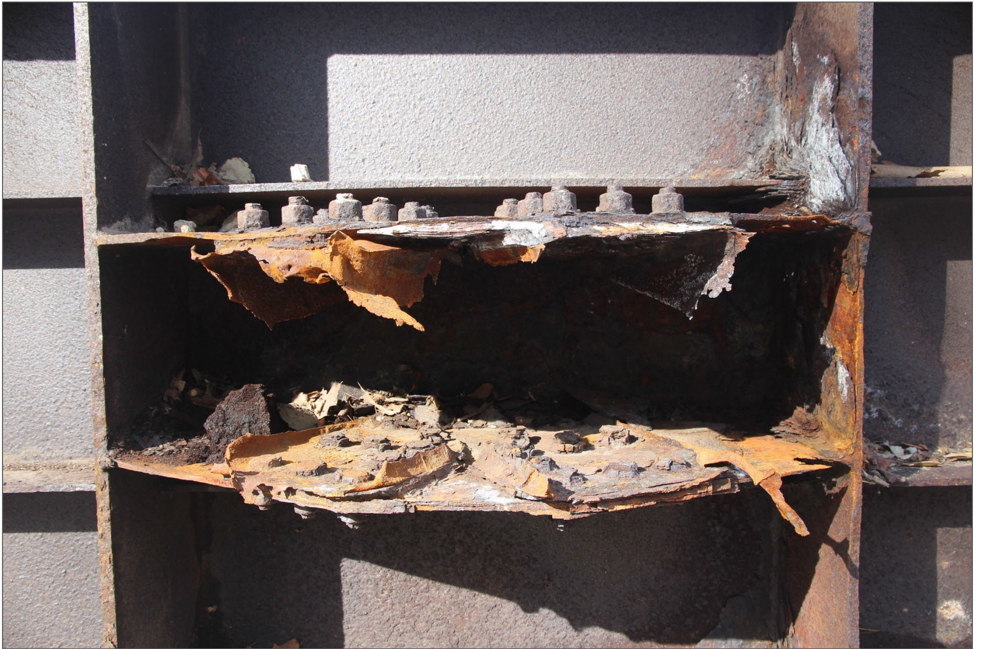
Materials Laboratory Photograph 4 – Northeast Leg, Mid-length Cross-brace Connection