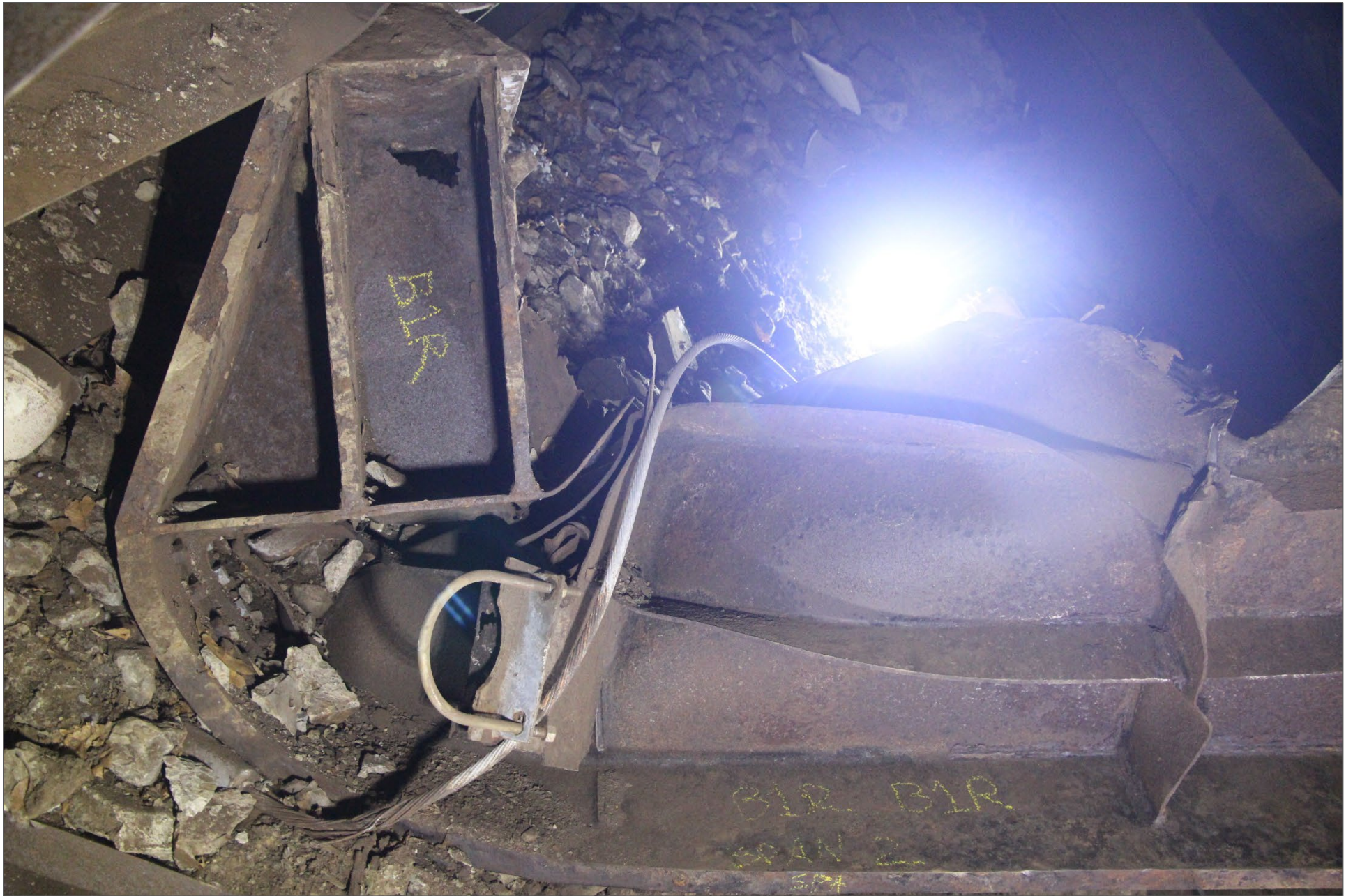
Materials Laboratory Photograph 1 – Southwest Leg Under Collapsed Structure