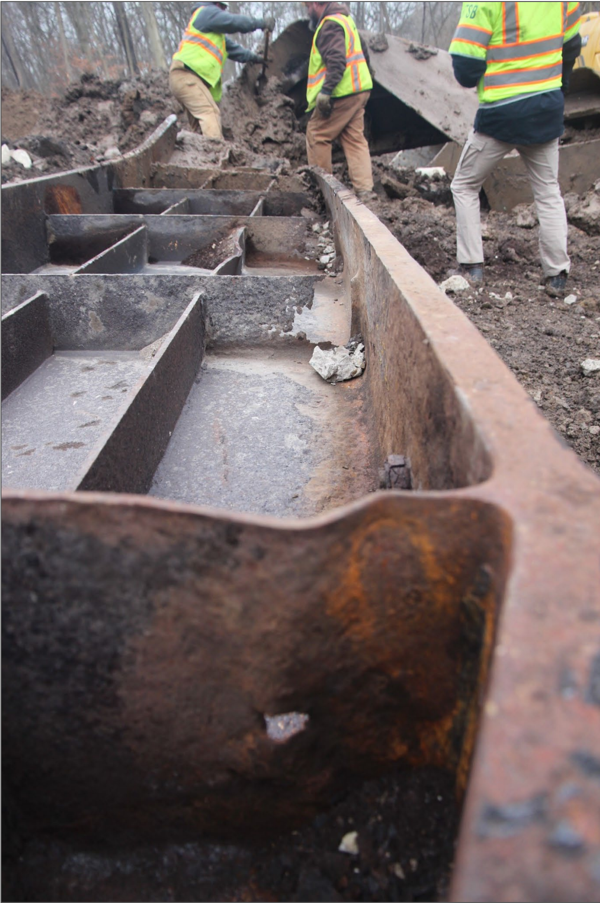
Materials Laboratory Photograph 3 – Northwest Leg Showing Longitudinal Stiffeners, Transverse Stiffeners, and Transverse Tie Plate